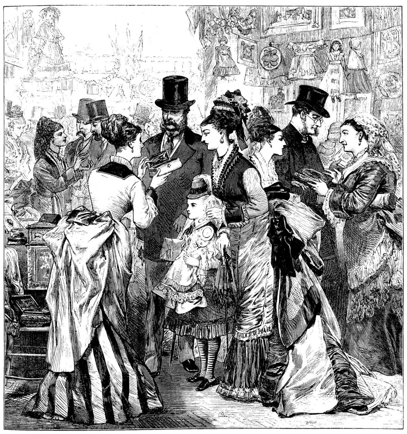
A FASIHONABLE CHARITY BAZAAR,

The illustrated London news. Saturday, June 20, 1874. No. 1817, vol. LXIV. London : William Little, 1874.