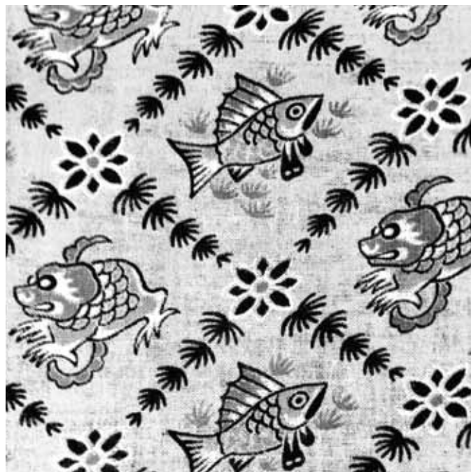
Cloth samples, nd and 1875-1888. Records of United Turkey Red Co. Ltd. Ref: UGD13/9/1 and UGD13/8/6