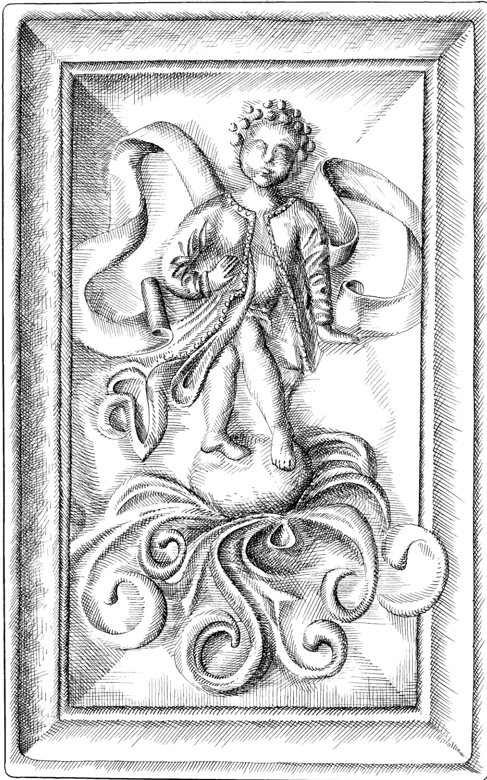
Rectangular stove tile depicting Christ as a Child, mid – 16 th c. Glazed earthenware.