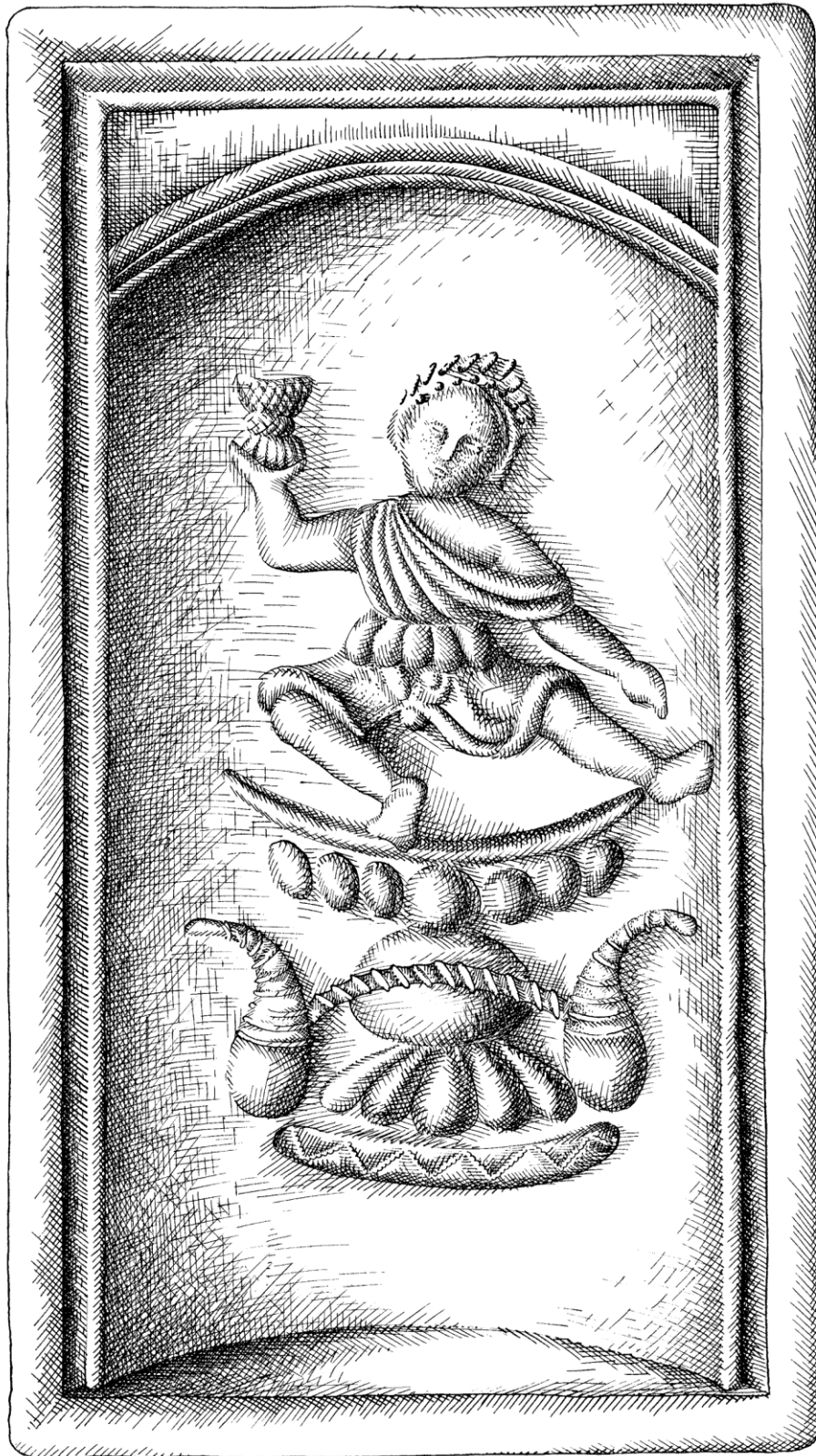
Half - cylindrical stove tile depicting an allegorical figure – Bacchus, second quarter of the 16 th c. Glazed earthenware.