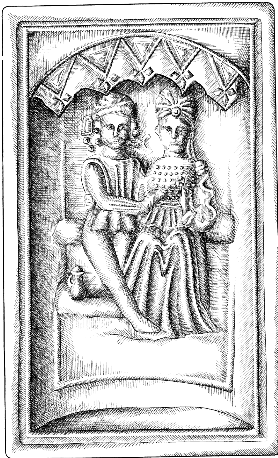
Rectangular stove tile depicting an allegorical figure of Lovers, second quarter of the 16th c. Glazed earthenware.