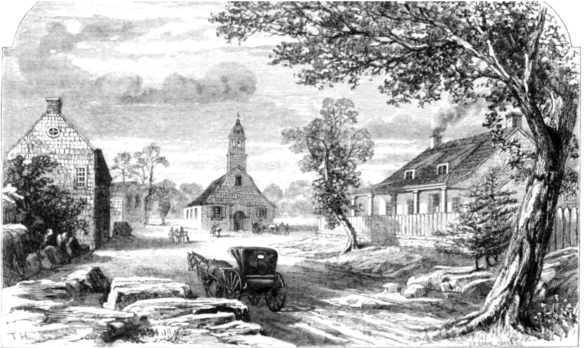
The Brooklyn Church and Duffield House, 1907, v1974.022.1.154

For more coloring pages, visit ColorOurCollections.org