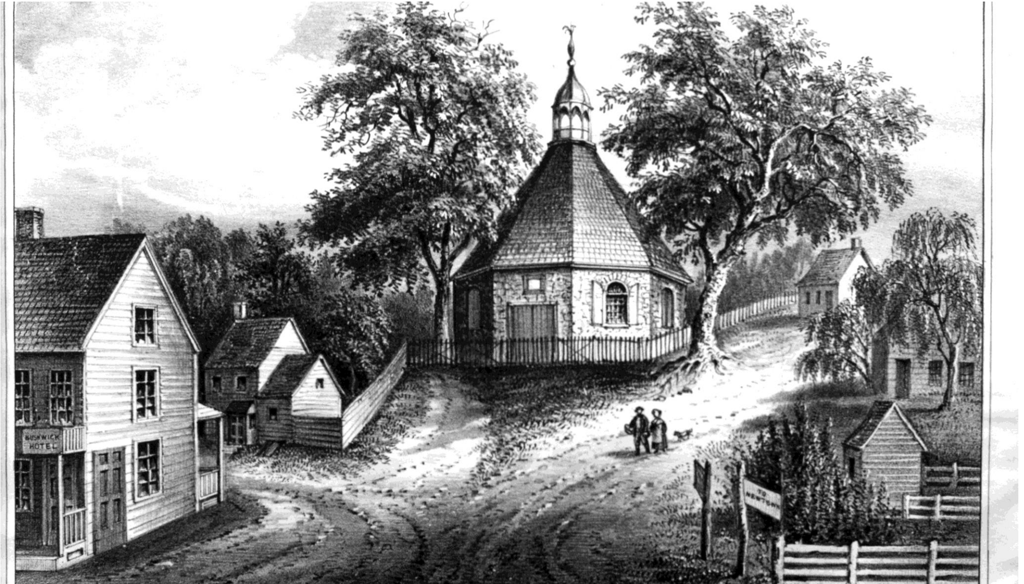
[lithograph of Old Bushwick Church, 1711], 1907

For more coloring pages, visit ColorOurCollections.org