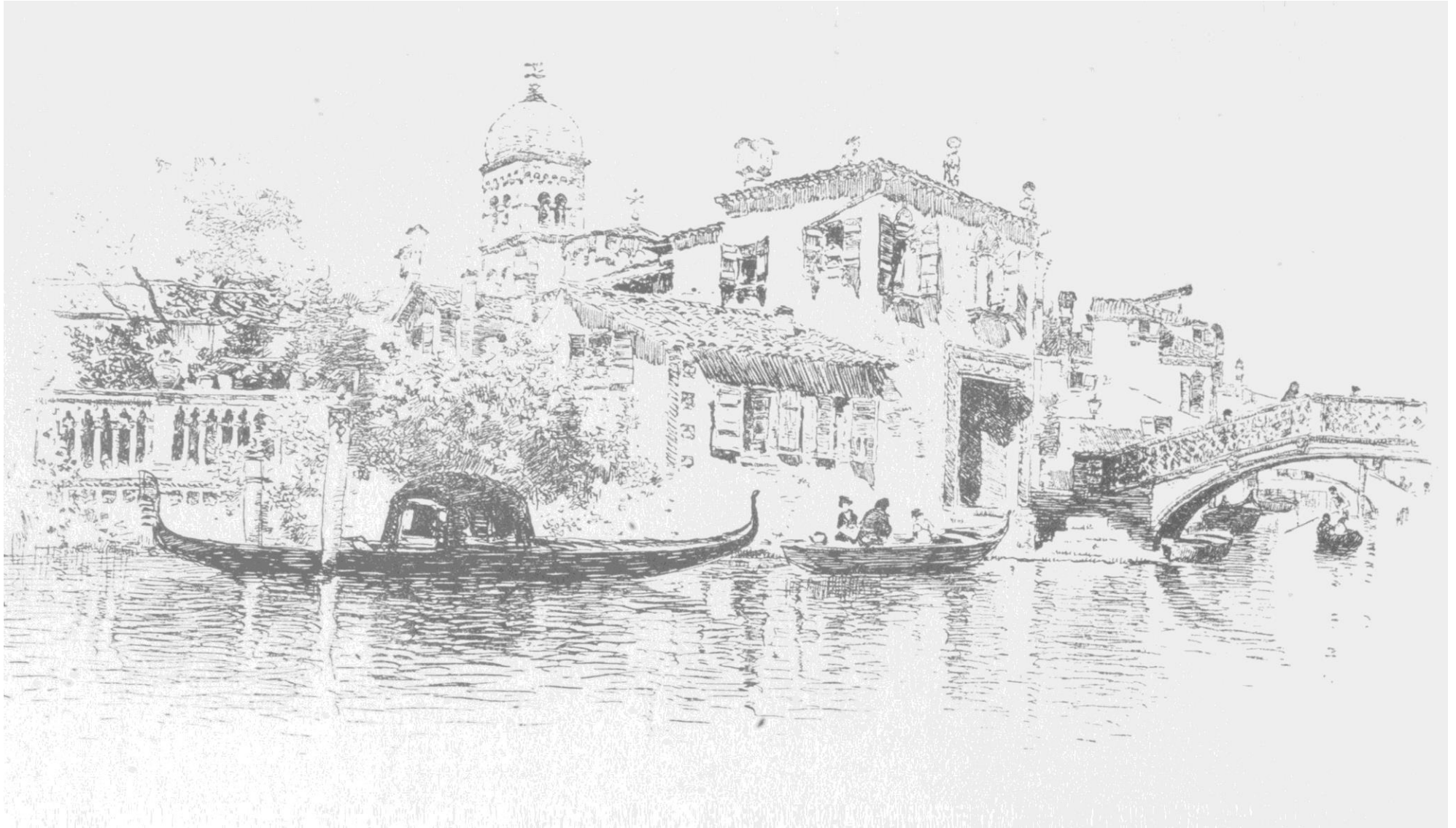
Rico, Martin. A Venetian Canal . Pen drawing. Pen Drawing And Pen Draughtsmen , by Joseph Pennell, London : T. Fisher Unwin ,1921, p.45