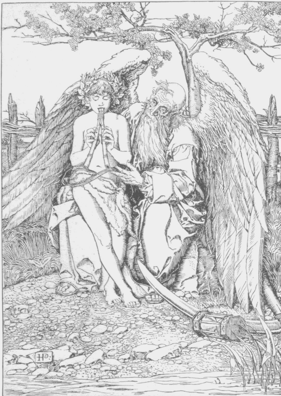
From Pyle's "Wonder Clock."