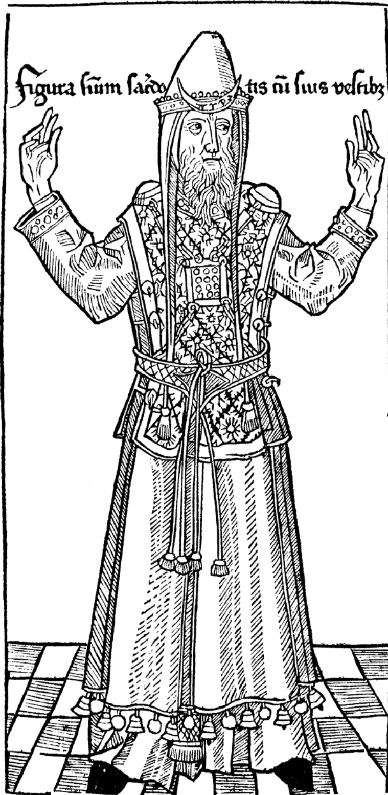
Schedel, Hartmann. Liber Chronicarum [Nuremberg Chronicle]. Nuremberg: Anton Koberger, 1493. German translation from the Latin by George Alt. Illustrated by Michael Wolgemut and Wilhelm Pleydenwurff. Illustration title: "Garments of the High Priest."