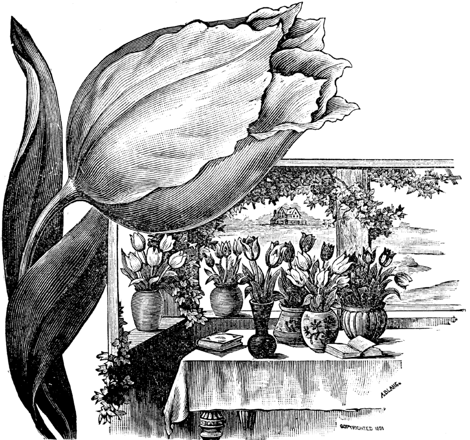
J.M. McCullough's Sons Co., Catalogue of Bulbs Seeds and Sundries , 1907.