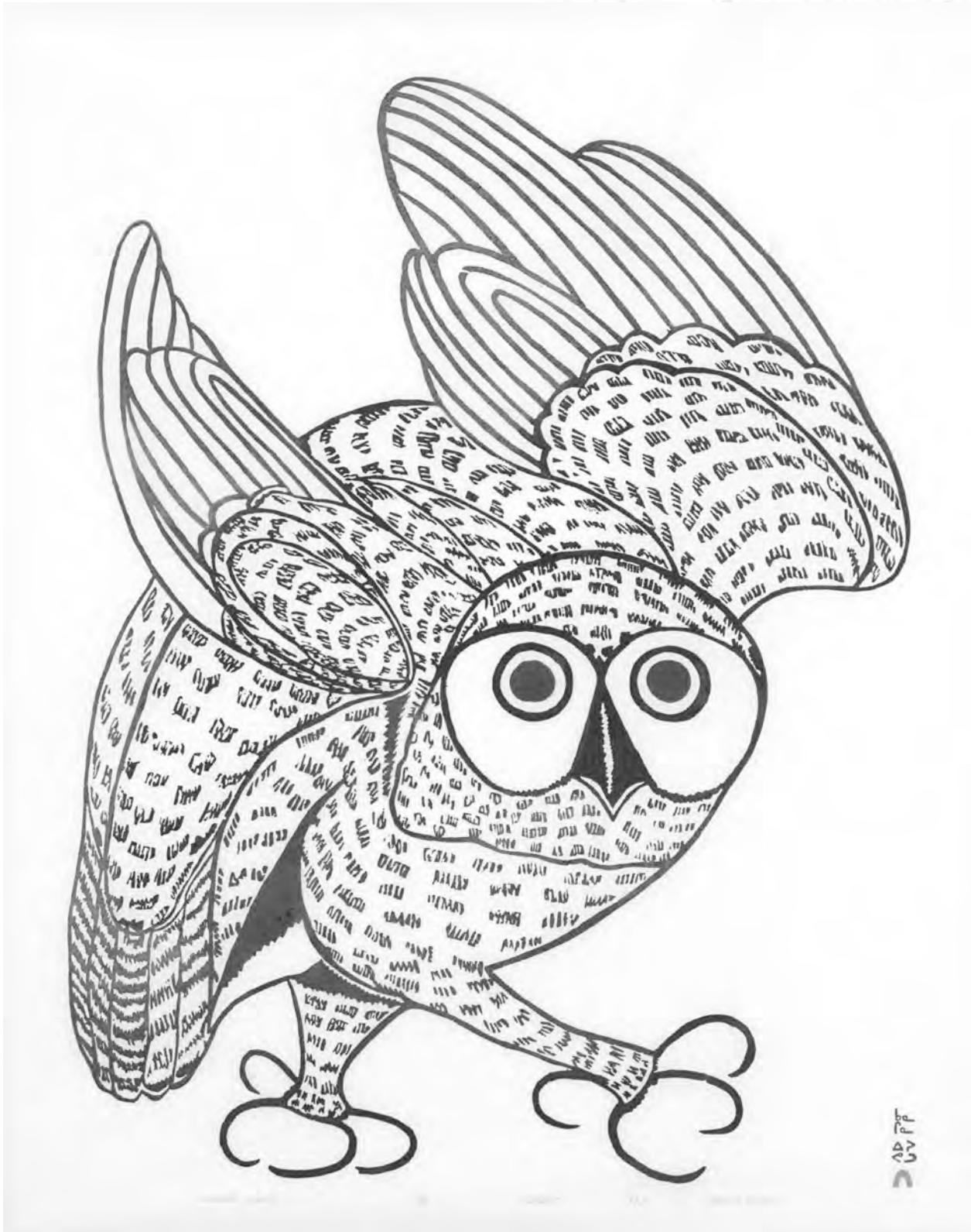
Citation: Pootoogook, Kananginak. Summer Owl . 1972. ID#: 14.1011. Tulsa: Gilcrease Museum, https://collections.gilcrease.org/object/141011