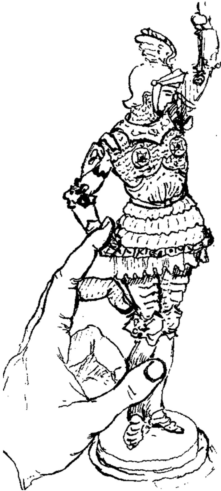
A sketch of hands and head of small statue by John Quincy Ward, circa 1830-1910

Drawn with black ink on woven paper with printed ruling lines. (GLC06343.153)