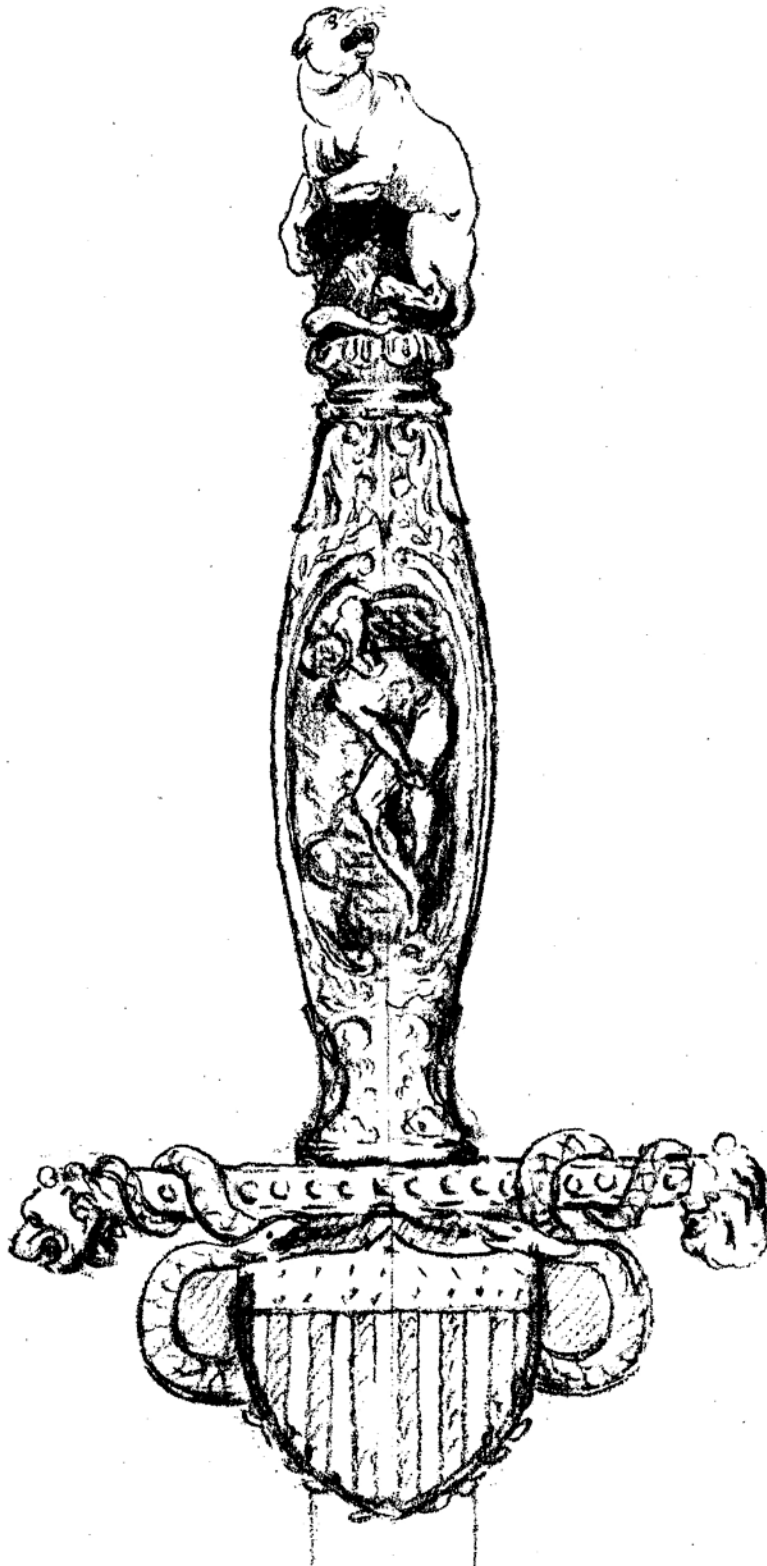
A sketch of a decorative sword hilt with lion, warrior, & serpent by John Quincy Ward, circa 1830-1910

Drawn with charcoal and chalk on woven paper (GLC06343.158)