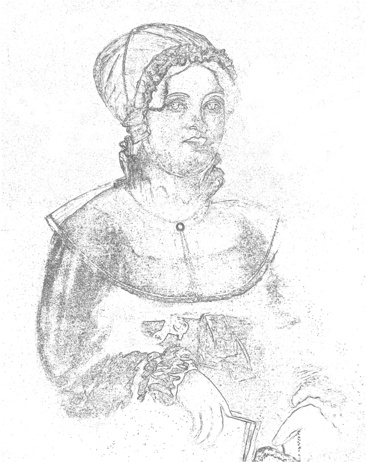
Portrait of Rebecca Lukens, Born 1794 – Died 1854. www.steelmuseum.org