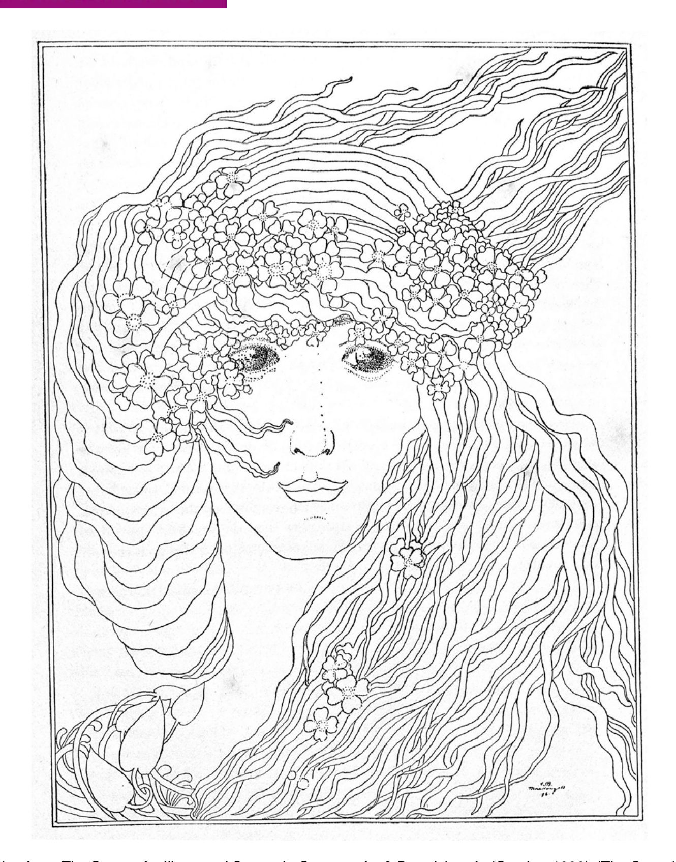
Illustration from The Savoy: An Illustrated Quarterly . Symons, A., & Beardsley, A. (October 1896). 'The Savoy' No. 6. London: L. Smithers.