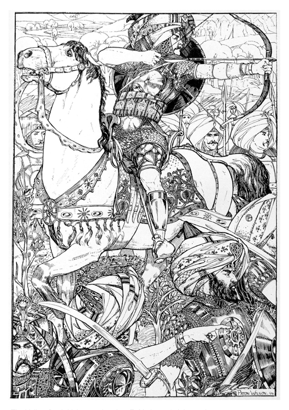
Illustration from The Yellow Book. Volume 4. London: E. Mathews & J. Lane, January 1895.