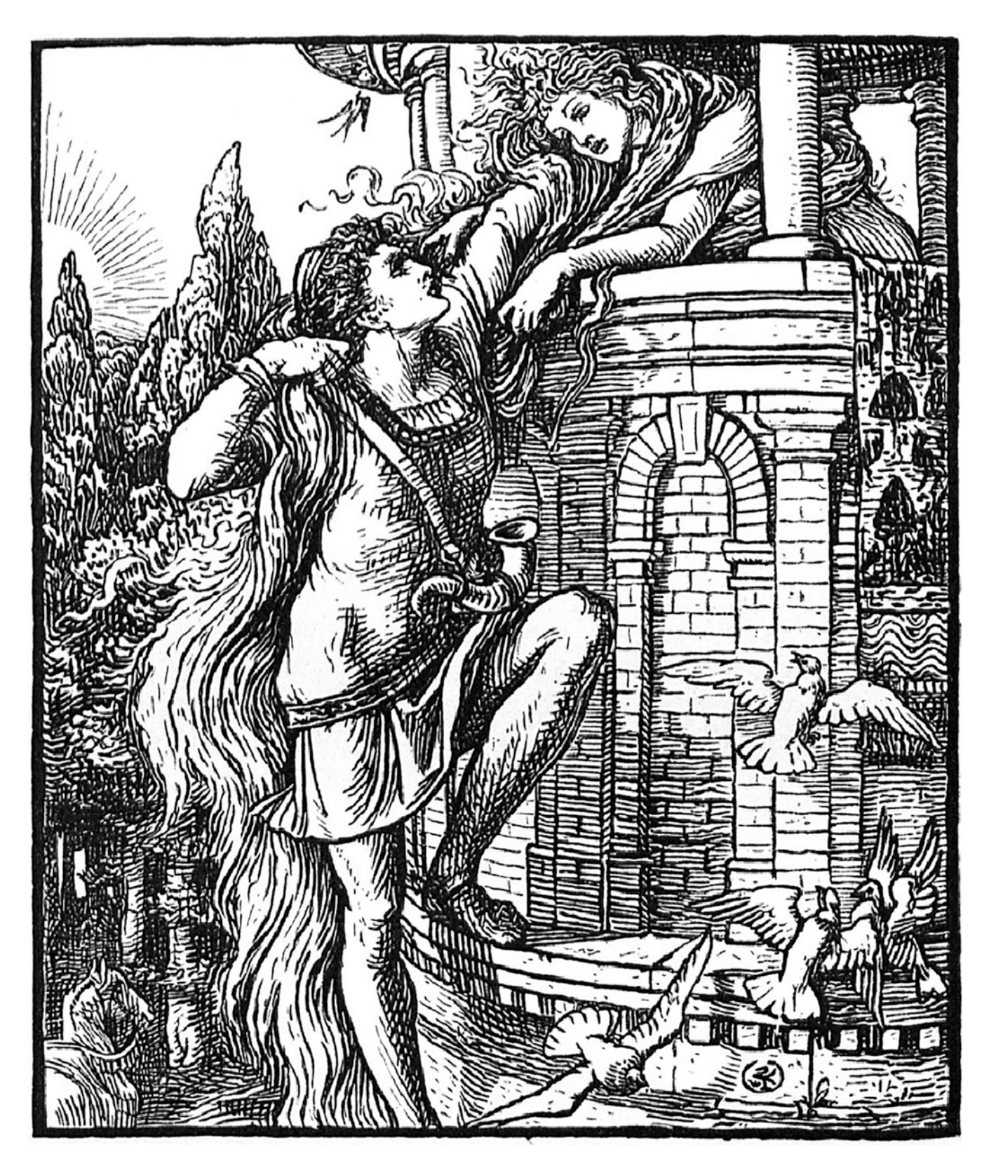
Illustration of Rapunzel. From Household Stories, from the 'Collection of the Bros: Grimm. Translated from the German by Lucy Crane' Illustrated by Walter Crane. London: Macmillan & Co. 1882.