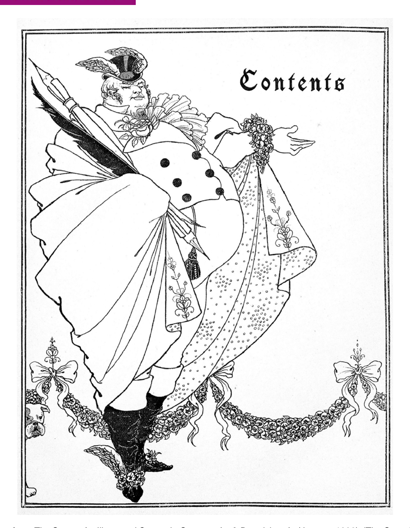
Illustration from The Savoy: An Illustrated Quarterly. Symons, A., & Beardsley, A. (January 1896). 'The Savoy' No. 1. London: L. Smithers.