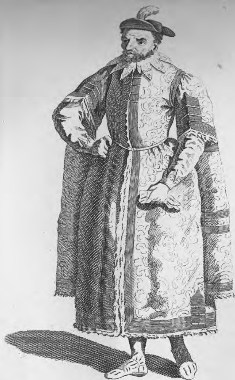
Habit of the LORD MAYOR of London in 1640. } Habit of a MERCHANT of London about 1640.