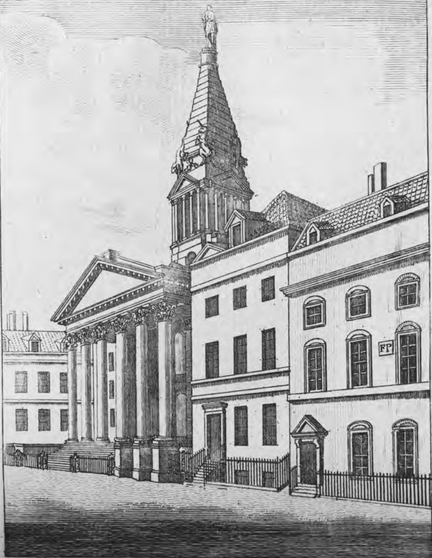
View of ST GEORGES CHURCH Bloomsbury