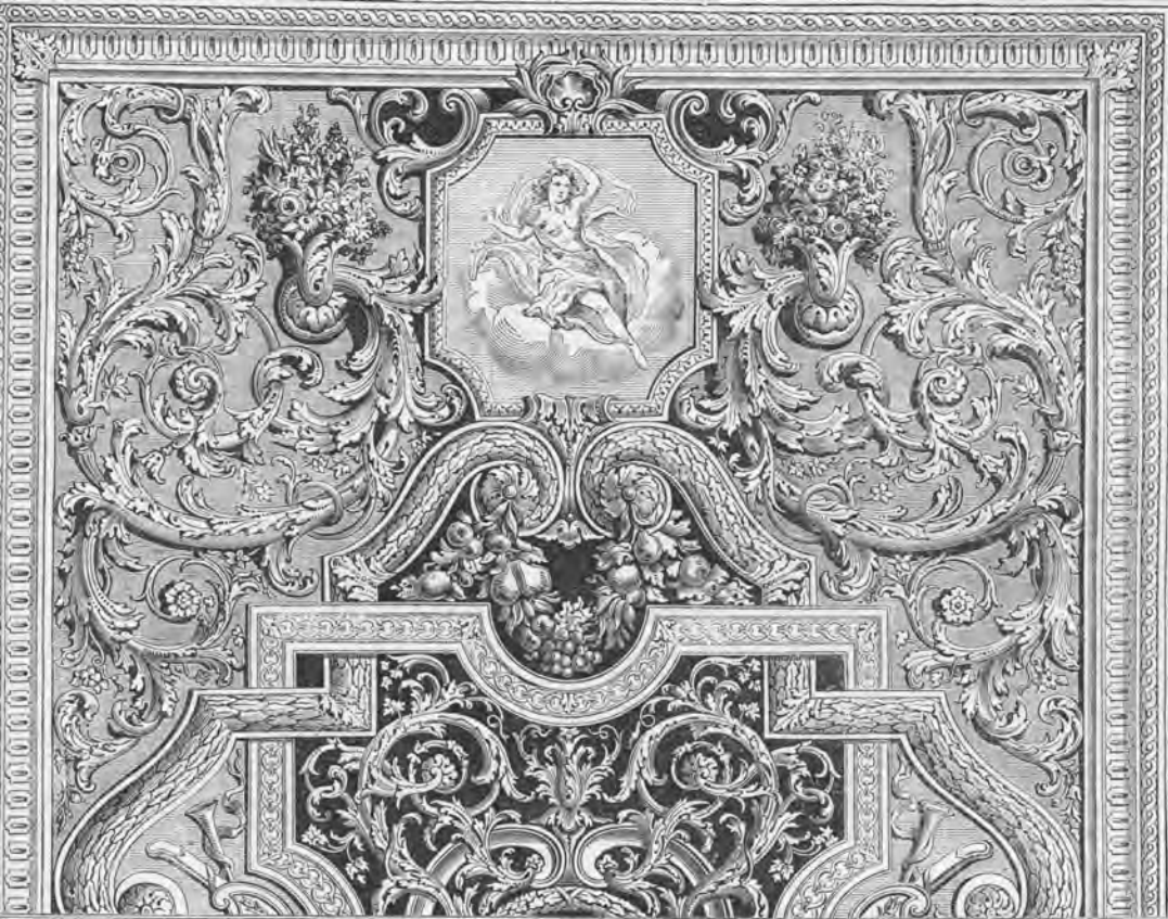
Tapis exécuté dans la manufacture des Gobelins sous Louis XIV. Page 462, col. 2.)