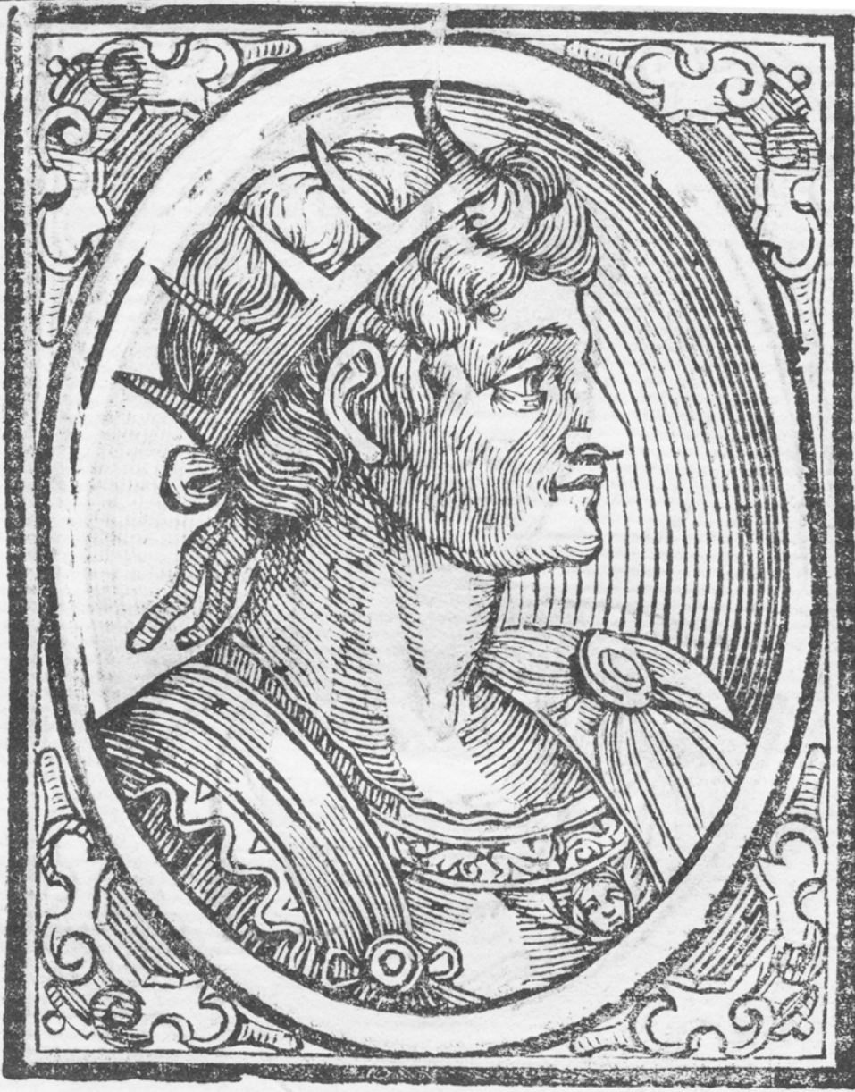
OTTAVIANO CESARE AVGVSTO.