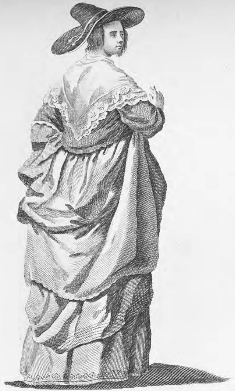
HABIT of the LADY MAYORESS of London in 1610. ? HABIT of a MERCHANT'S WIFE of London in 1610.