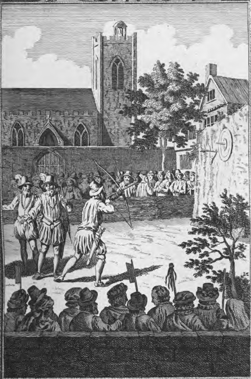
Representation of a grand SHOOTING MATCH by the London Archers in the Year 1583.