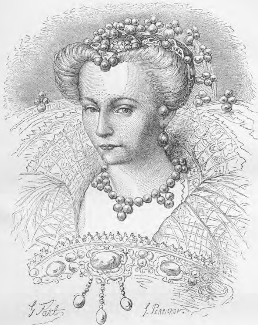
Louise de Lorraine, femme de Henri III.