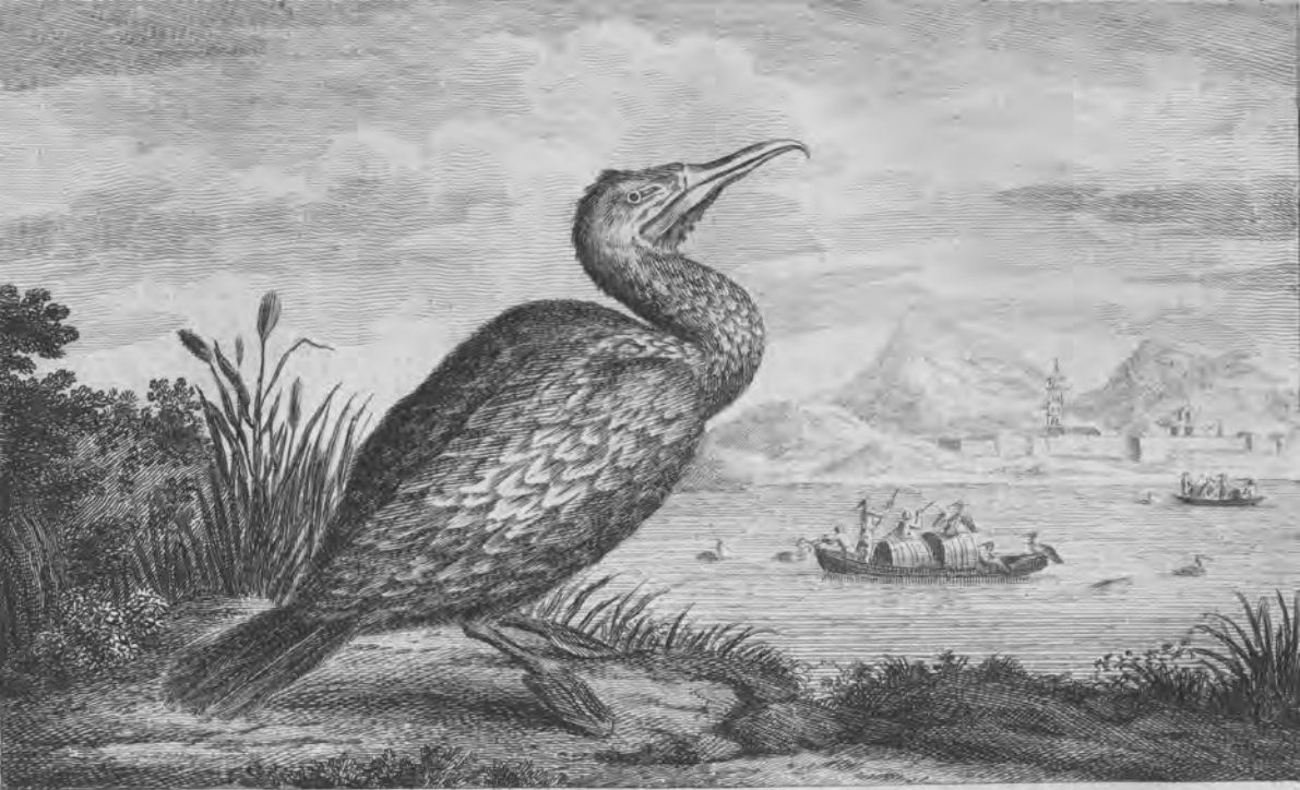
The Lowa or Fishing Bird of China.