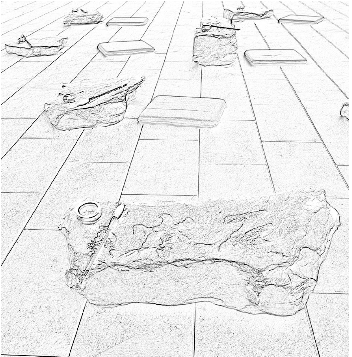
Installation You Can Write Anything with Water (2004) by Song Dong, exhibited at the Chinese Art Centre in 2004, from a photograph by Tim McConville.

CFCCA Archive & Library, GB3451/OC/D/1708/2/9