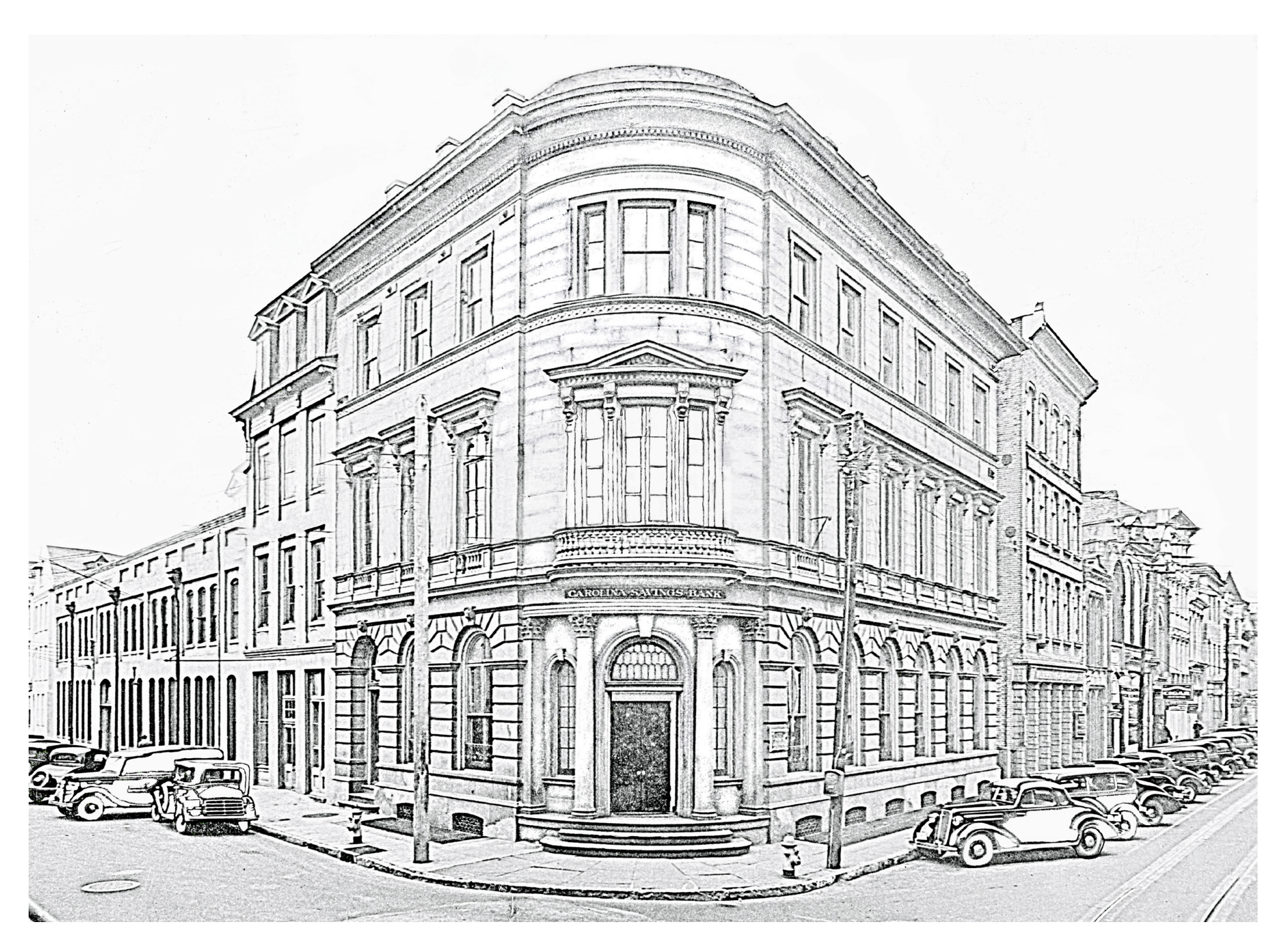
Photograph of Charleston's One Broad Street, circa 1930s