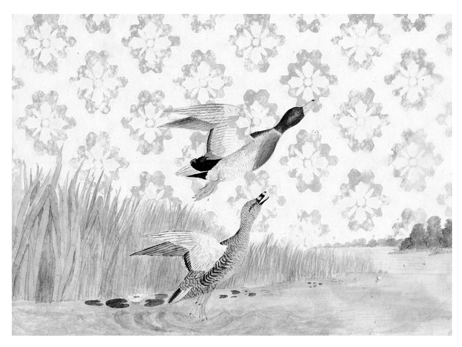
Wildlife artwork by Langdon Cheves III, circa 1860s