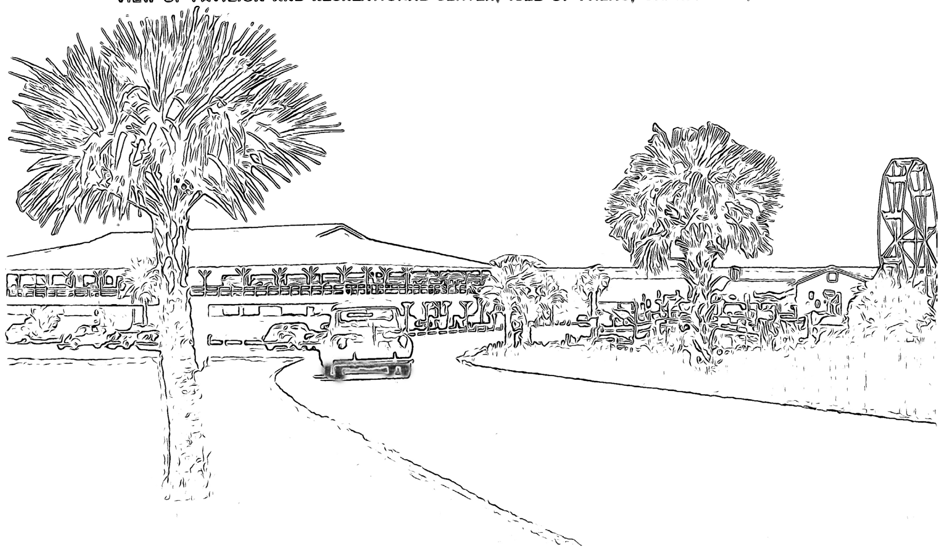
view of pavilion and recreational center, isle of palms, charleston, s. c.— 83

Isle of Palms postcard, circa early twentieth century