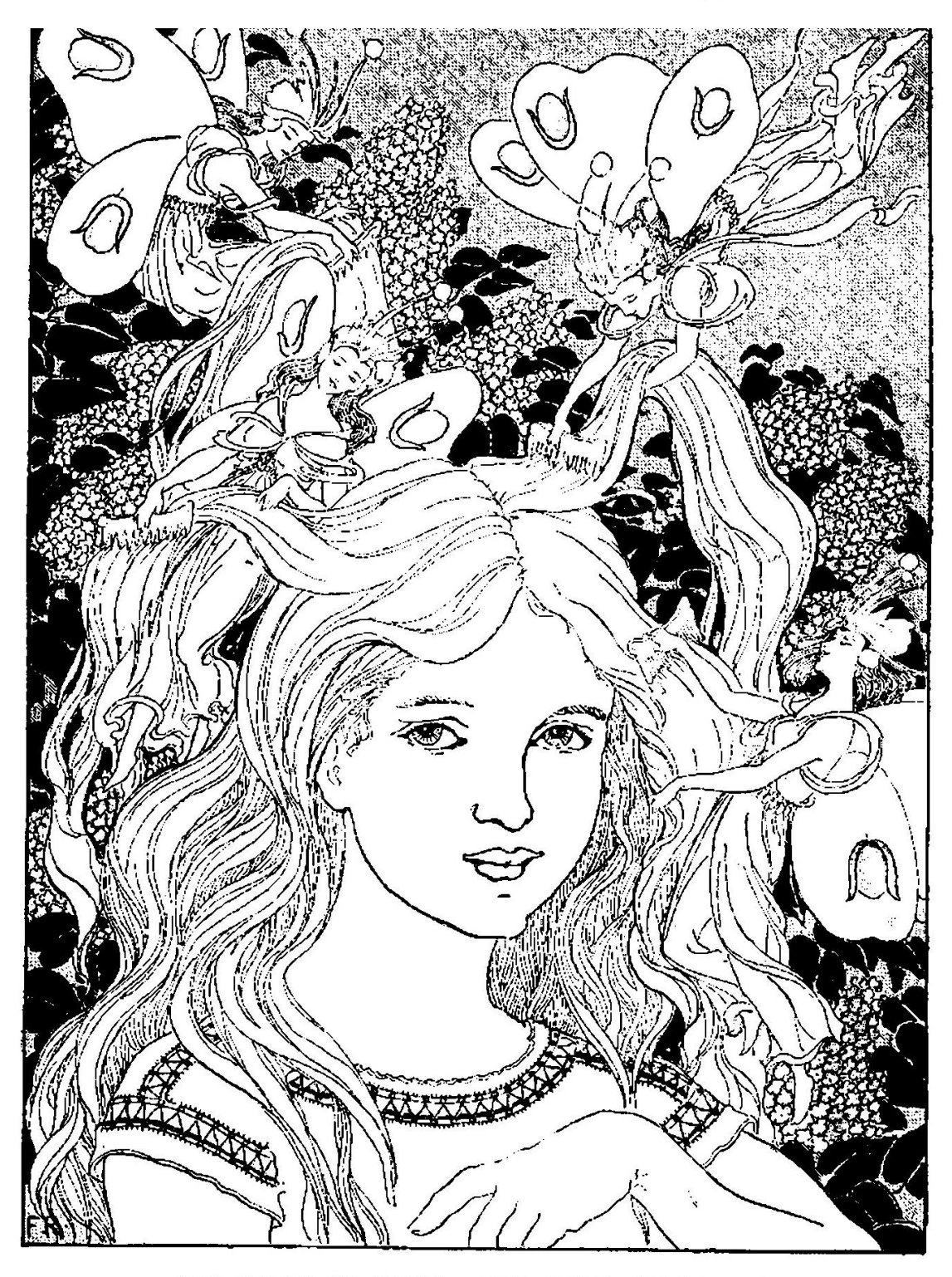
"SO WASH IT WELL, AND COMB IT WELL,"