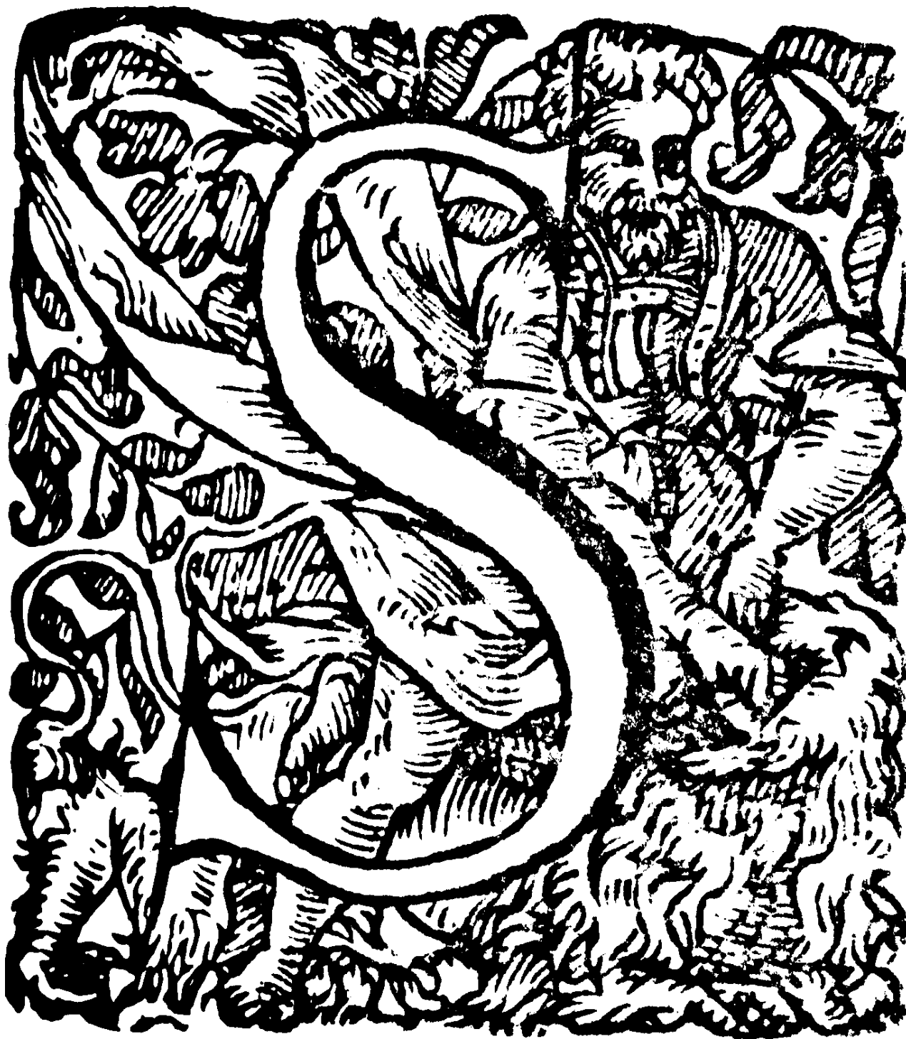
Hevelius, Johannes, 1611-1687. Johannis Hevelii Epistolæ II. Gedani : Sumtibus autoris, typis Andreae Julii Molleri, 1654.