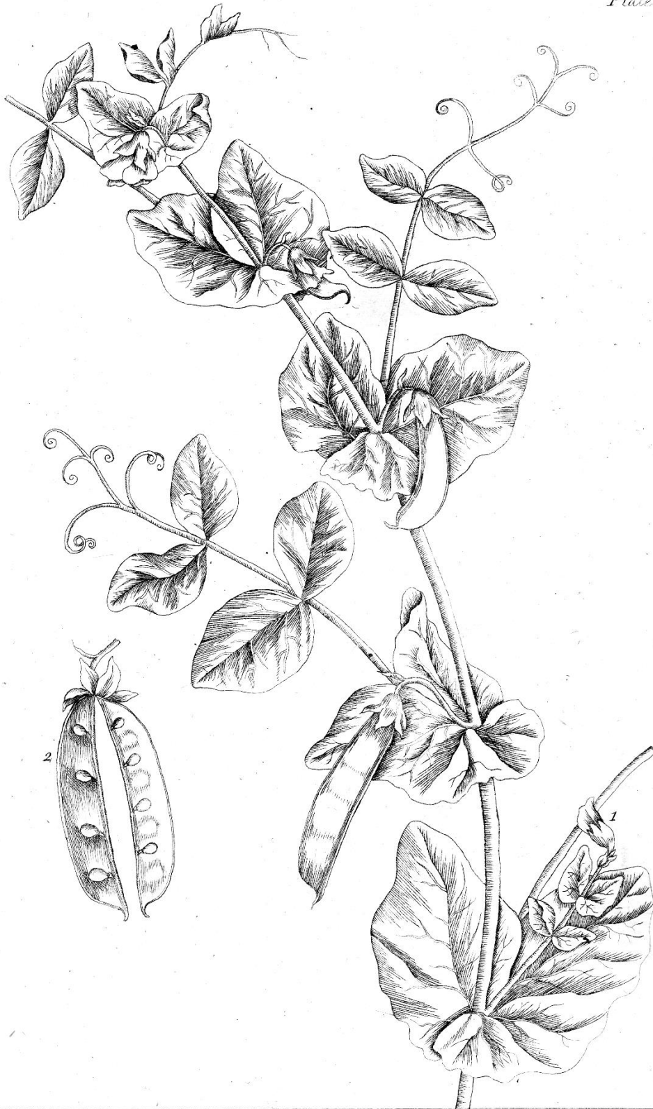
Peas } 1. Blossome } Pisum Eliz. Blackwell delin. sculp et Pinx. } 2. Pod } Philadelphia decandra