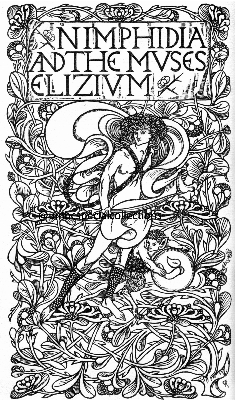
Woodcut frontispiece by Charles Ricketts from the text: Drayton, Michael, and John Gray. Nymphidia, and The Muses Elizivm . London: Hacon & Ricketts, 1896.