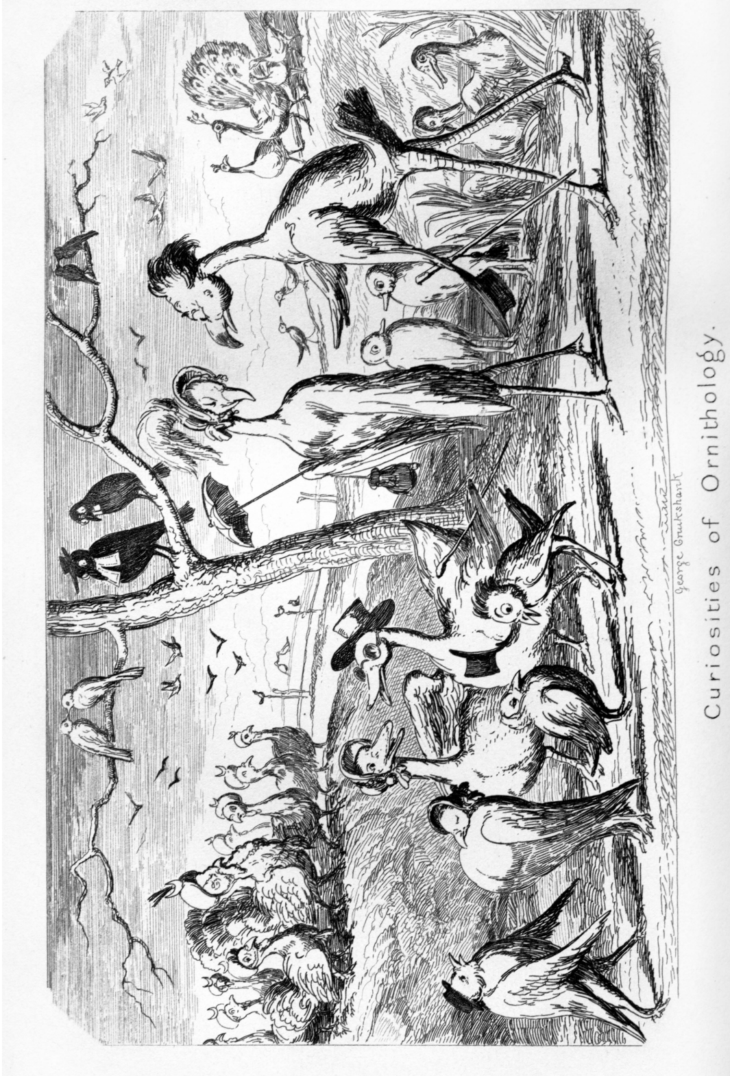
Curiosities of Ornithology by George Cruikshank, pp. 222 from text: Costello, Dudley, and Wellcome Historical Medical Library. Holidays with Hobgoblins: And Talk of Strange Things. London: John Camden Hotten, 1861.