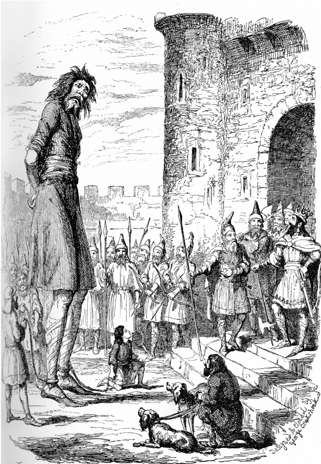
Jack brings the Giant prisoner to King Alfred.

Jack brings the Giant Prisoner to King Alfred by Gerorge Cruikshank, pp. 99 from text: Cruikshank, George. The Cruikshank Fairy-book: Four Famous Stories . New York & London: G.P. Putnam's Sons, 1897.