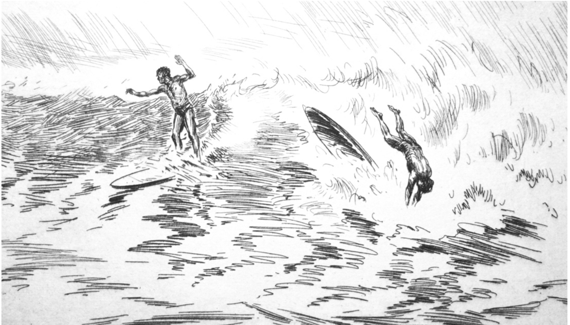
“Surfing – The Breaking Wave” (cropped) by Huc Mazelet Luquiens. Etching, 1920. Art in Public Places Collection of the Hawaii State Foundation on Culture and the Arts.