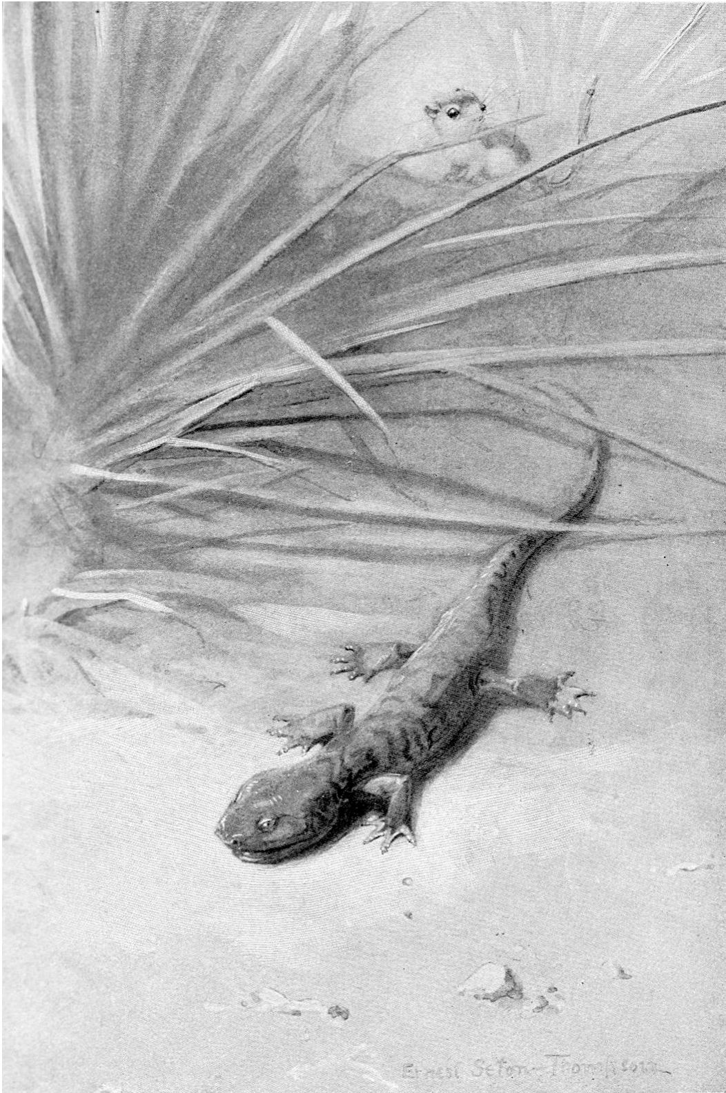
Gila monster, Johnson's Natural History