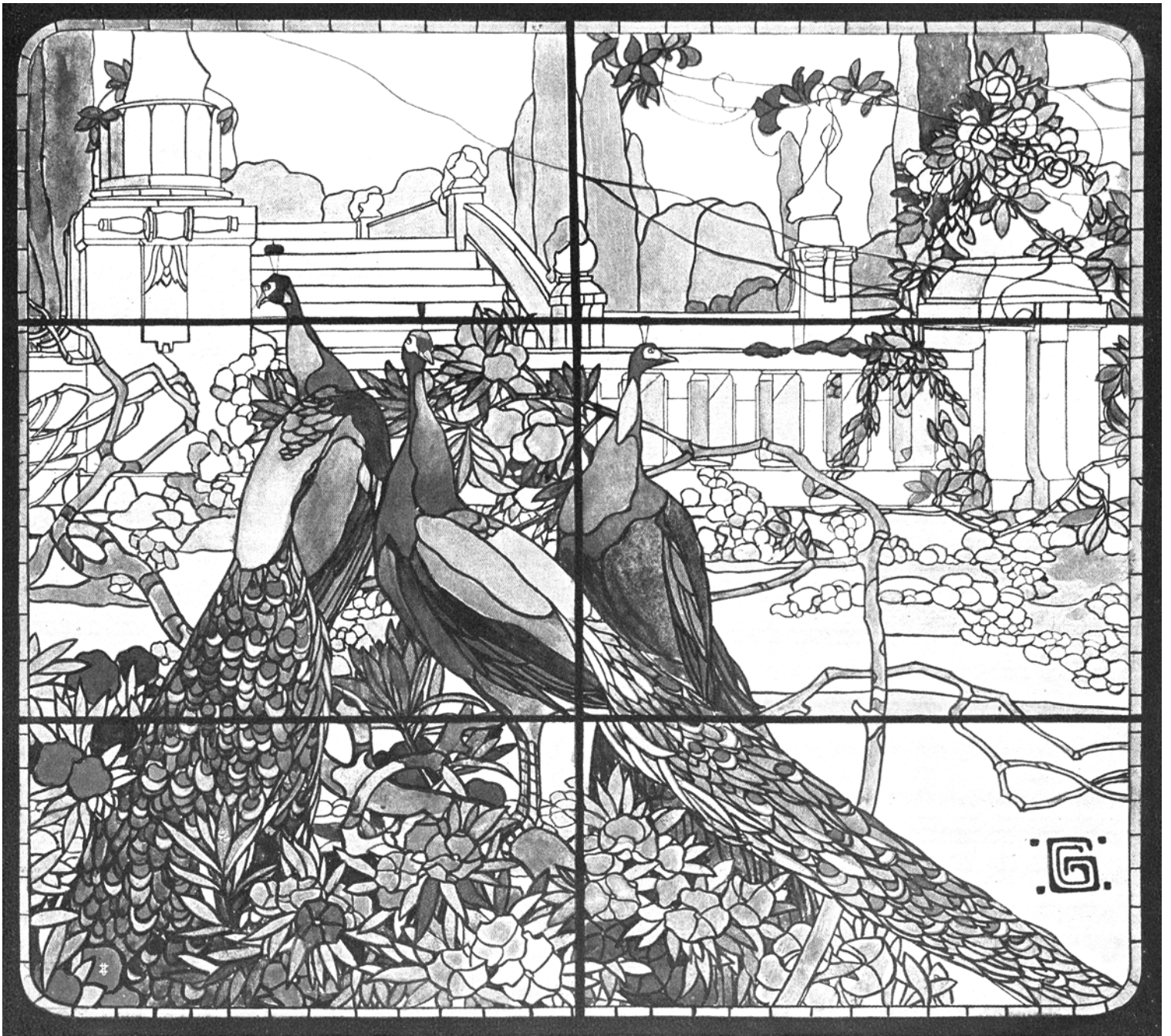
Peacock, Estratto dal "Per l'arte" rivista di arte decorativa , NK5305 .E88 1909 OVERSIZE, John J. Burns Library, Boston College

For more coloring pages, visit ColorOurCollections.org