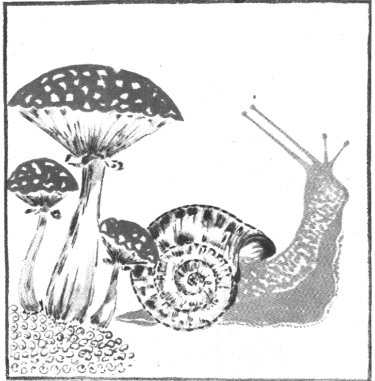
Snail, Estratto dal "Per l'arte" rivista di arte decorativa, NK5305 .E88 1909 OVERSIZE, John J. Burns Library, Boston College

For more coloring pages, visit ColorOurCollections.org