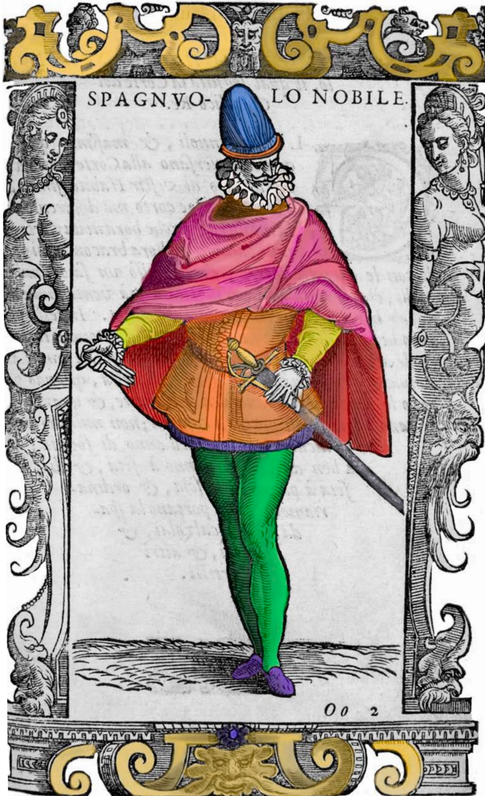
Engraving from De gli habiti antichi, et moderni di diuerse parti del mondo libri dve . Cesare Vecellio. Printed by Damian Zenaro. Venice. 1590. Case W 93 .94.