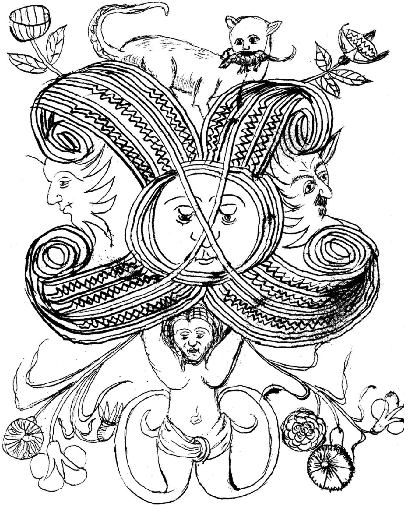
Hand-drawn illustration from Alfabeto Figurato . Italy. 17th Century. Vault Case MS Wing ZW 141 .61.

For more coloring pages, visit ColorOurCollections.org