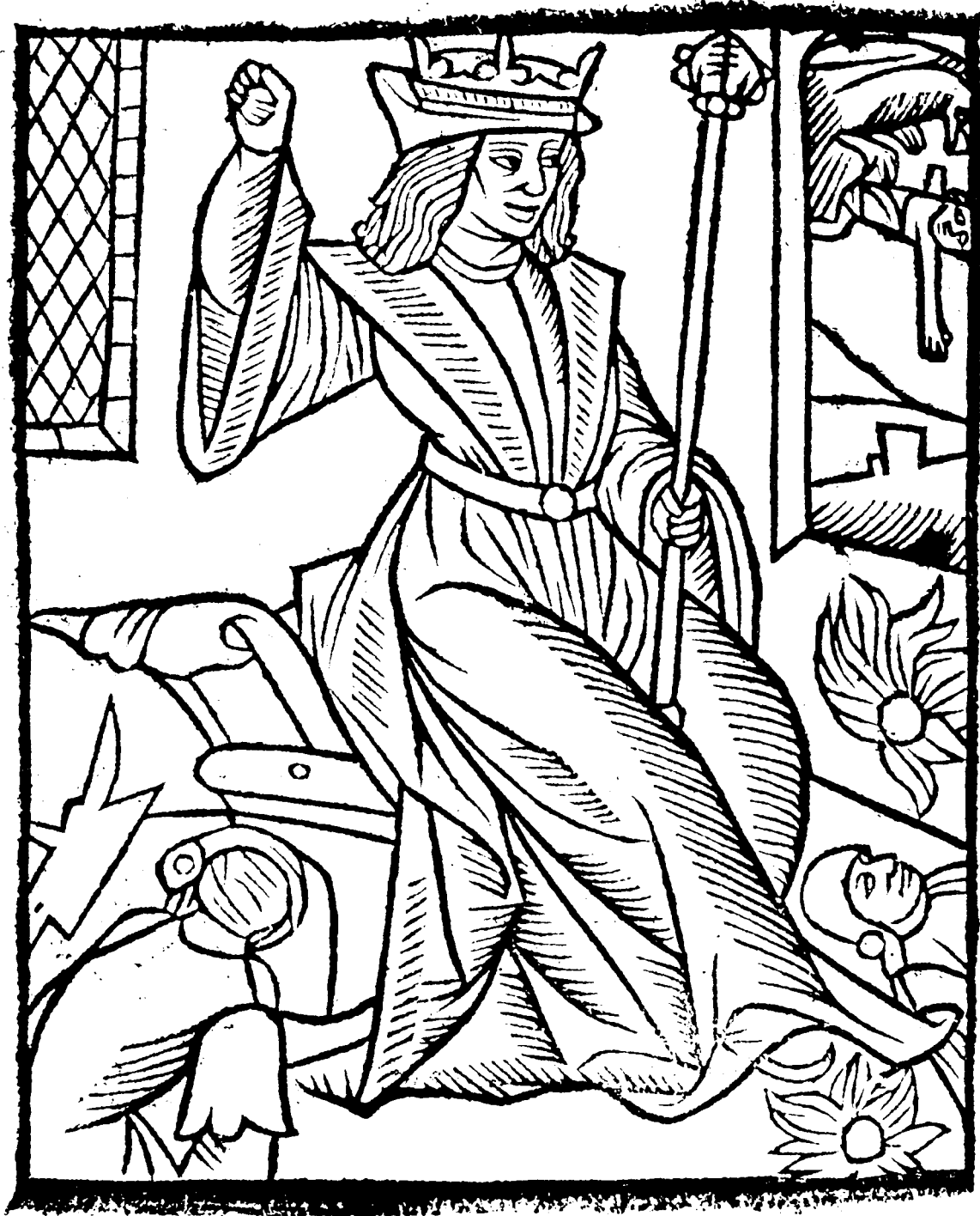
Woodcut from Le blason des couleurs en armes, liurees & devises . Sicille (Jacques d' Enghien). 1540. Case F 07.18.