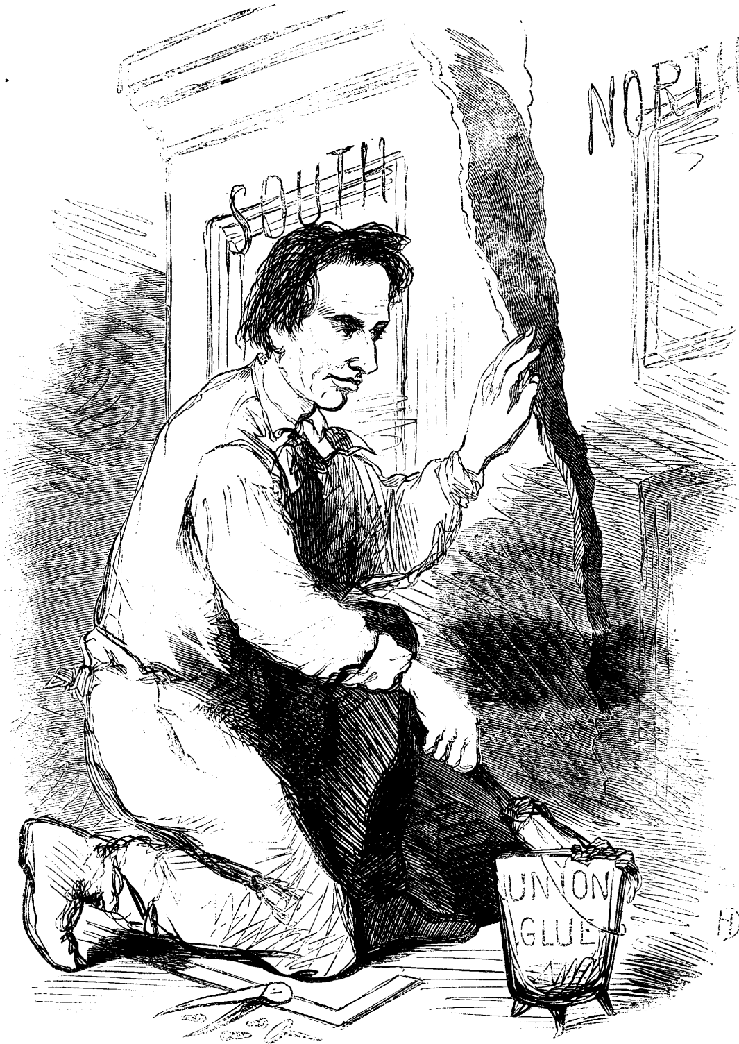
A JOB FOR THE NEW CABINET MAKER.