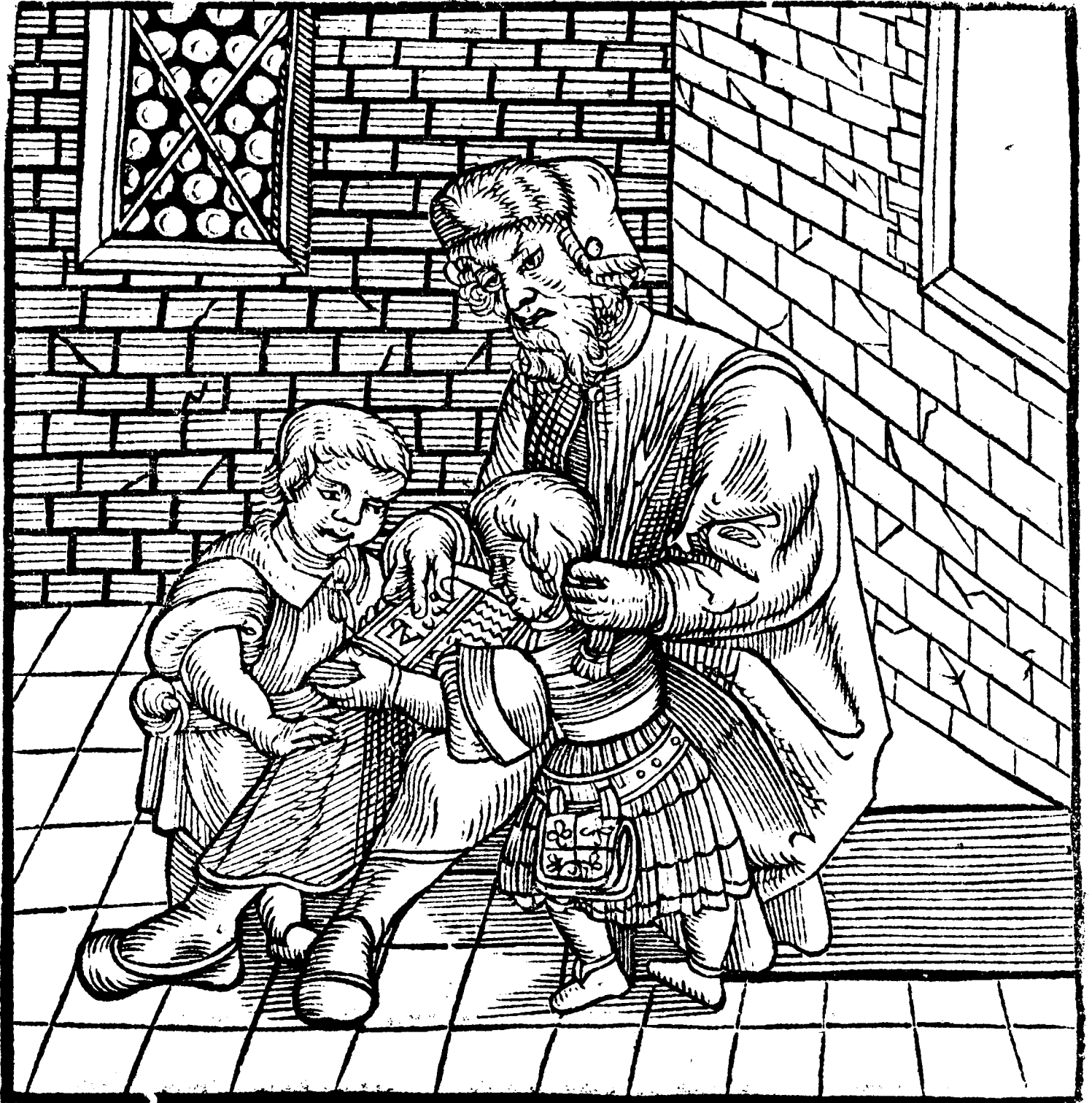
Woodcut of teacher reading with students. From Iudicium ... Philippi Melanthonis, De more depositionis, quo fine sit institutus . Philipp Melancthon. 16th Century. Case Wing Broadside ZC 93.565.

For more coloring pages, visit ColorOurCollections.org