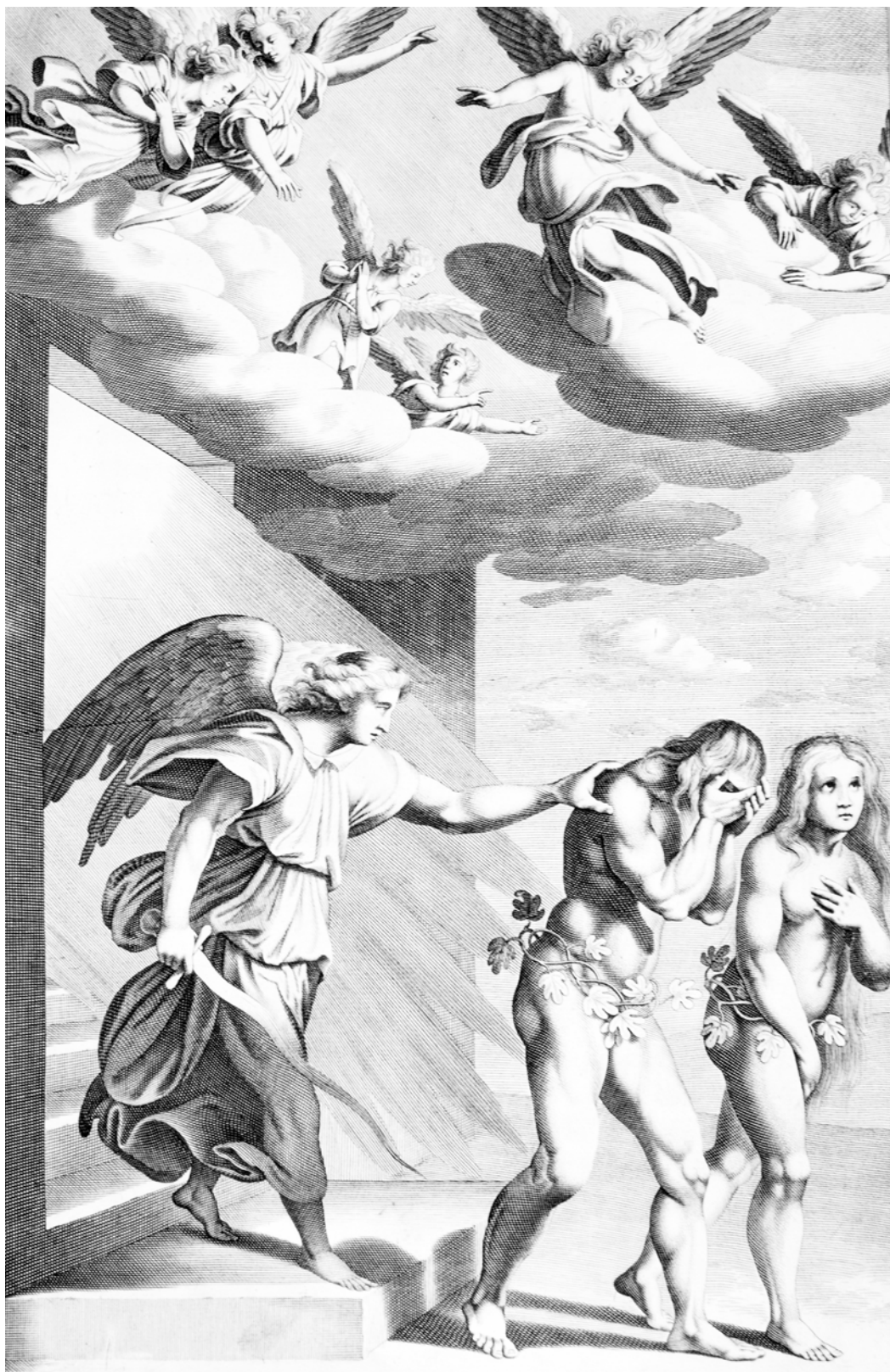
Engraving of Adam and Eve leaving the Garden of Eden. From Paradise Lost: A Poem in Twelve Books . John Milton. London. 1691. Case folio Y 185 .M657.