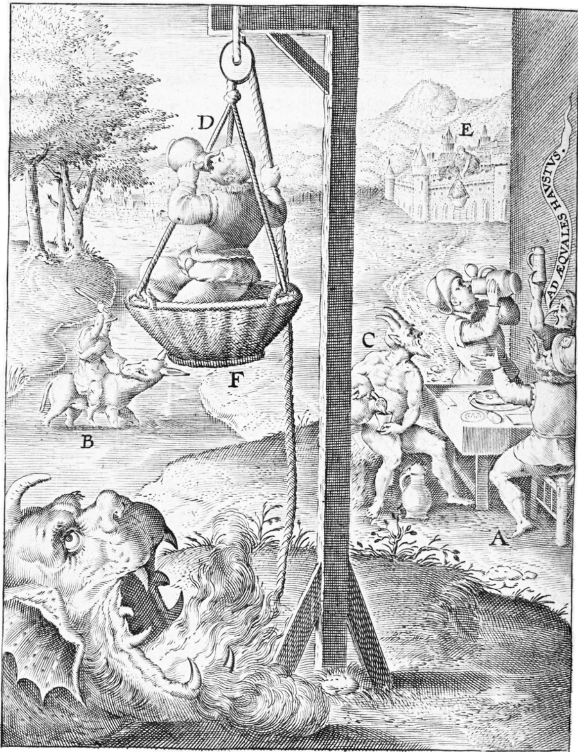
"Deploranda temulentorum vesania." Engraving from Christelicken waersegher: de principale stucken van t'christen geloof en Leuen int cort begrijpende . Jan David. Antwerp. 1603. Wing ZP 6465 .P675.