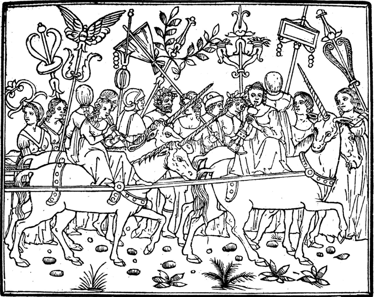
Woodcut from Hypnerotomachia Poliphili . Francesco Colonna. Printed by Aldus Manutius. Venice. 1499. Folio Inc. 5574.