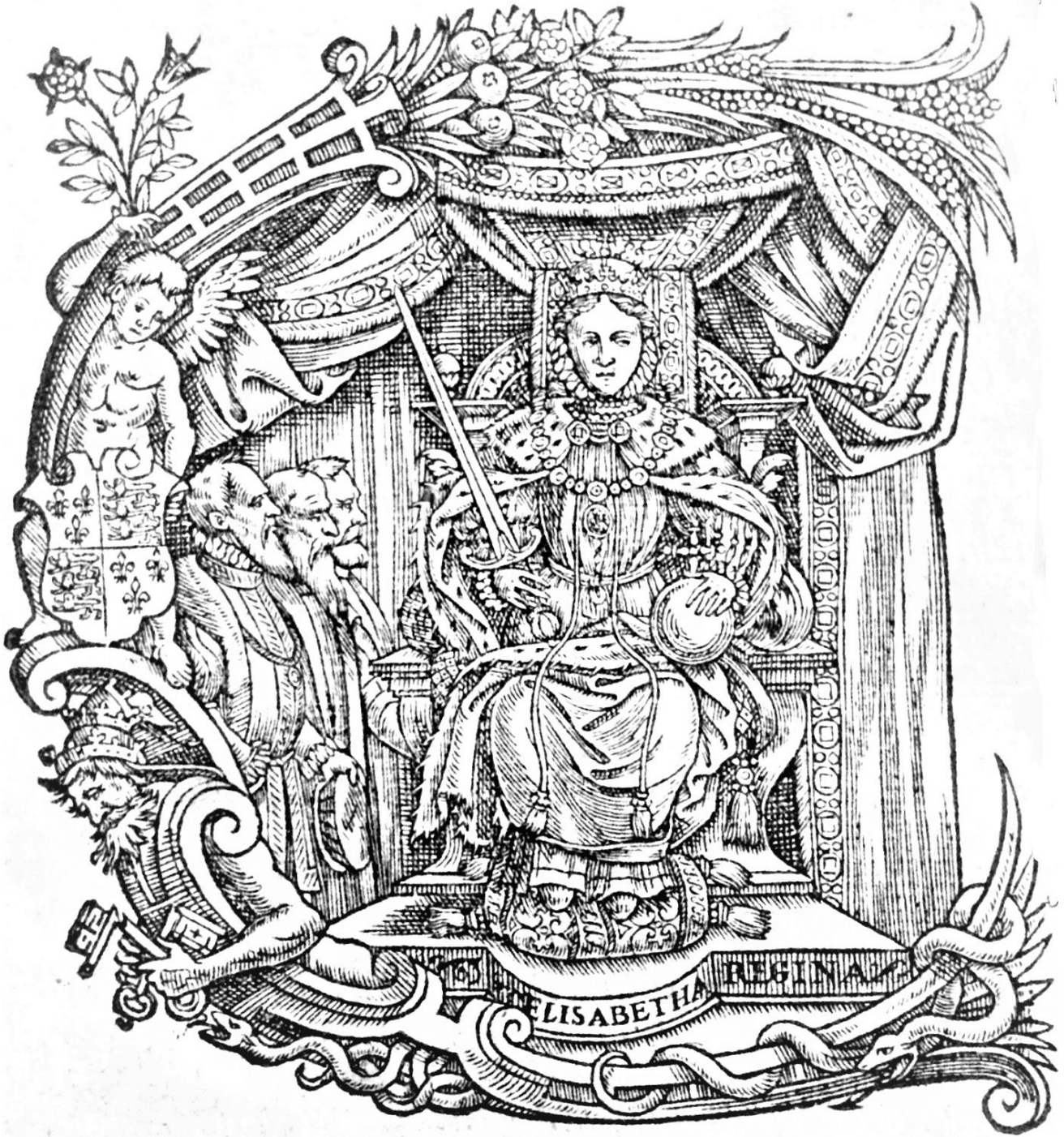
John Fox, Actes and monuments (London: By Iohn Day, Dwellyng Ouer Aldersgate, 1563)