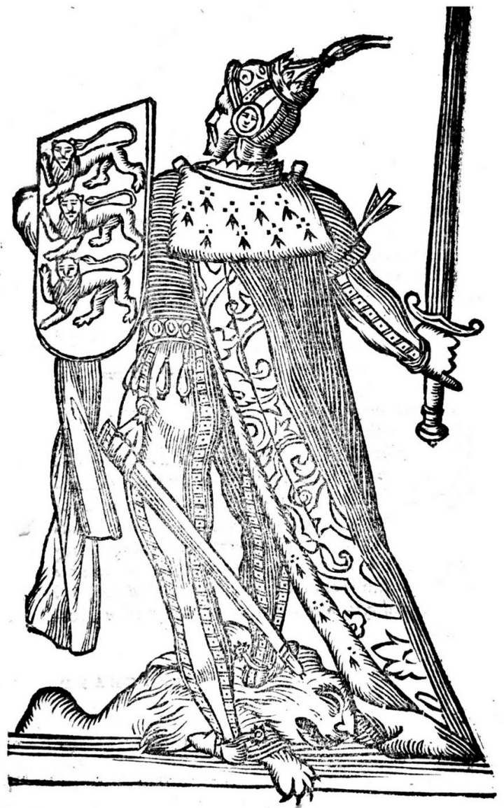
Woodcuts of Richard I and Richard III, from John Taylor, All the wvorkes of Iohn Taylor the water-poet (London: Printed by J. B. for Iames Boler, 1630).