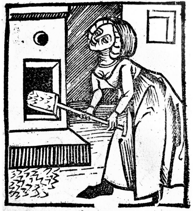
Urs Graf, Hortus Sanitatis. Latin. 1517. (Strasbourg: Reinhard Beck], 1517)