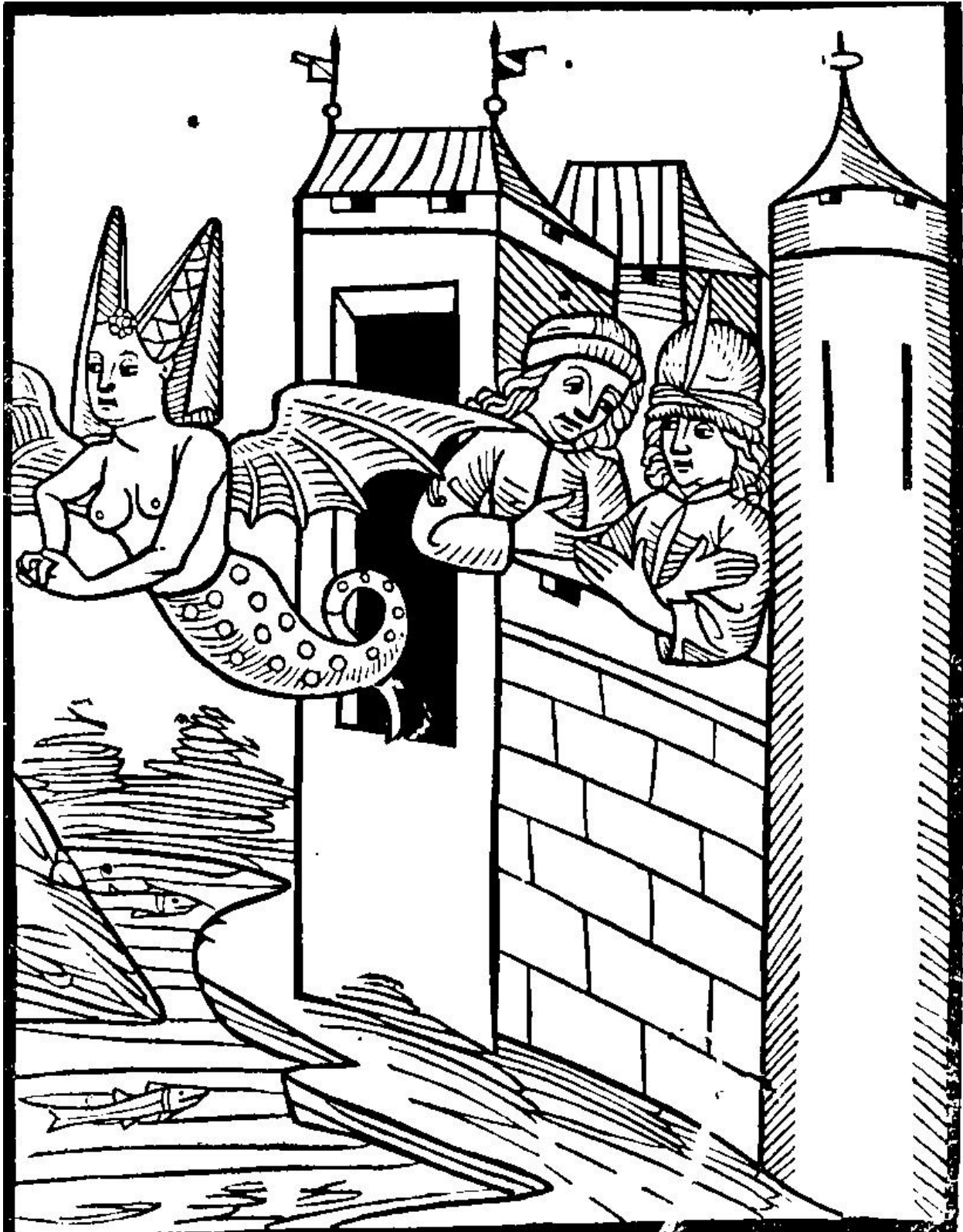
'How Melusine flew out of the window in the form of a serpent.' Jean d'Arras, Histoire de la belle Mélusine (Lyon, c.1487).