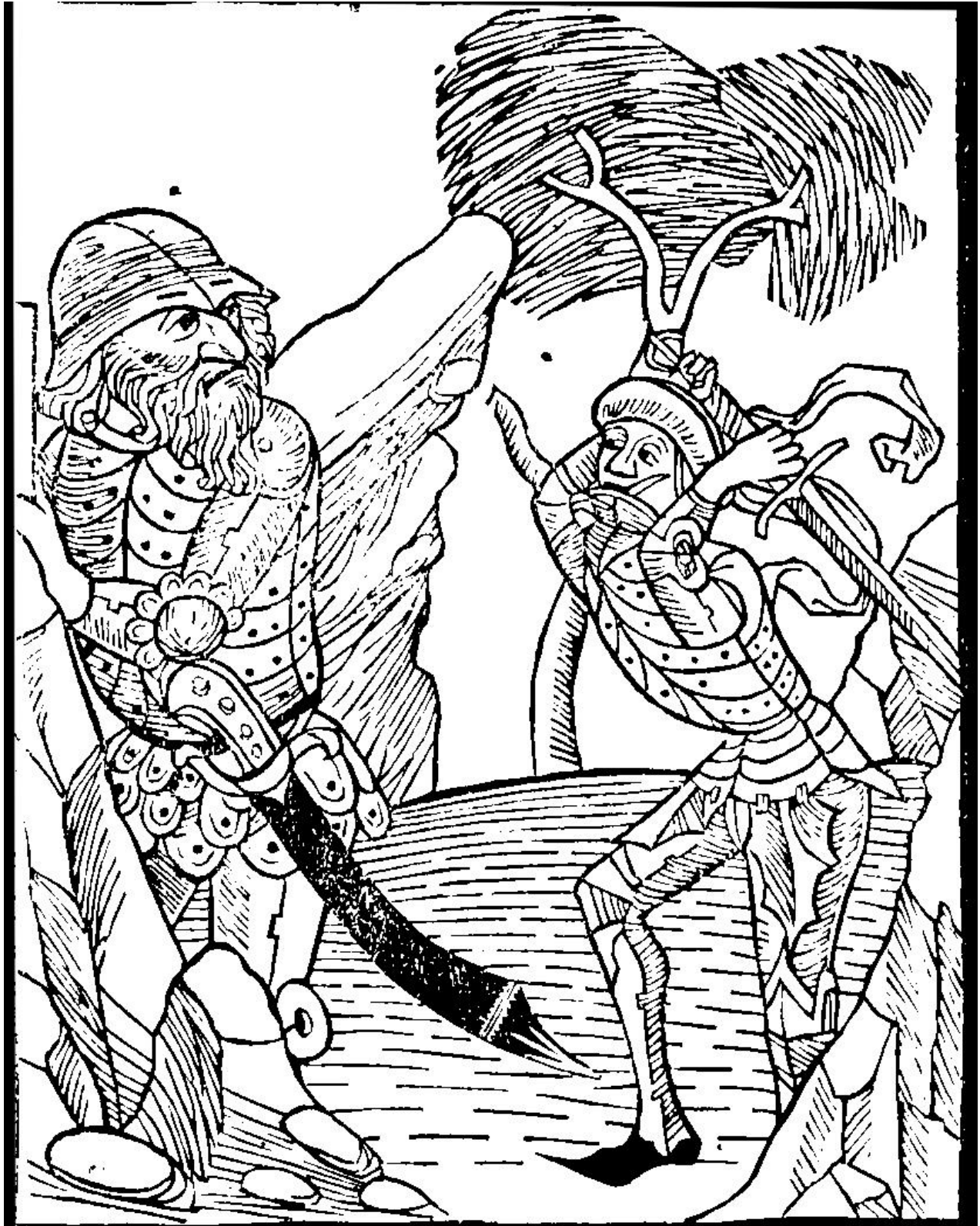
'How the giant fled and Geoffrey followed him.' Jean d'Arras, Histoire de la belle Mélusine (Lyon, c.1487).