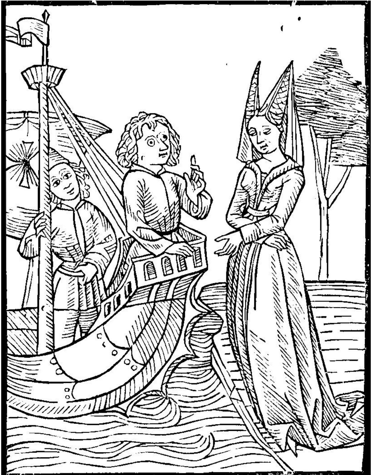
'How Uryan and Guyon parted from their mother and boarded their ship.' Jean d'Arras, Histoire de la belle Mélusine (Lyon, c.1487).