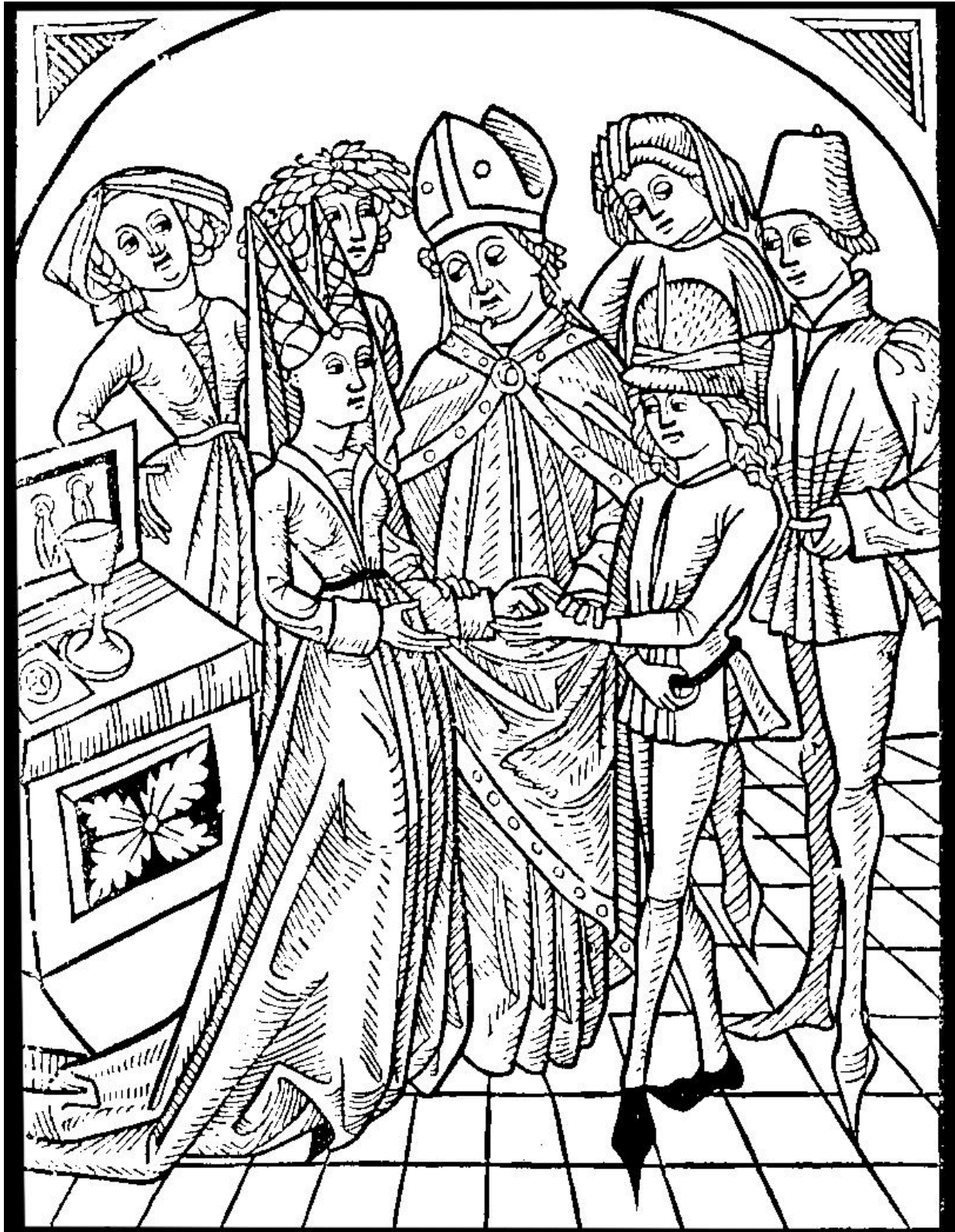
'How Raymondin and Melusine were married.' Jean d'Arras, Histoire de la belle Mélusine (Lyon, c.1487).