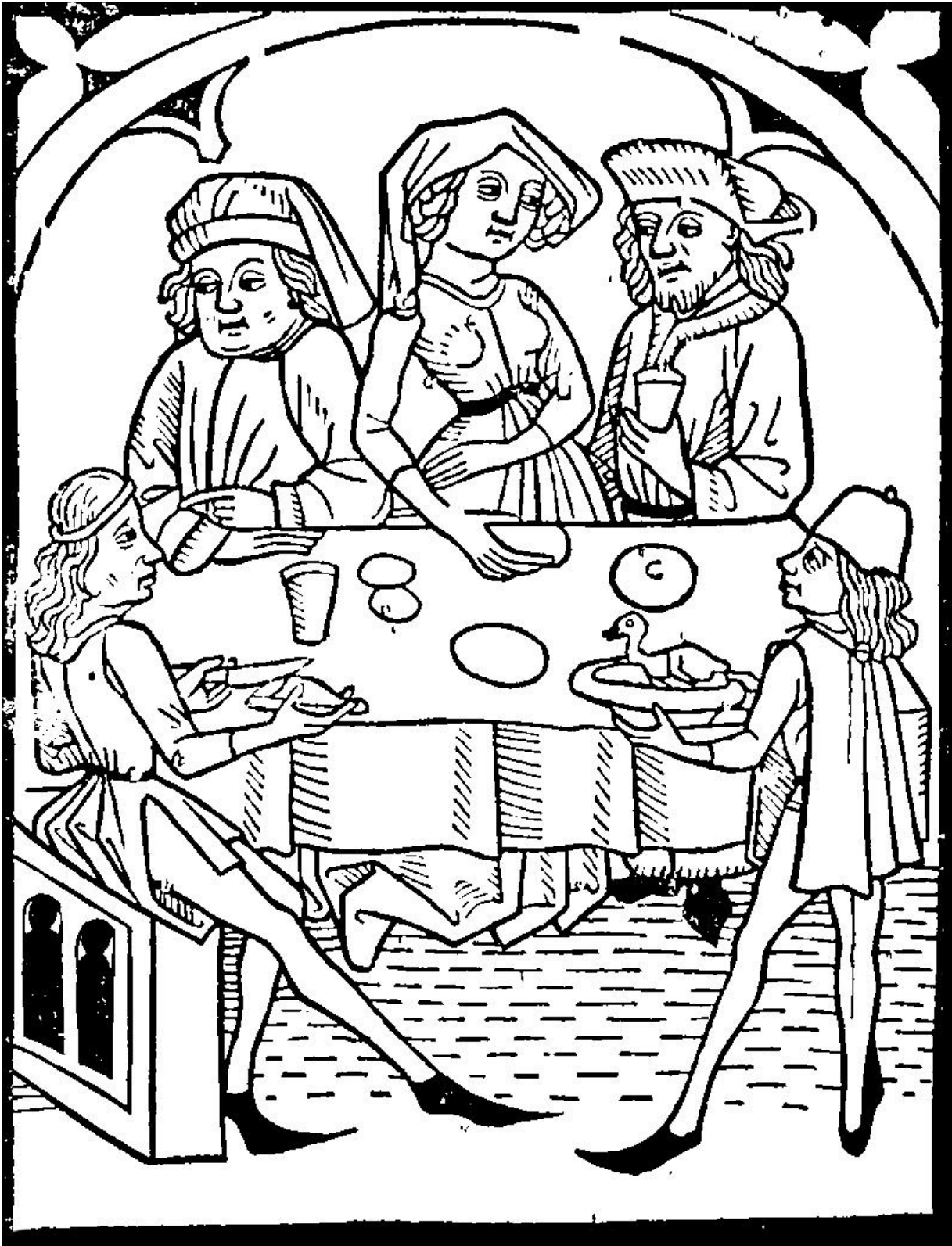
'How the Earl of Poitiers invited the Earl of Forez to the feast he held for his son.' Jean d'Arras, Histoire de la belle Mélusine (Lyon, c.1487).