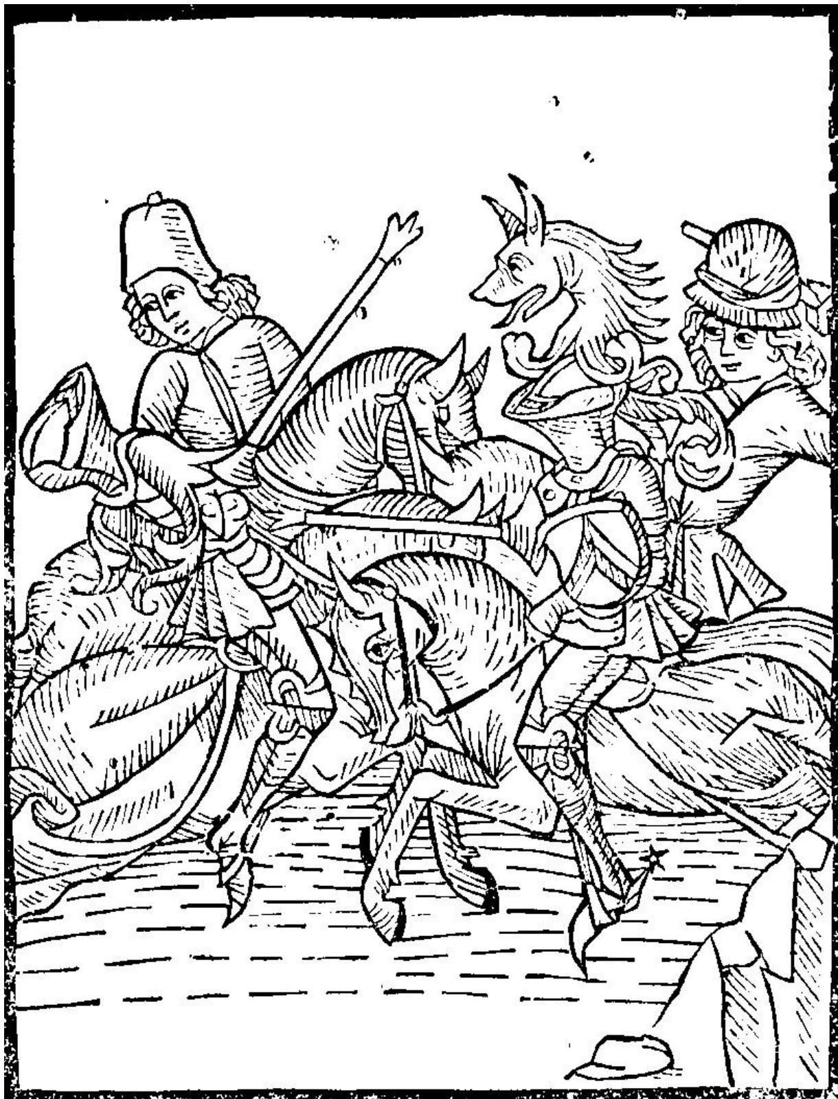
'How the knights and squires jousted after dinner.' Jean d'Arras, Histoire de la belle Mélusine (Lyon, c.1487).