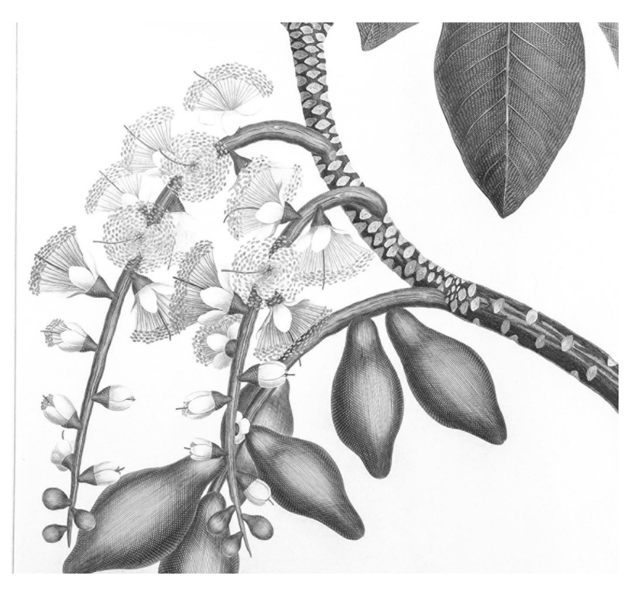
Barringtonia calyptrata fruit and flowers