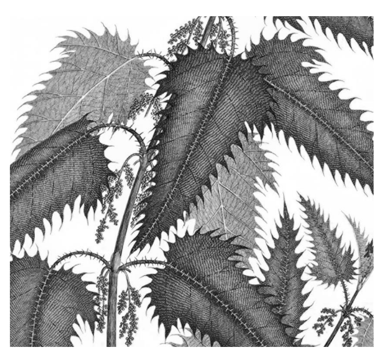
Urtica ferox spiky leaves