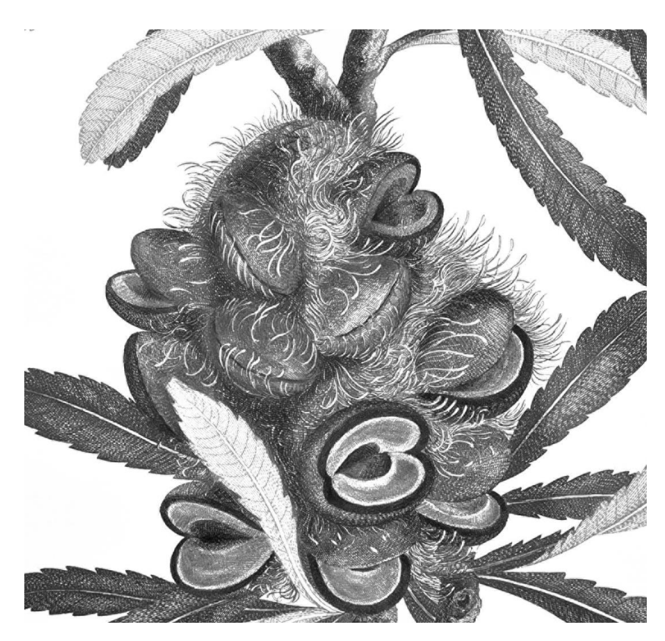
Banksia serrata fruiting cone