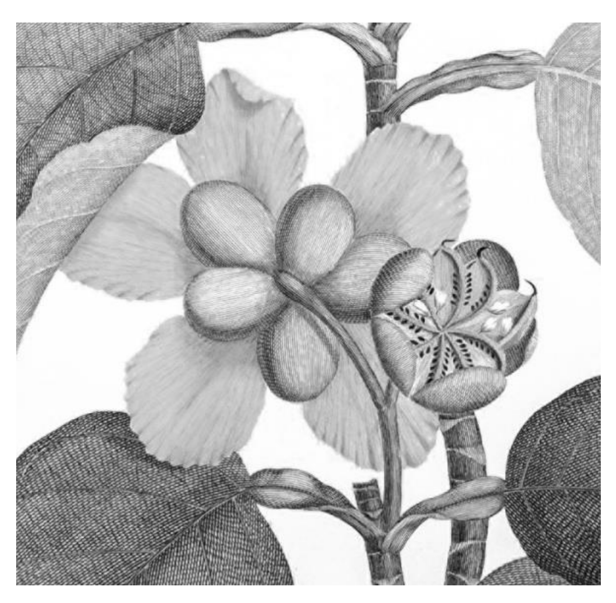
Dillenia alata flowers