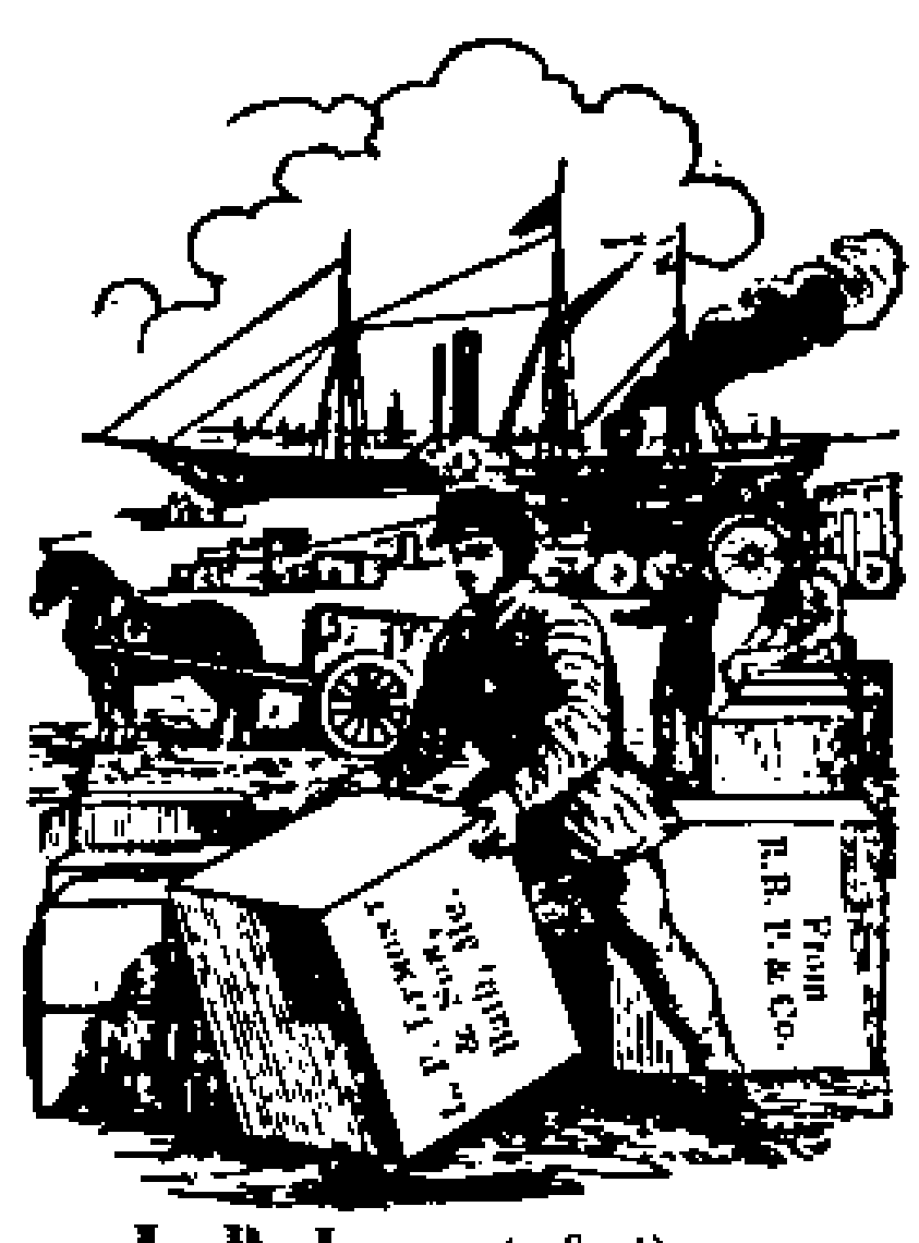
L. P. Lemont & Son

"L. P. Lemont & Son" Daily Northern Tribune, Bath, ME, Pg. 2 April 27, 1847.