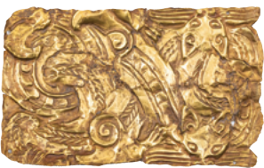
Unknown Chinese Artist, Relief plaque with stylized tigers and phoenixes, ca. 453-221 BCE, gold. Gift of an anonymous donor (2022.20.01)