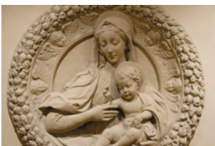
Benedetto da Maiano, Madonna and Child , plaster cast after marble original of 1493-4. Gift of the Metropolitan Museum of Art (2019.04.21)