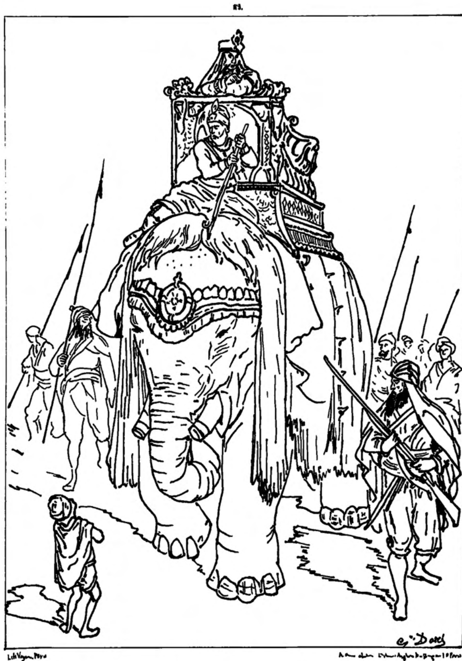
MARCHE D'UN RAJAH.