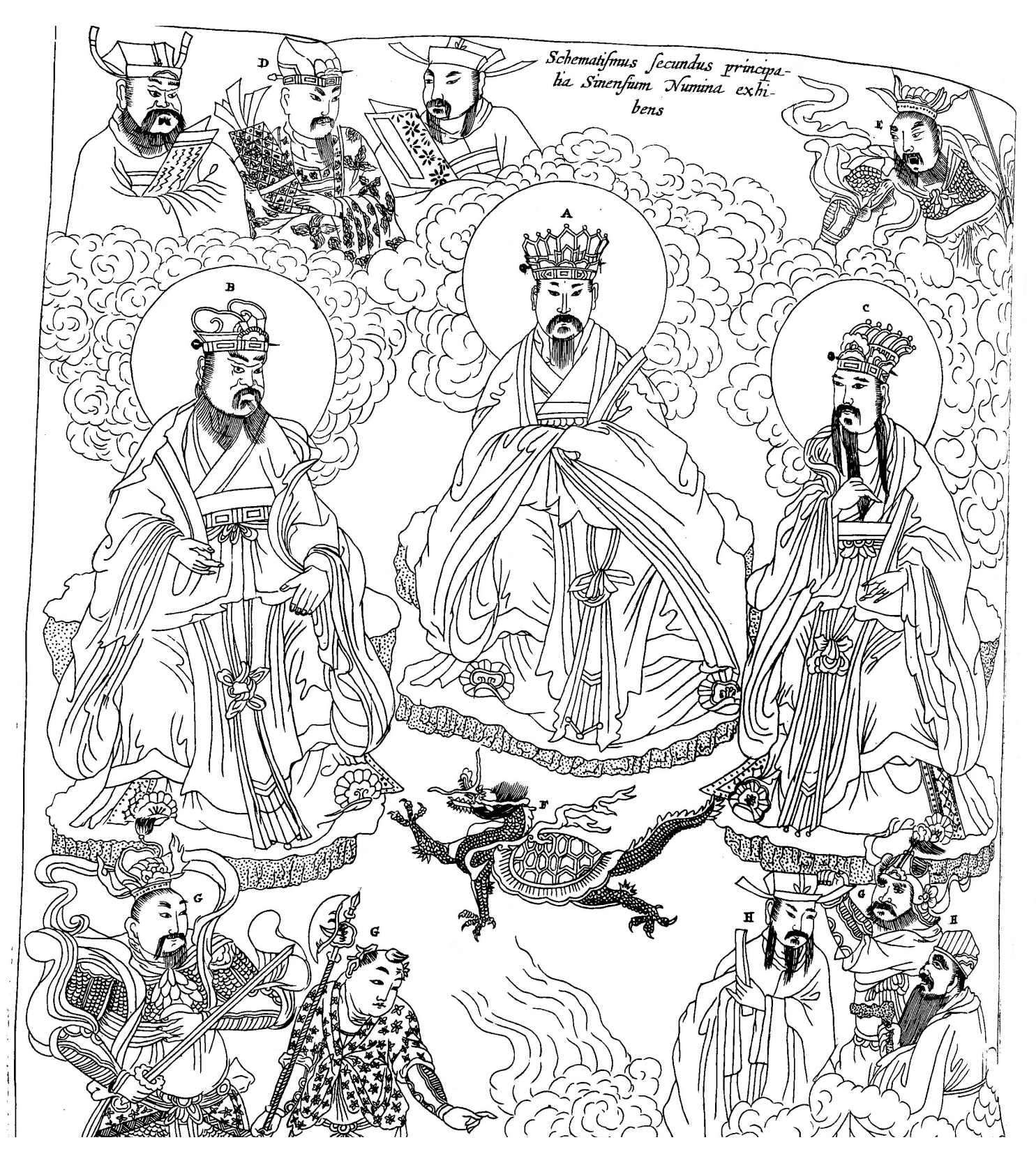
Engraving from Athanasius Kircker, China monumentis qua sacris quà profanes (Amsterdam, 1667). Eton College Library, BI.2.05