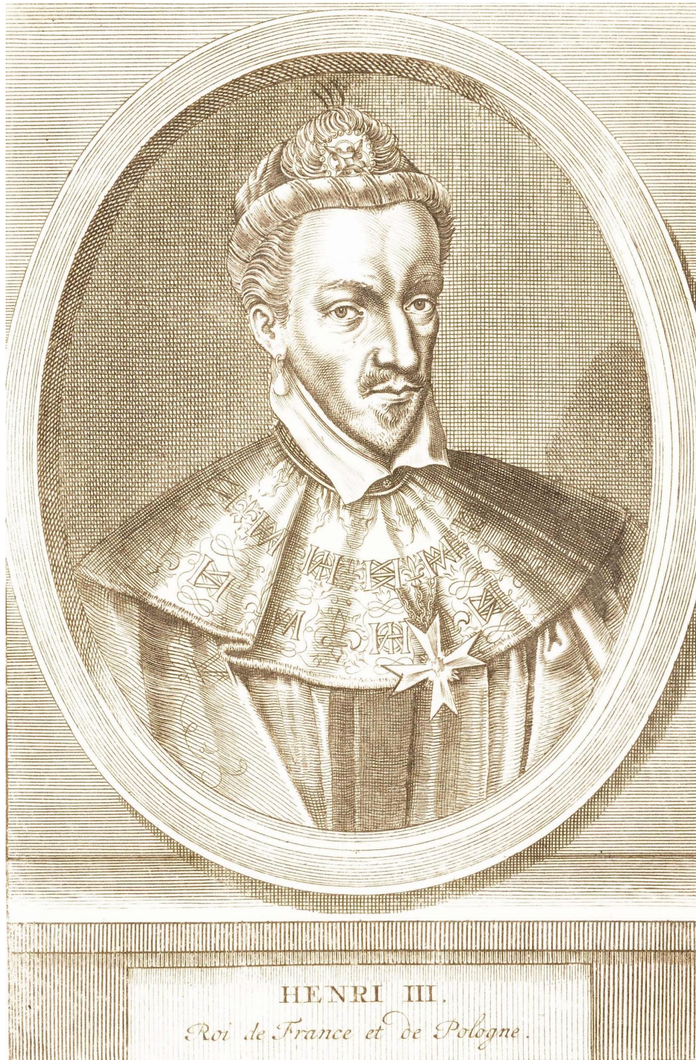
Portrait of Henri III Valois, King of Poland and Grand Duke of Lithuania, Pieter van der Aa (1659-1733), Leiden, Netherlands, 1720.