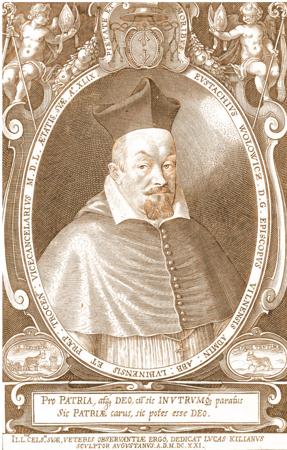
Portrait of Eustachijus Valavičius, Bishop of Vilnius, Lucas Kilian (1579–1637), Augsburg, 1621.