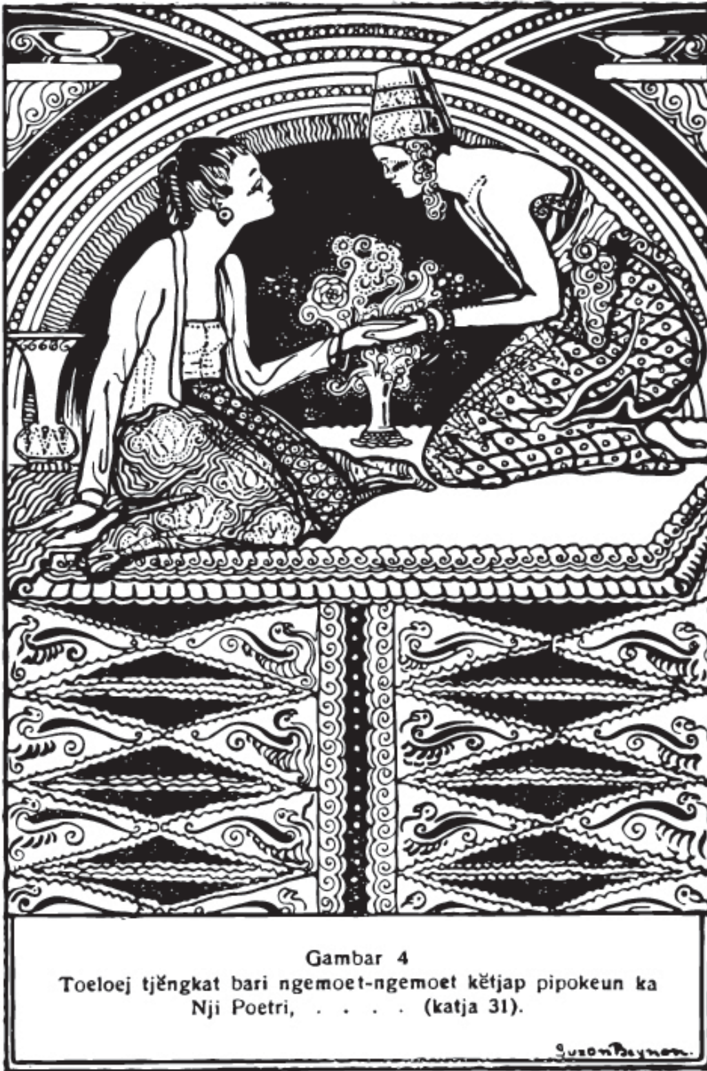
Gambar 4 Toeloej tjëngkat bari ngemoet-ngemoet këtjap pipokeun ka Nji Poetri, . . . . (katja 31).