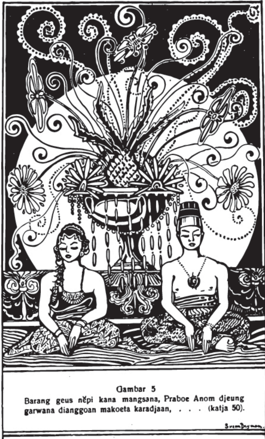
Gambar 5 Barang geus nĕpi kana mangsana, Praboe Anom djeung garwana dianggoan makoeta karadjaan, . . . (katja 50).