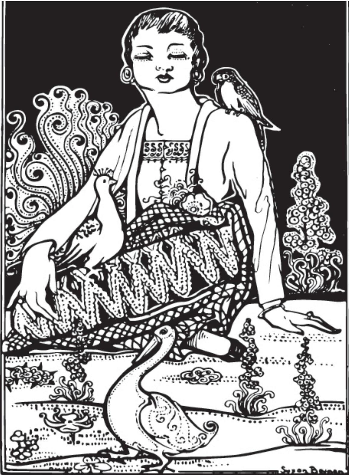
Beynon, S. (1927). Gambar 2 Harita Agan Poetri geus ageung, kana diadjar beuki woewoeh sarëgëp bae; ... (Katja 12). In Poetri leuweung larangan (p. 13). Bale Poestaka; Southeast Asia Digital Library. https://sea.lib.niu.edu/seadl/islandora/object/SEALimages%3A8102#page/14/mode/1up