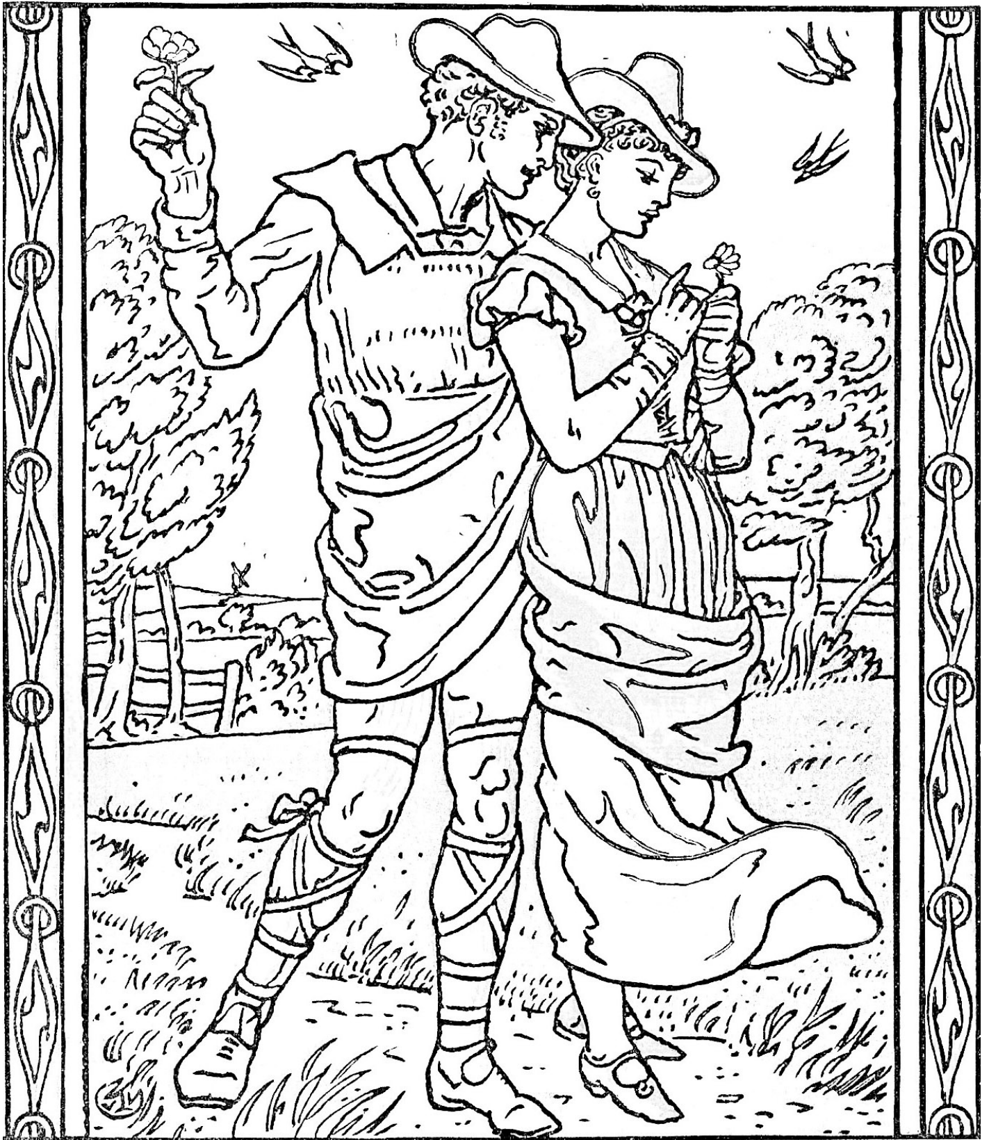
Crane, Walter, et al. Pan-pipes : A Book of Old Songs . Second Edition. London : Novello & Co. : G. Routledge and Sons, 19--