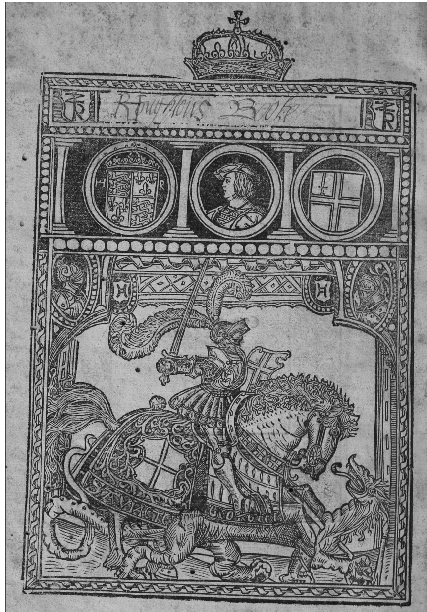
King's College Library. Ranulf Higden, Polycronicon . St George slaying the dragon.