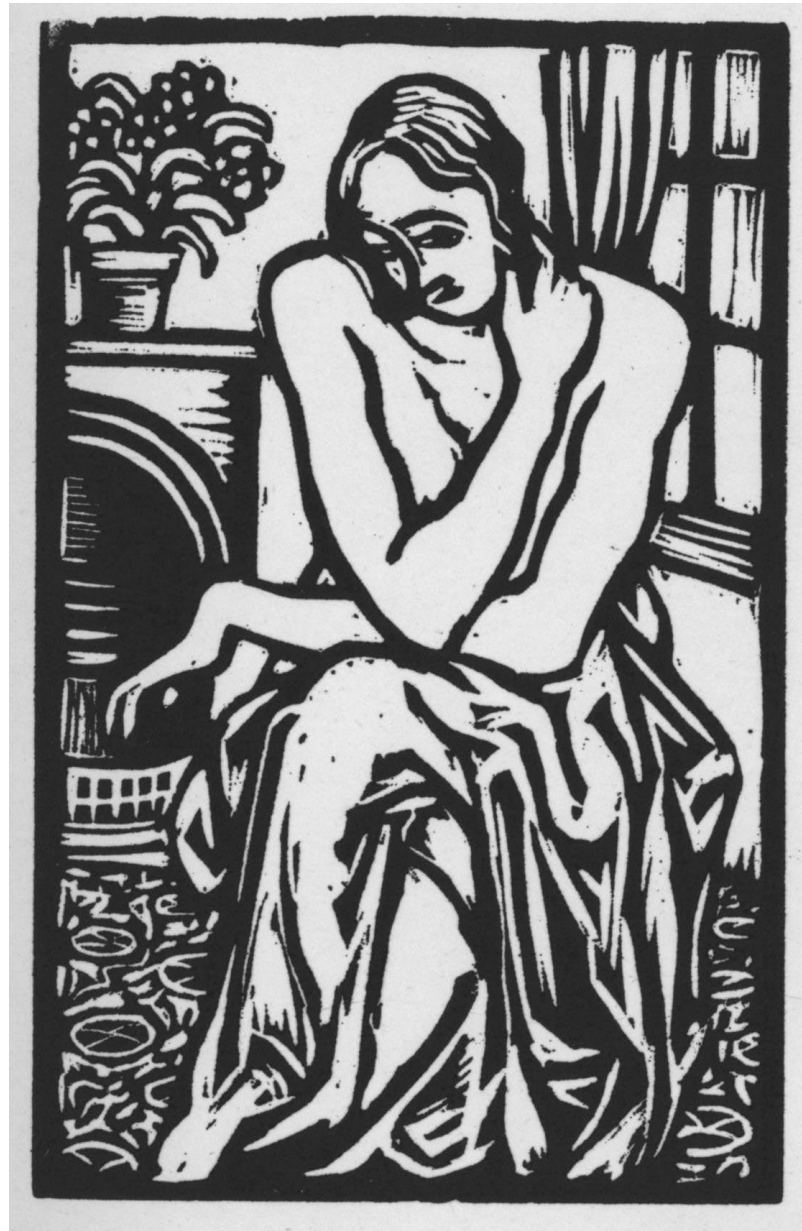
King's College Library. Roger Fry, (1921) Twelve original woodcuts . London: Hogarth Press. A woodcut of a seated woman by Roger Fry.