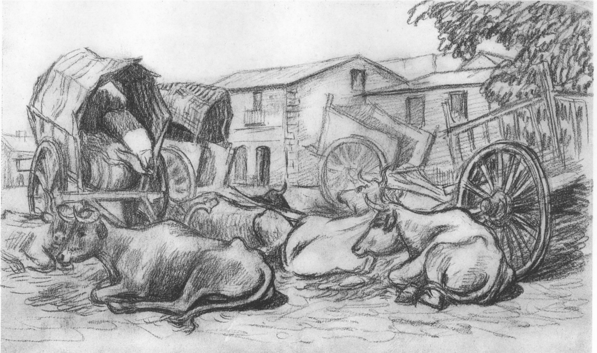
A Sketch by Roger Fry titled "A Siesta - Zamora" produced to illustrate his published work "A Sampler of Castile" published in 1923 by Hogarth Press