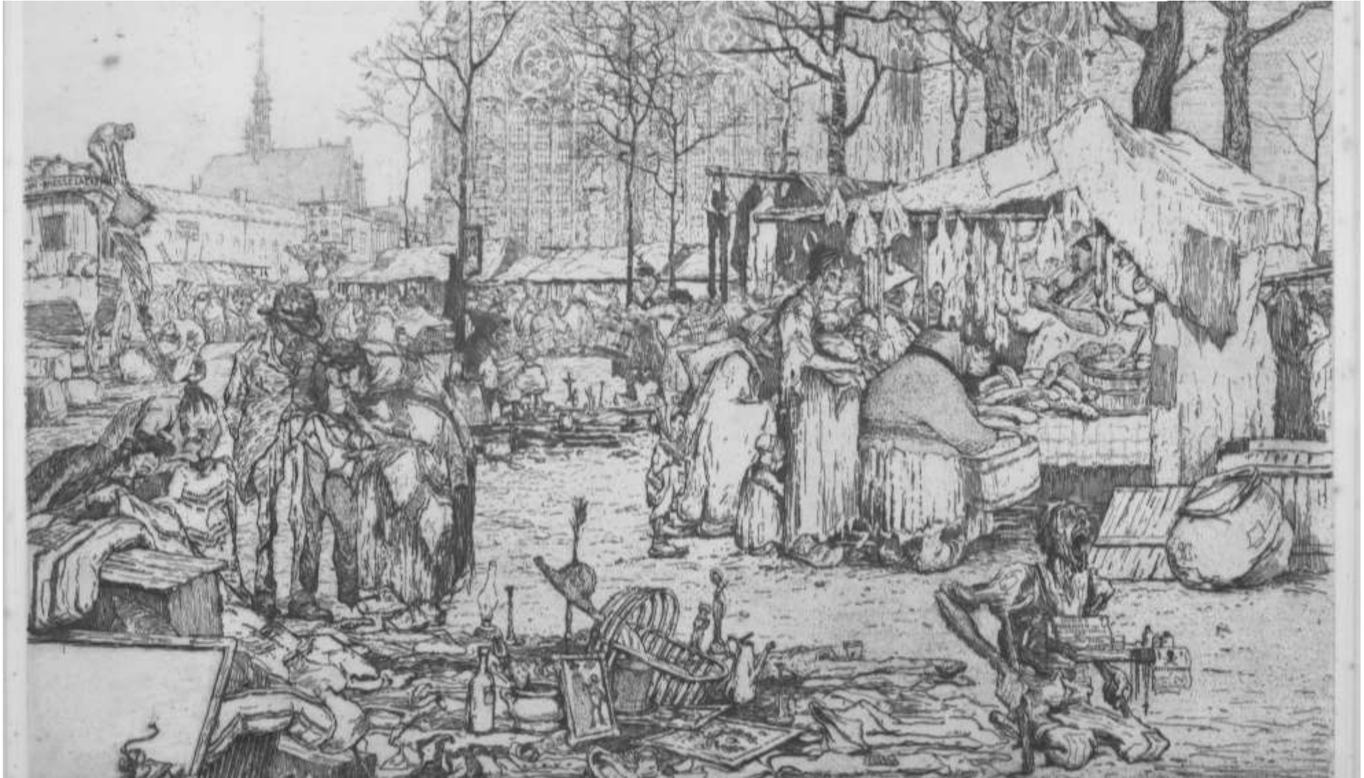
Le vieux marché , by Jules de Bruycker (1907). From the collections of Museum Plantin-Moretus, Antwerp.