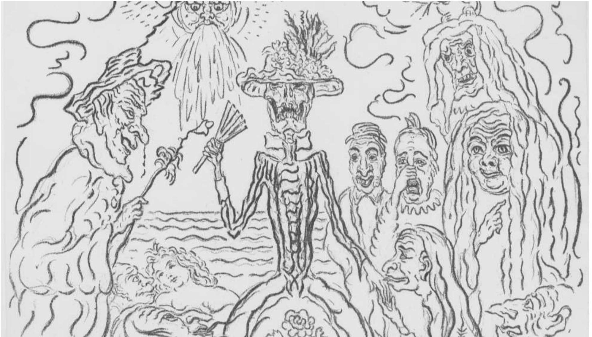
Les masques , by James Ensor (1922). From the collections of Museum Plantin-Moretus, Antwerp.