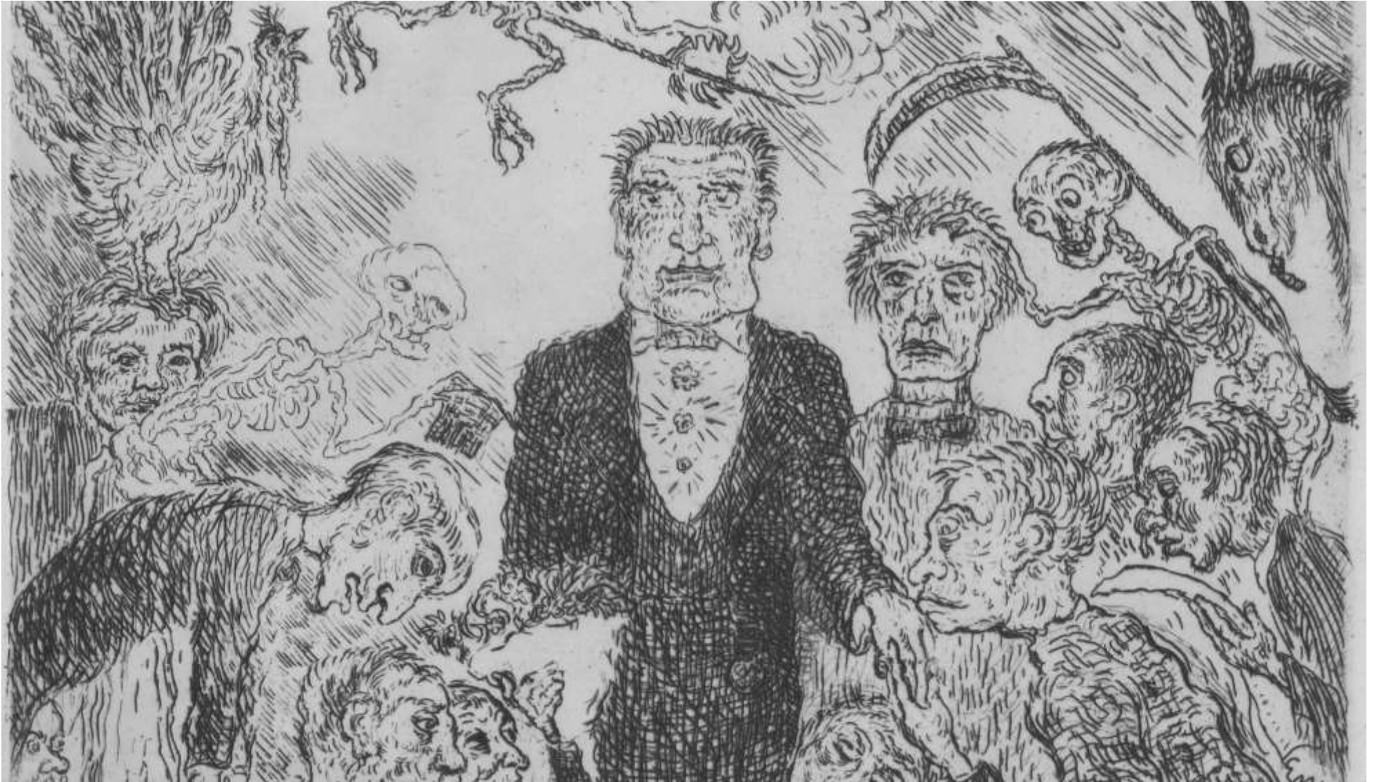
Orgueil , by James Ensor (1904). From the collections of Museum Plantin-Moretus, Antwerp.