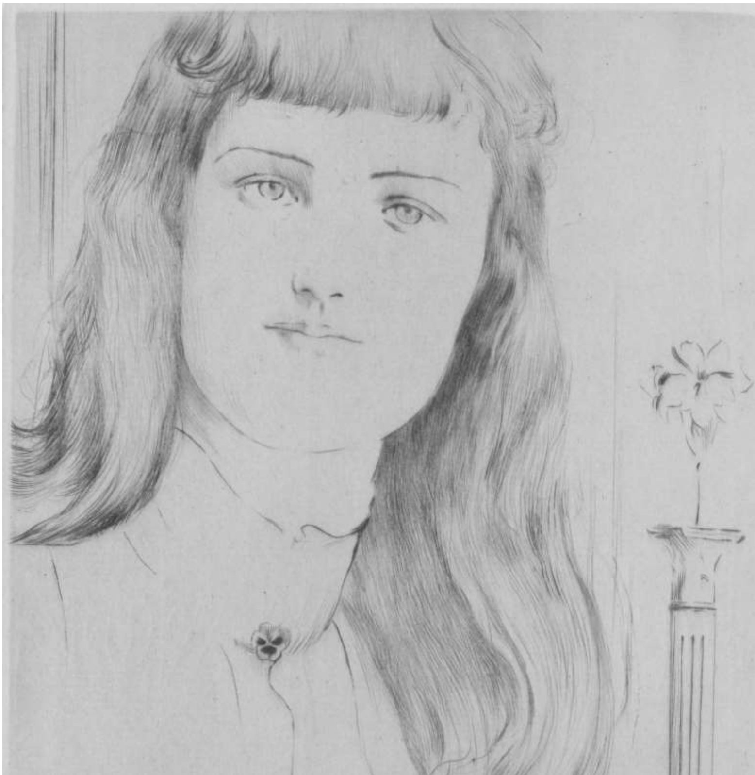
Haarstudie , by Fernand Khnopff (1898). From the collections of Museum Plantin-Moretus, Antwerp.