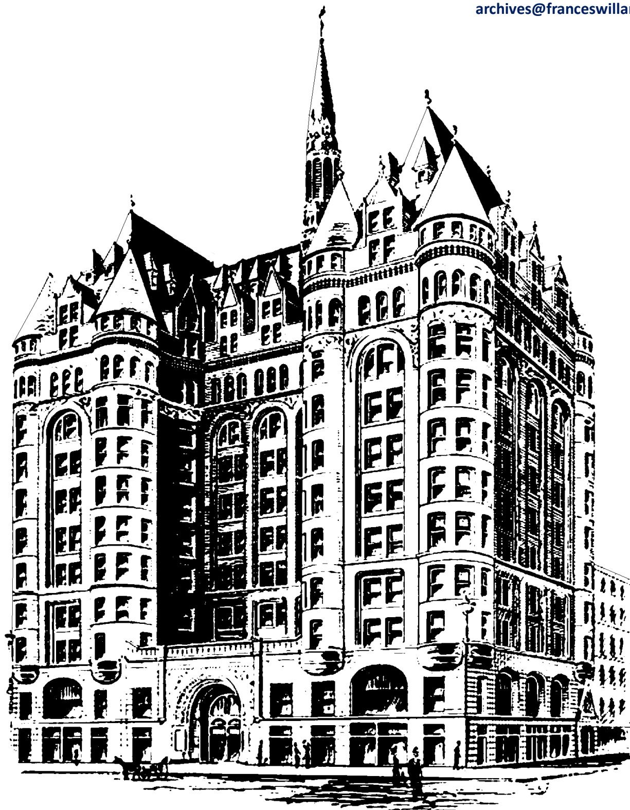
Women's Temple (WCTU Headquarters 1892-1900), Chicago, Illinois From the Women's Temperance Publishing Association Stock Cuts (1901)