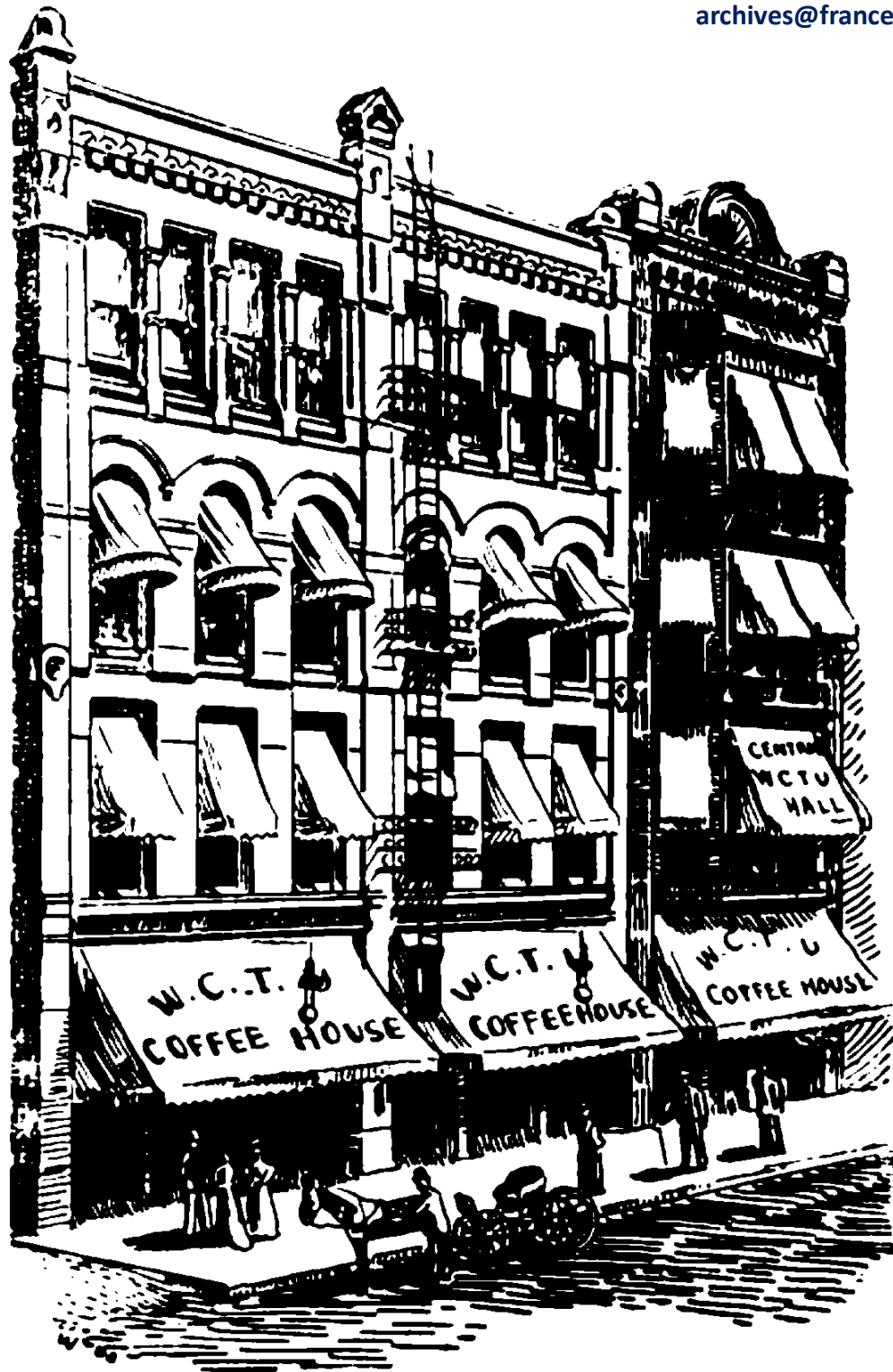
WCTU Temperance Coffee House From the Women's Temperance Publishing Association Stock Cuts (1901)