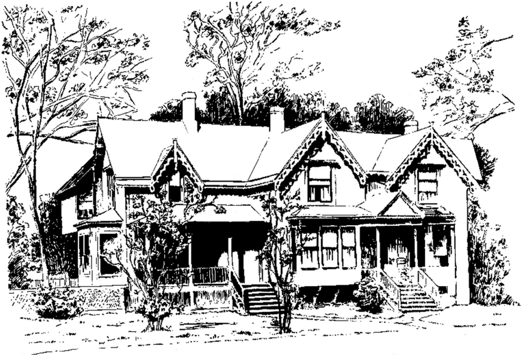
Frances Willard's House, Rest Cottage, Evanston, Illinois From the Women's Temperance Publishing Association Stock Cuts (1901)