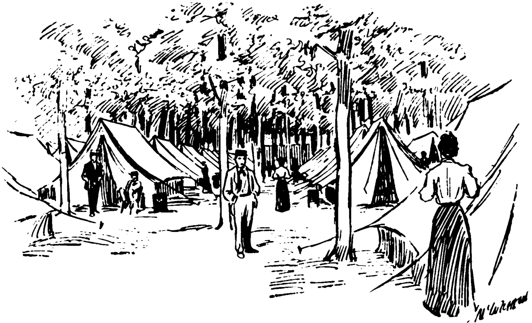
Late 19 th Century Camp Meeting From the Women's Temperance Publishing Association Stock Cuts (1901)