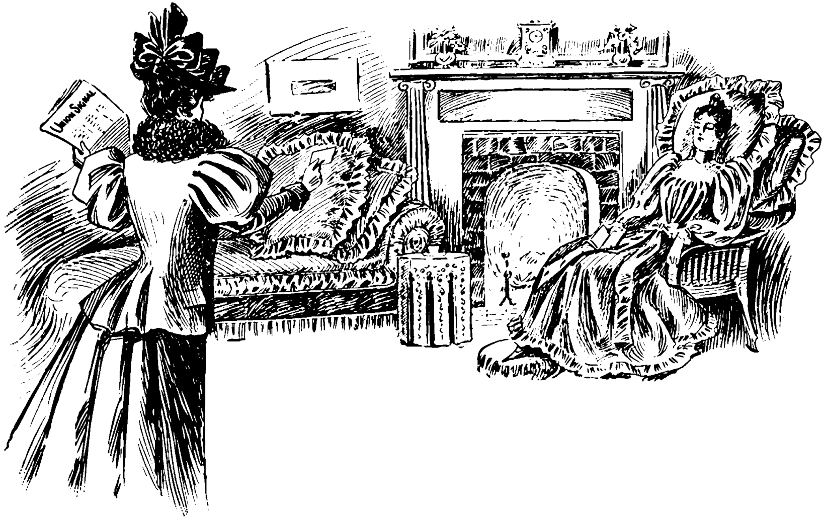
Delivering the Latest Issue of the WCTU's Union Signal From the Women's Temperance Publishing Association Stock Cuts (1901)