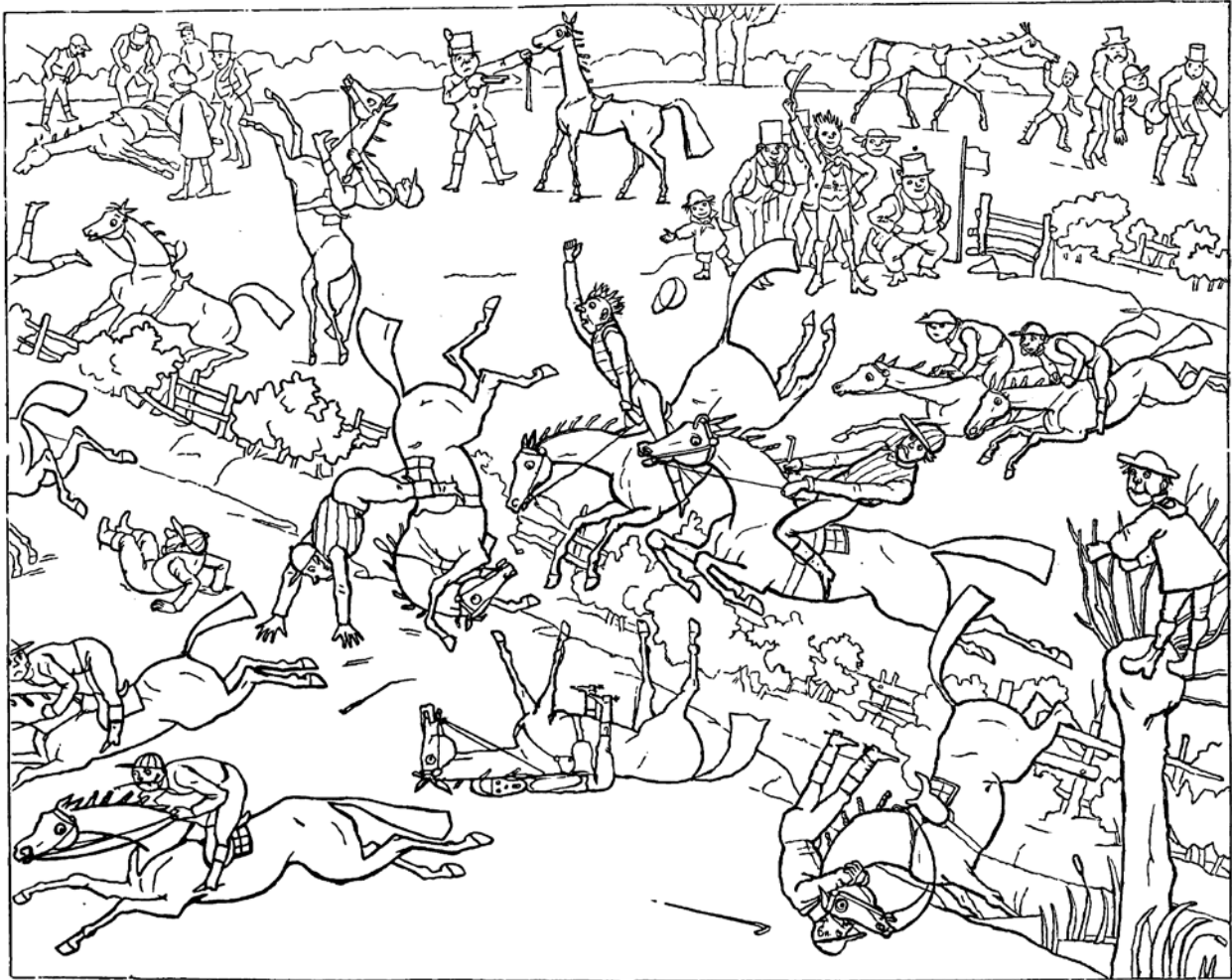
YE NATIONAL SPORTE !!! OF STEEPLE-CHASYNGE.