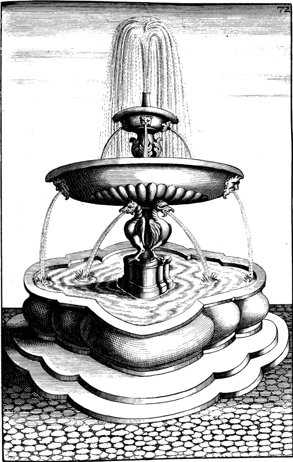
Böckler, Georg Andreas. Architecturacuriosanova . Nürnberg : [s.n., 1664].