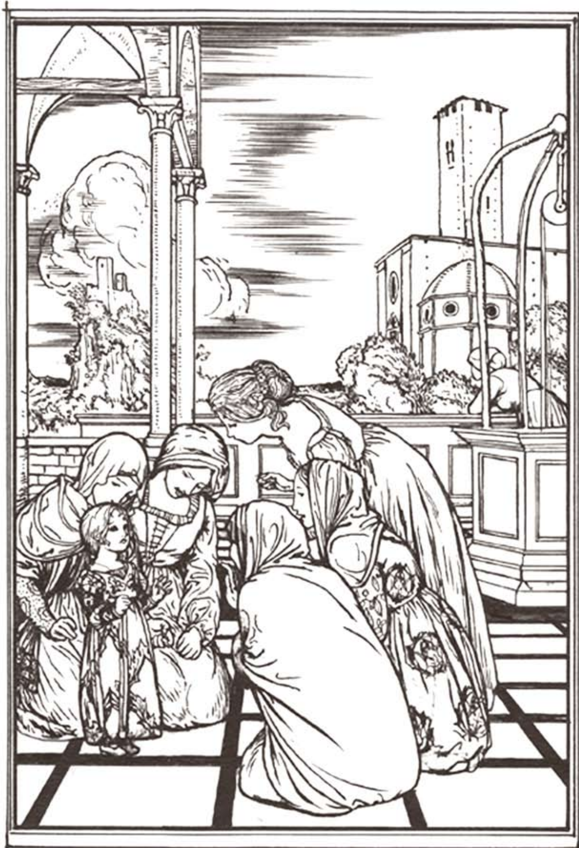
Image: Robert Anning Bell, pen & ink drawing for The Tempest: A Comedy . London: Freemantle & Co., 1901 (ART Box B433 no.23 (size S)) Share your work on Twitter and Instagram! @FolgerLibrary #ColoururCollections