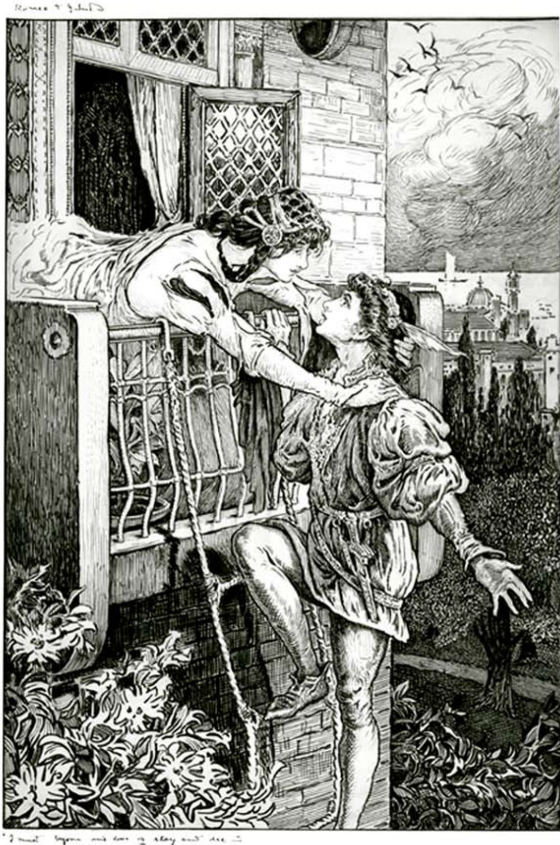
Image: Louis Rhead, pen and ink drawing: "Romeo & Juliet, I must be gone and live, or stay and die," for Charles and Mary Lamb's Tales from Shakespeare . Before 1918 (ART Box R469 no.101 (size L)) Share your coloring with us on Twitter and Instagram! @FolgerLibrary #ColourCollections