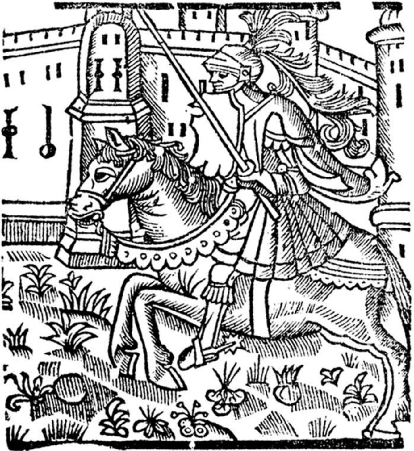
Image: Woodcut from The VVorkes of Our Ancient and Learned English Poet, Geffrey Chaucer, Newly Printed . 1602 (STC 5080 copy 1) We want to see your work on Twitter or Instagram! @FolgerLibrary #ColourCollections