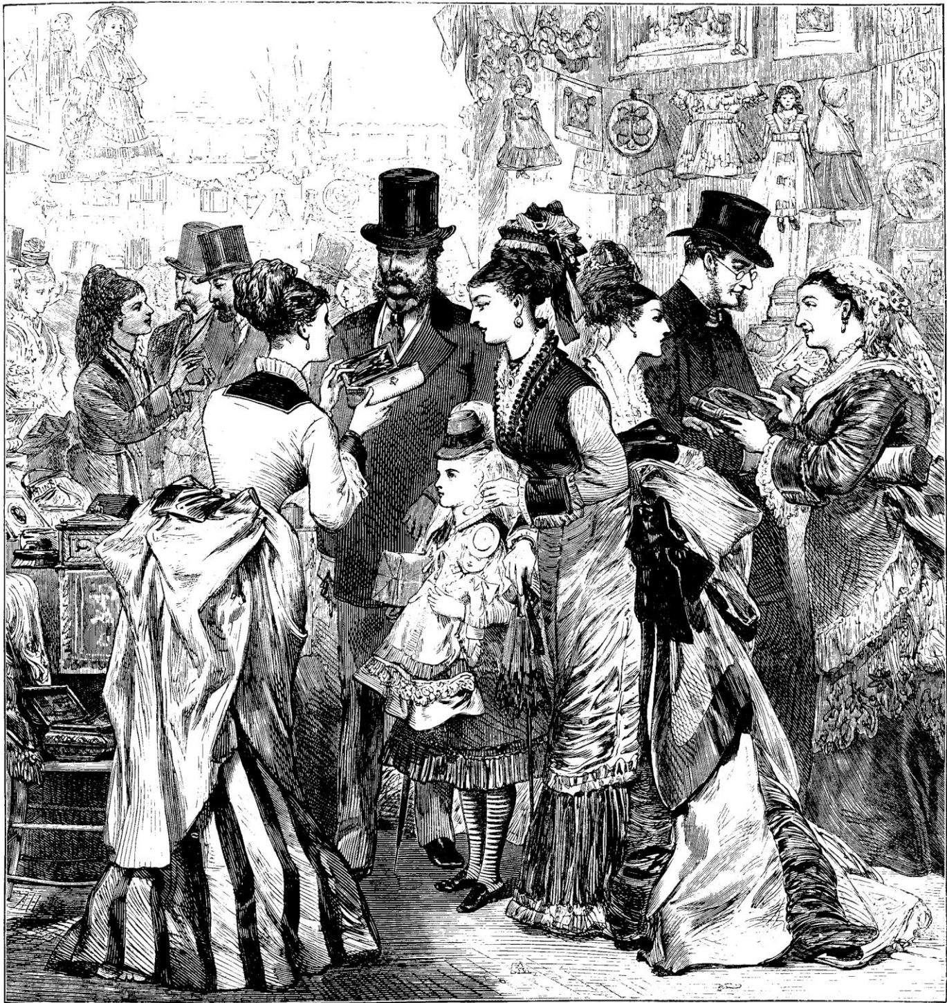
A FASHIONABLE CHARITY BAZAAR.

The illustrated London news. Saturday, June 20, 1874. No. 1817, vol. LXIV. London : William Little, 1874.