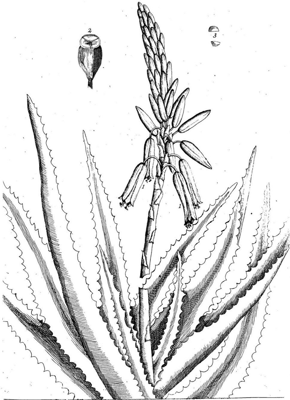
The Succotrine Aloe. } 1. Flower. } 2. Seed Vessel open. } Aloe Succotrina. Eliz. Blackwell delin. sculp. et Pinx. } 3. Seed.

Blackwell, Elizabeth, fl. 1737. A curious herbal, containing five hundred cuts, of the most useful plants, which are now used in the practice of physick. Engraved on folio copper plates, after drawings, taken from the life... . London : printed for Samuel Harding, 1737.