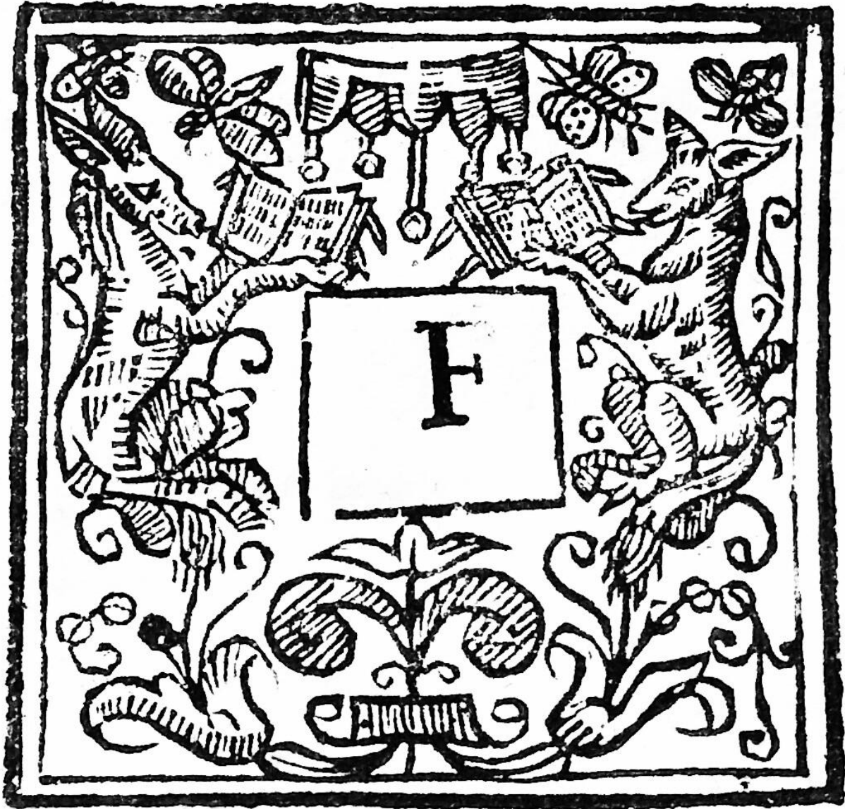
Woodcut initial from Richard Cumberland's De legibus naturae disquisitio philosophica [D15/C91]