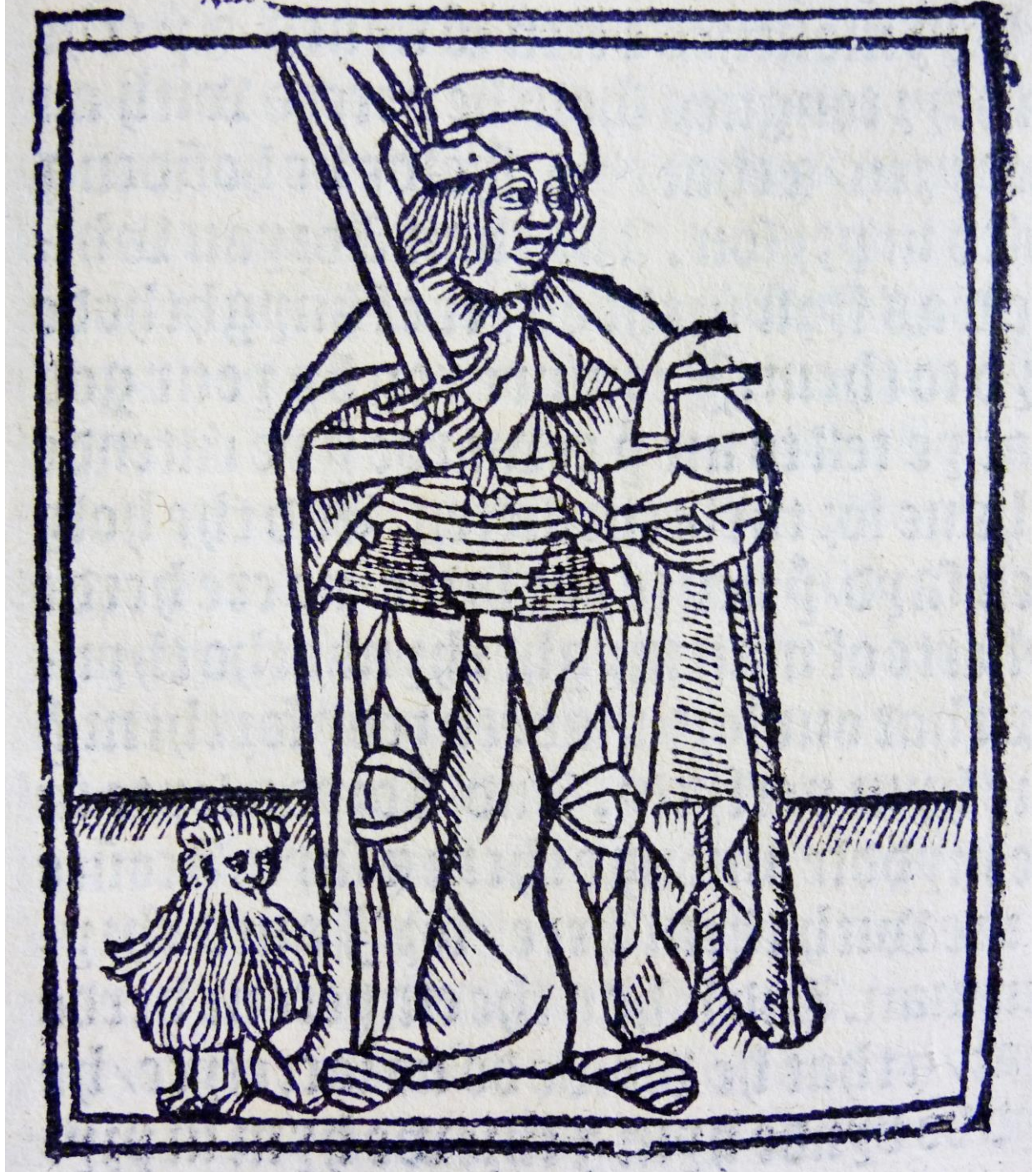
Adrian of Nicodemia, patron of blacksmiths and soldiers, with his anvil from Legenda aurea sanctorum [L40.4/102]