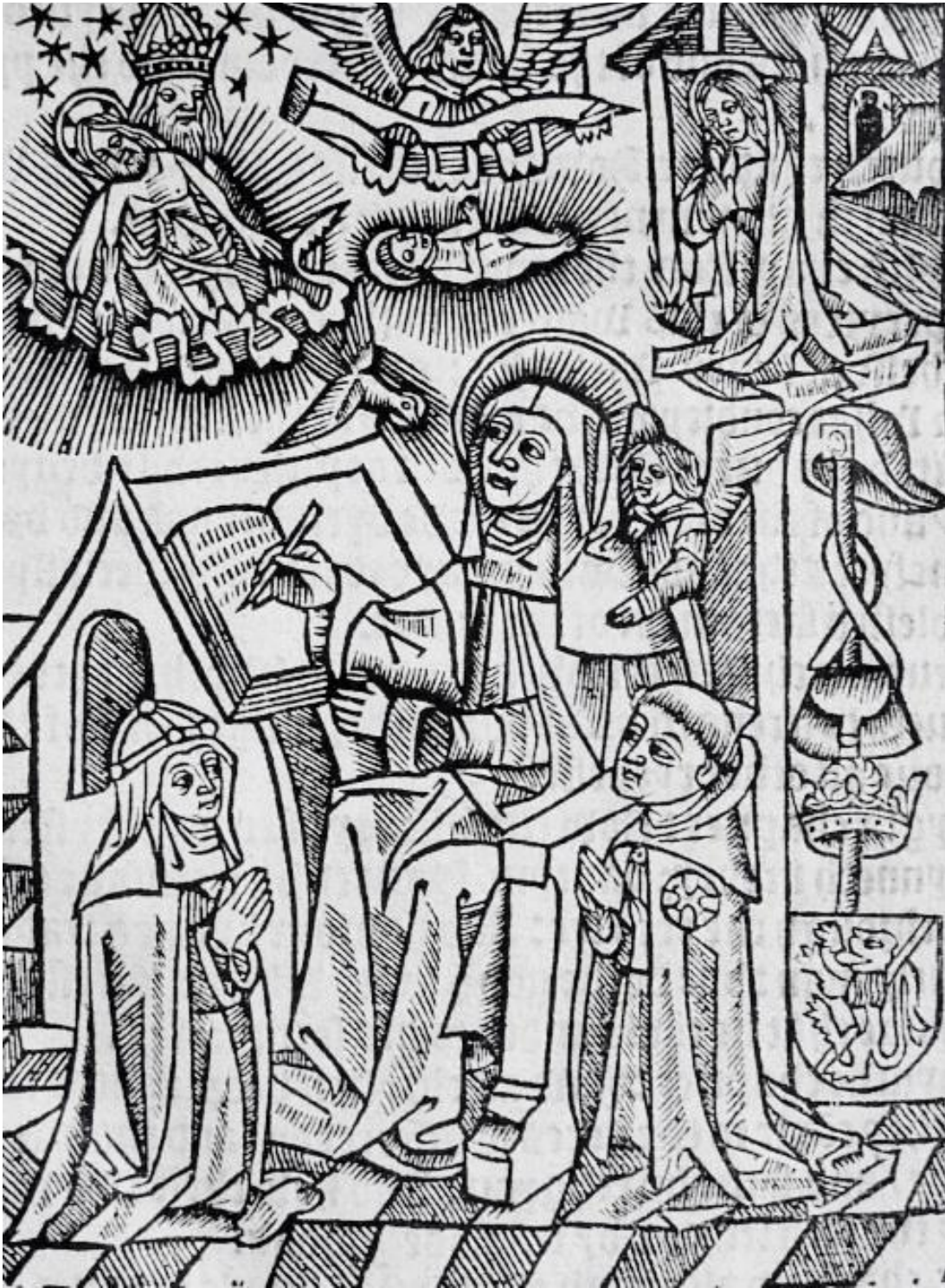
A deuoute treatyse in Englysshe, called the Pilgrymage of perfeccyon [L40.4/106]