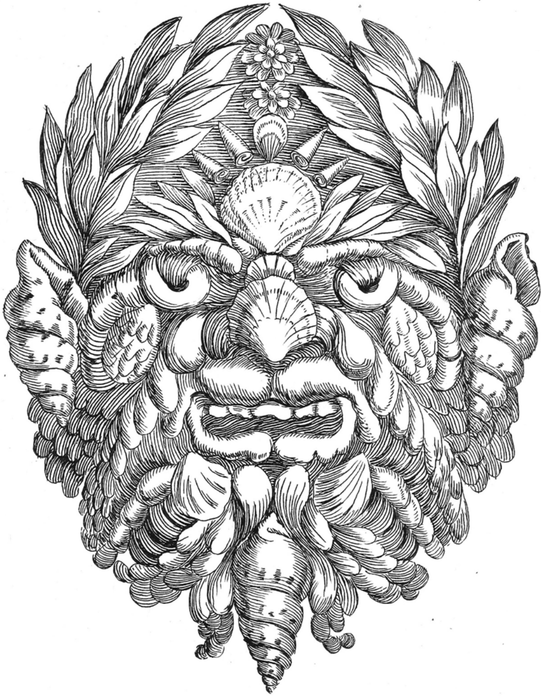
Image from Recreatio mentis et oculi . . . by Filippo Buonanni. Romæ : Ex typographia Varesij, 1684. See the digitized book: http://www.biodiversitylibrary.org/item/204455