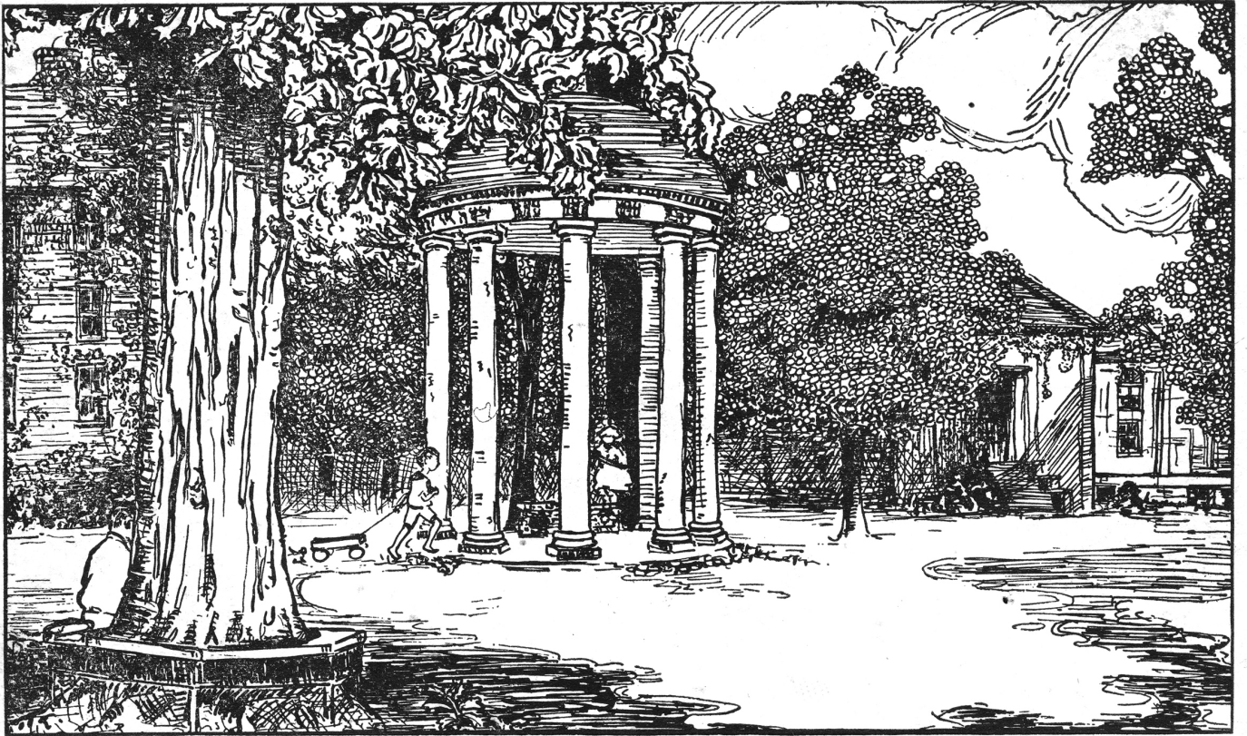
THE COLLEGE WELL

University of North Carolina, Chapel Hill, N. C.