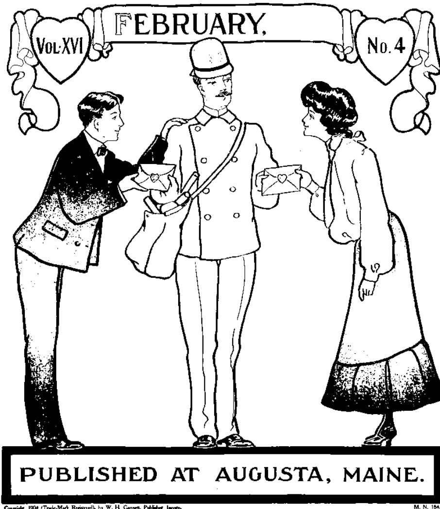
Comfort, v. XVI, no. 4, February 1904.

https://digital.library.villanova.edu/Item/vudl:378294