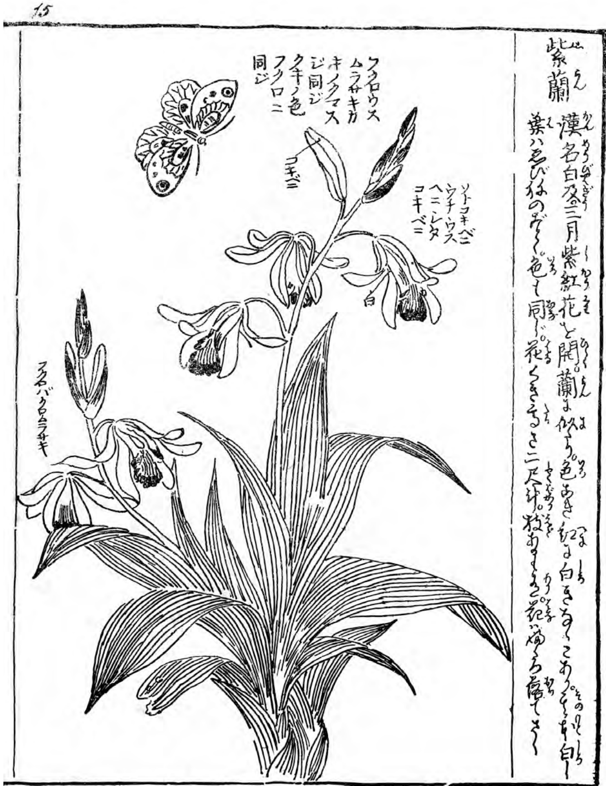
Japanese Botany : being a facsimile of a Japanese book with introductory notes and translations. Philadelphia : J.B. Lippincott & Co., [185-?]