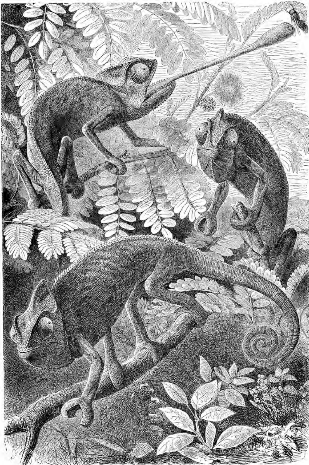
Chamaeleo vulgaris , chameleon.

Bumpus, Hermon C. 1862-1943. Reptilia : written for the Standard Natural History. Boston : Cassino, 1885.