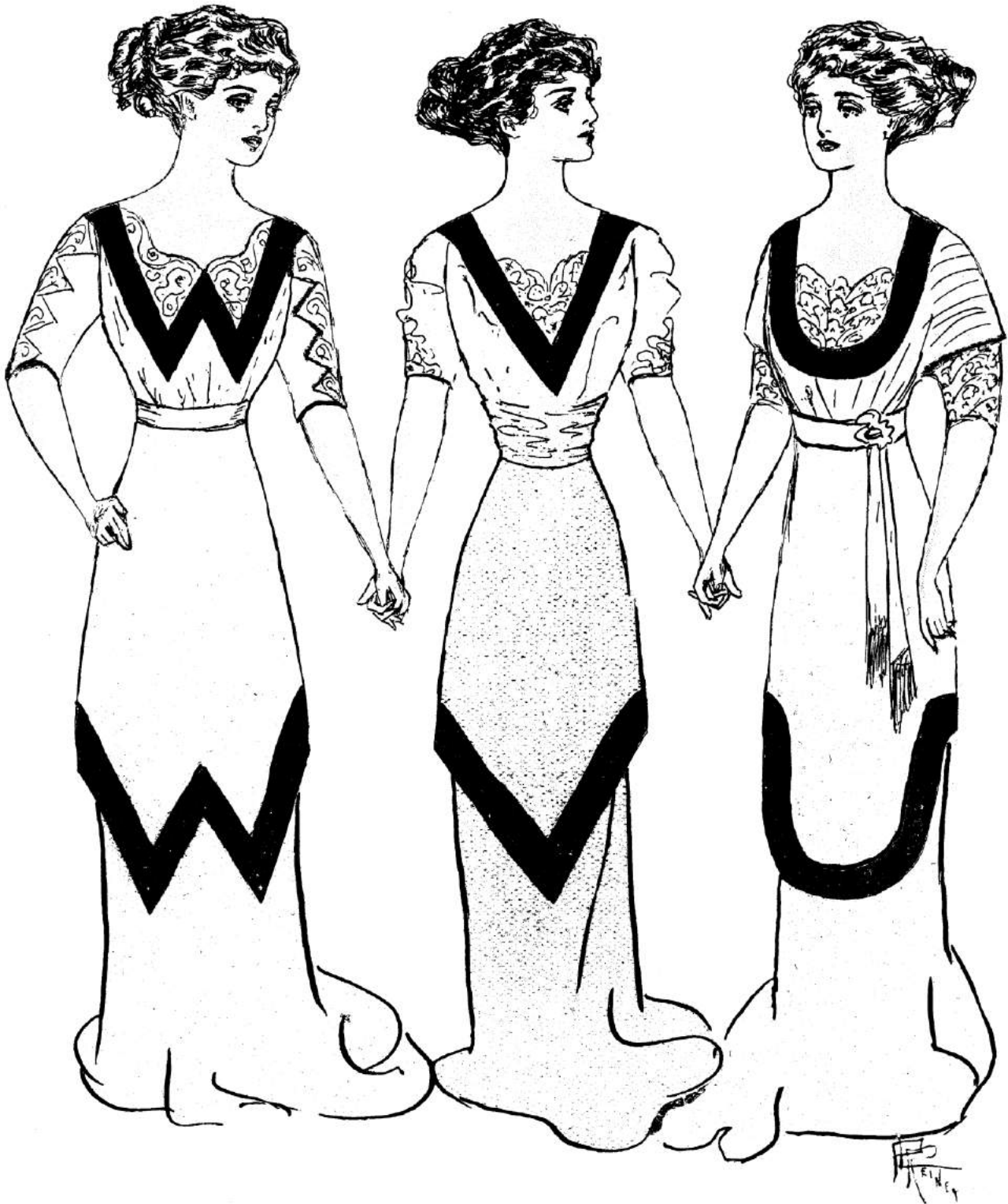
The Monticola of the West Virginia University, Morgantown, W. Va. v.12(1910). Chicago: A.L. Swift & Co.