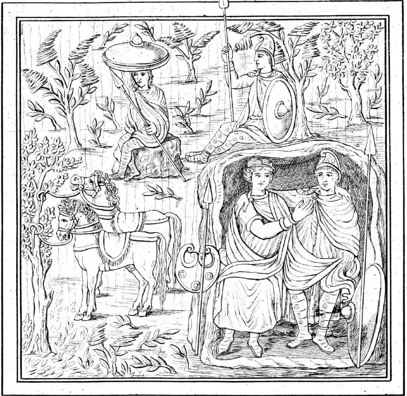
Mai, Angelo. 1835. Homeri Iliados picturae antiquae ex codice Mediolanensi Bibliothecae Ambrosianae . Romae: s.n.