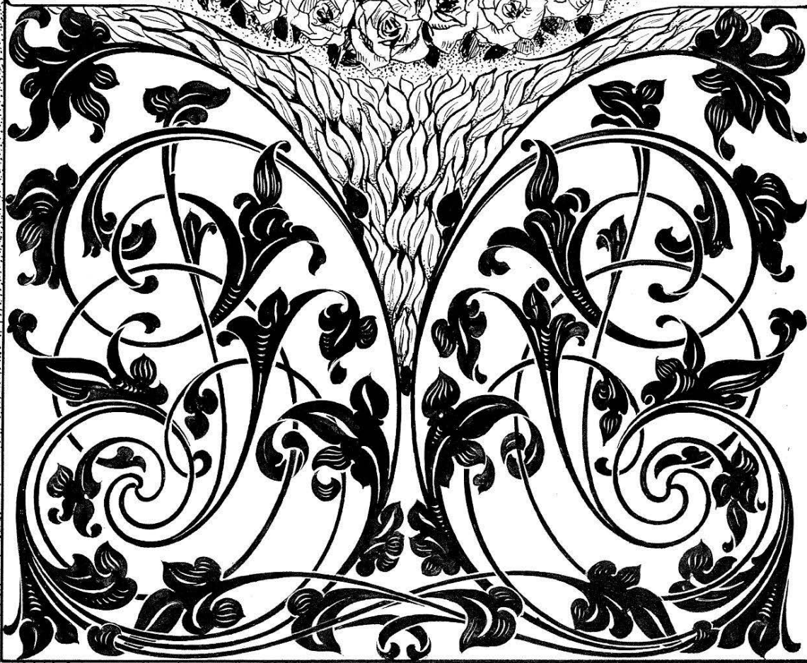
Cover artwork for the Penman's Art Journal , undated