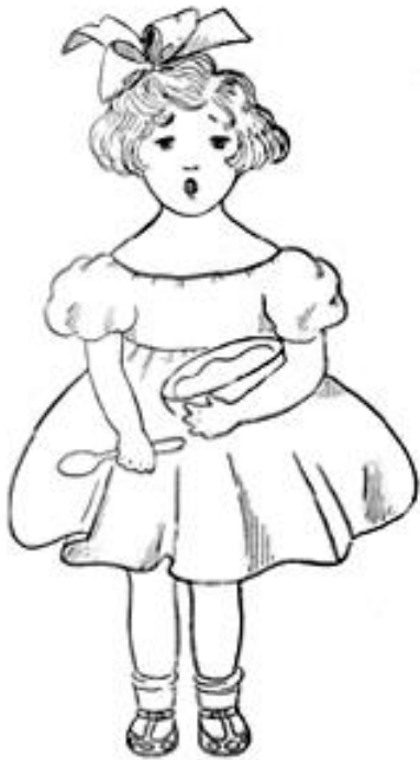
Little Miss Moffat