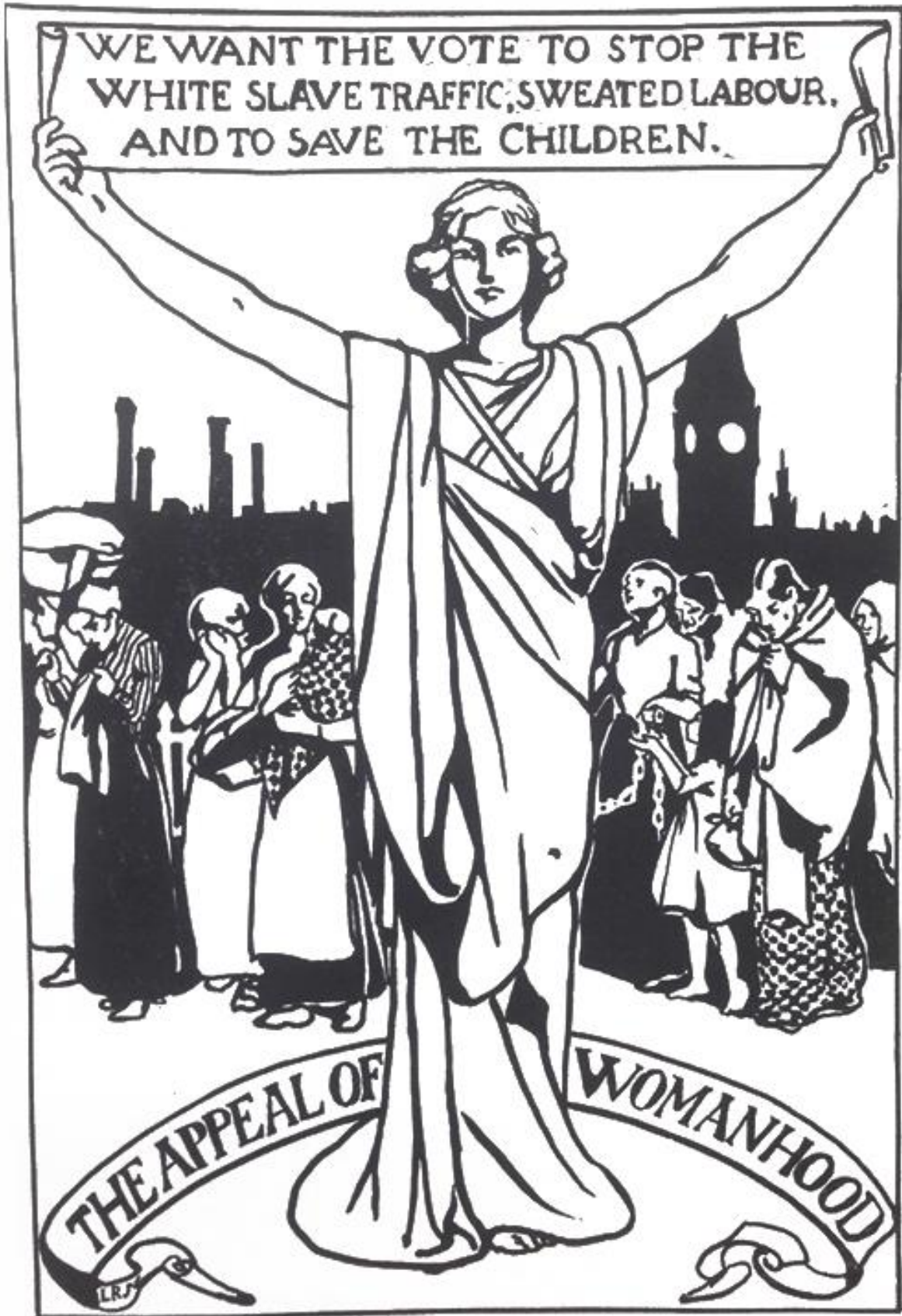
From The Woman's Journal and Suffrage News , July 13, 1912