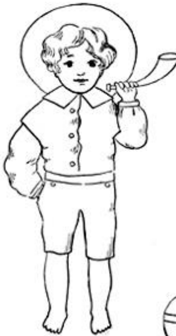
Little Boy Blue