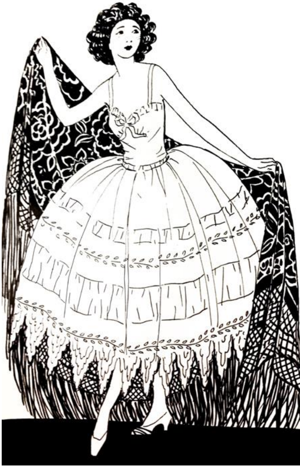
Ad for R.H. Macy & Co., Inc. The Woman Citizen , December 1921.