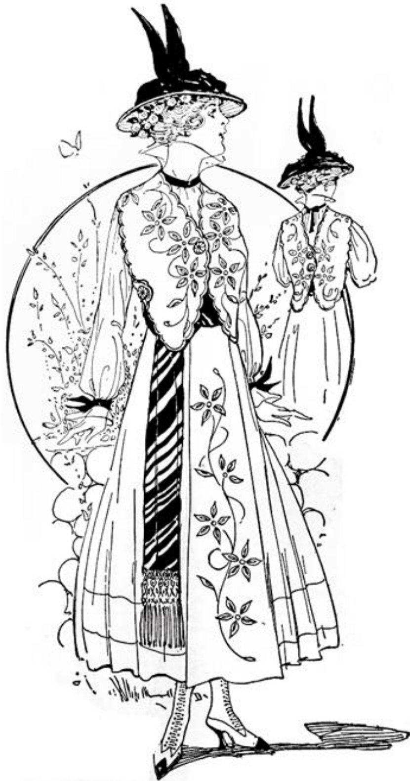
No. 16-6-54. EMBROIDERED SKIRT TO MATCH OVERBLOUSE

Skirt pattern from The Modern Priscilla , June 1916