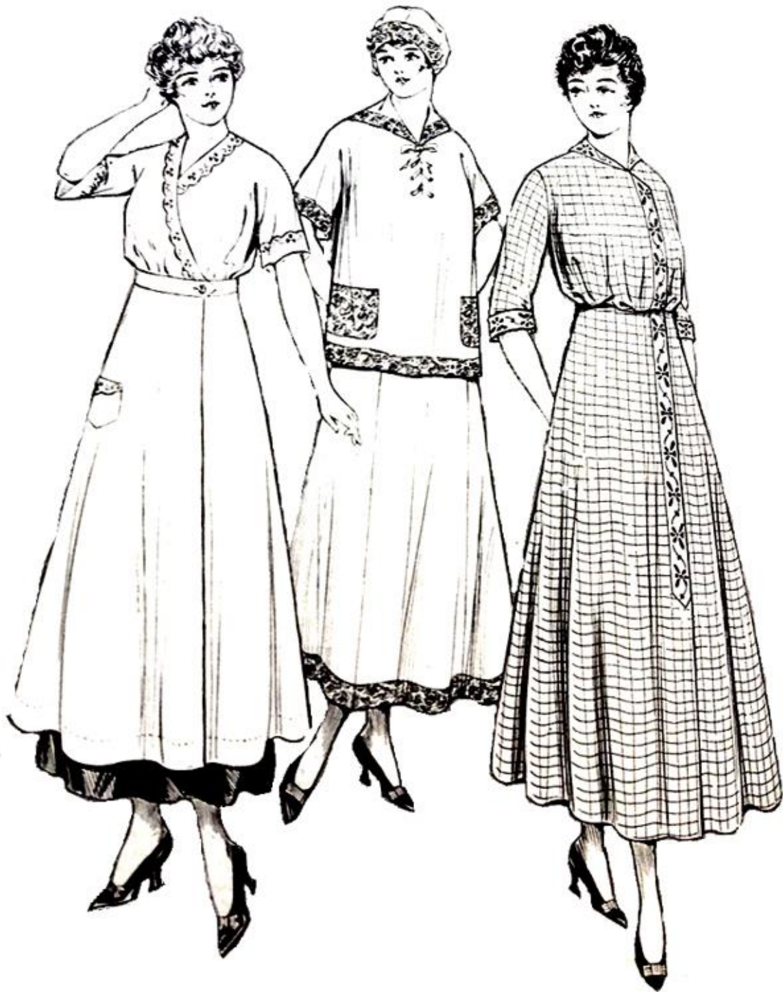
"Good and Serviceable Aprons and Housedresses" The Modern Priscilla , March 1916