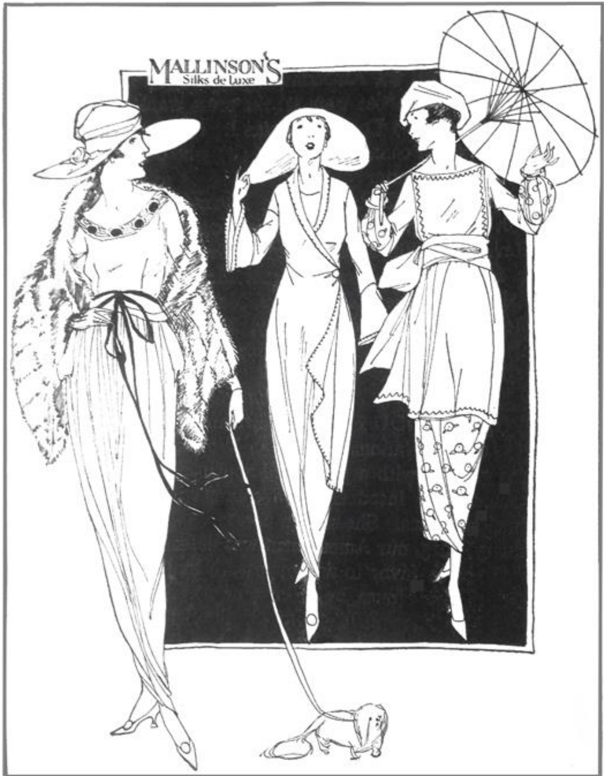
"To be well-dressed is many times the pivotal factor in a woman's career..." Clothing ad for Mallinson's "Silks de Luxe" from The Woman Citizen , April 5, 1919