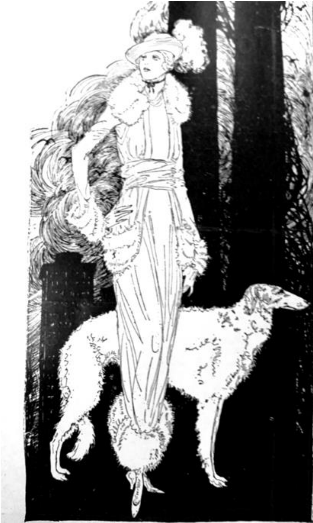
The Woman Citizen , September 1919. Ad for H.R. Mallinson & Company, Inc.