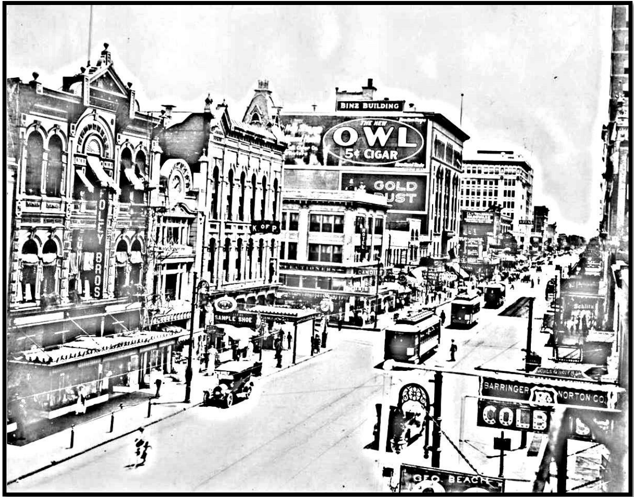
View of Main Street south from Preston Avenue, MSS0114-0685

http://digital.houstonlibrary.org/cdm/ref/collection/images/id/4371