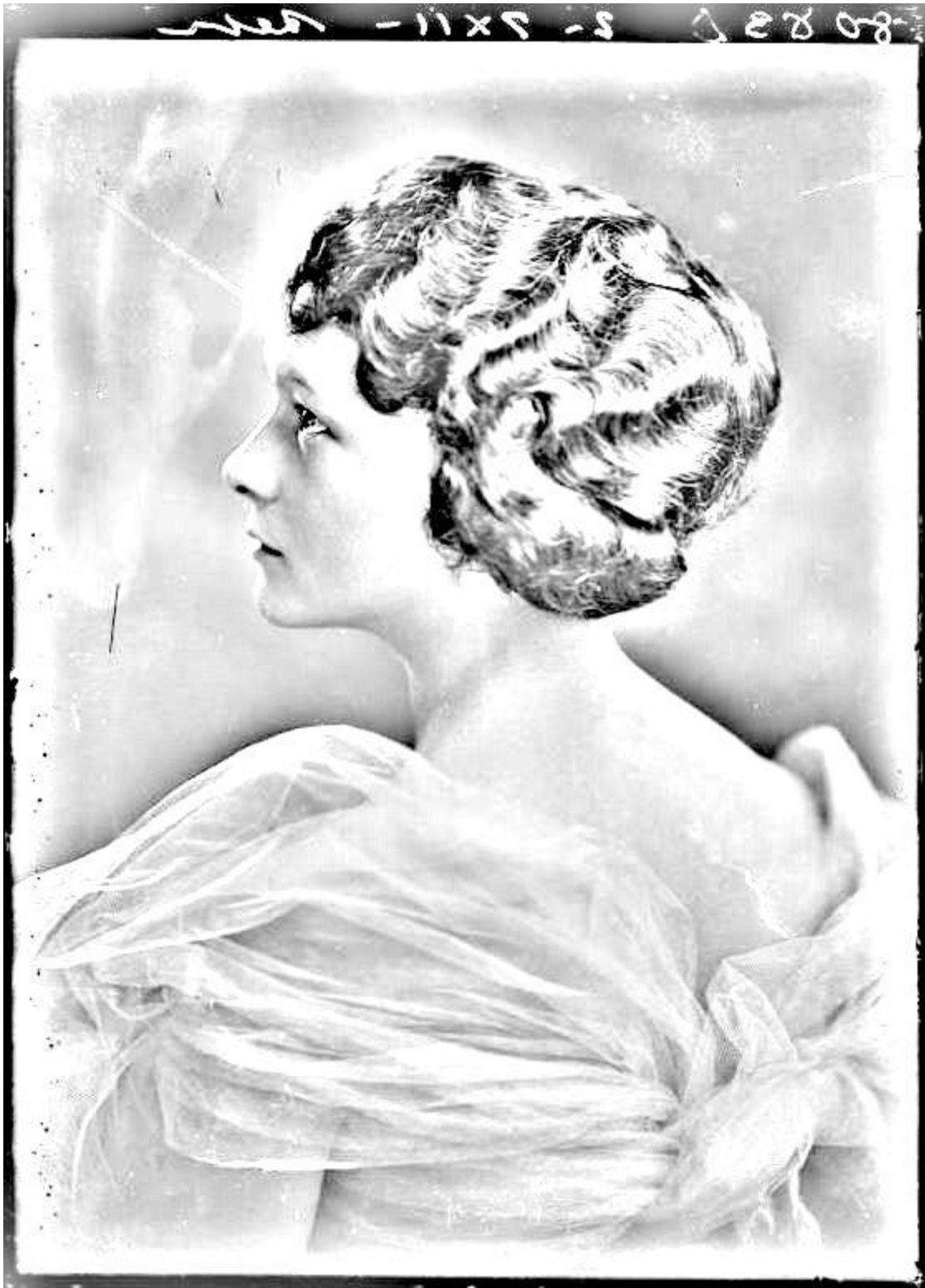
Portrait of a young woman, MSS0215-8083d

http://digital.houstonlibrary.org/cdm/ref/collection/images/id/3536