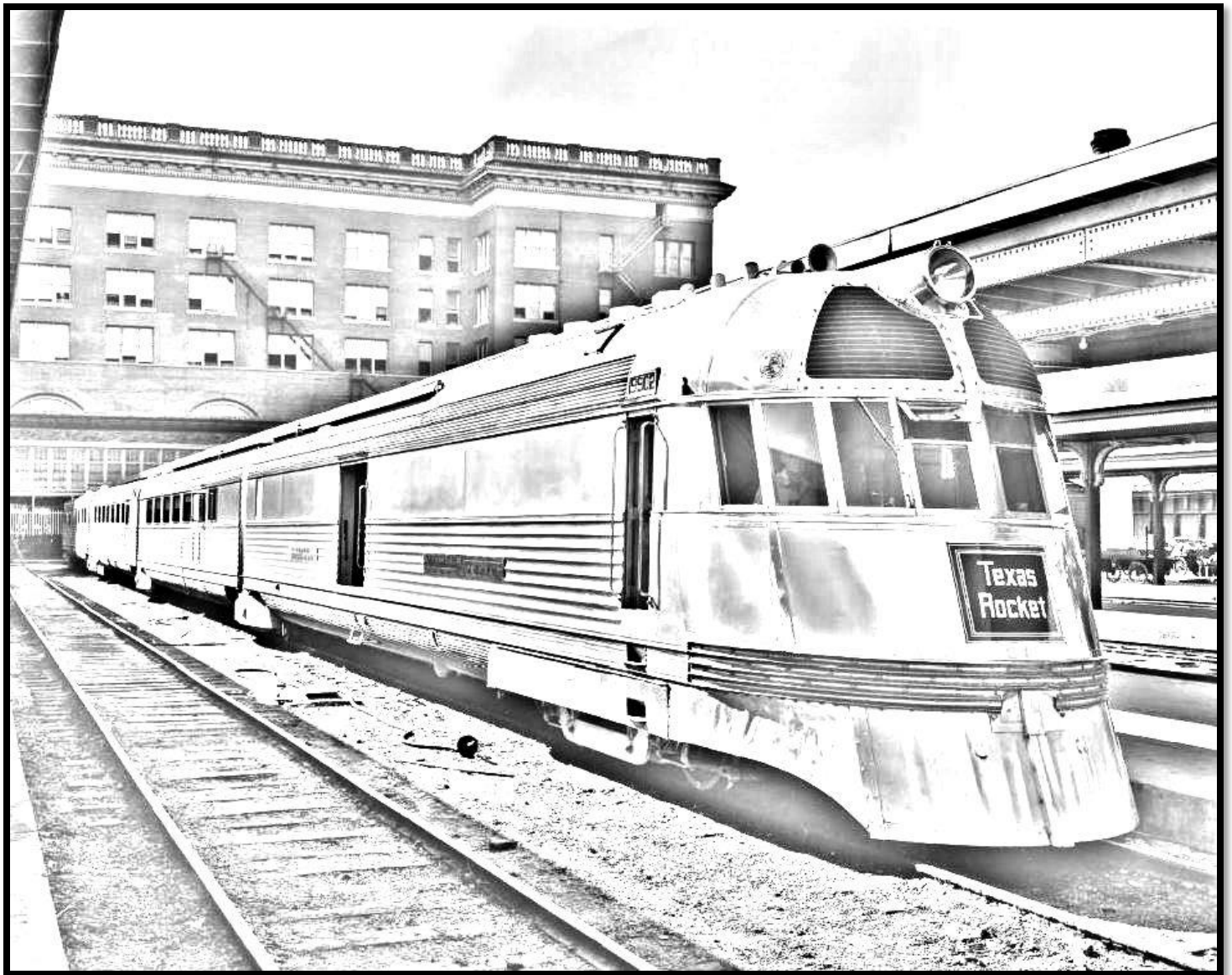
Texas Rocket Train at Union Station, MSS0334-1461

http://digital.houstonlibrary.org/cdm/ref/collection/images/id/1557