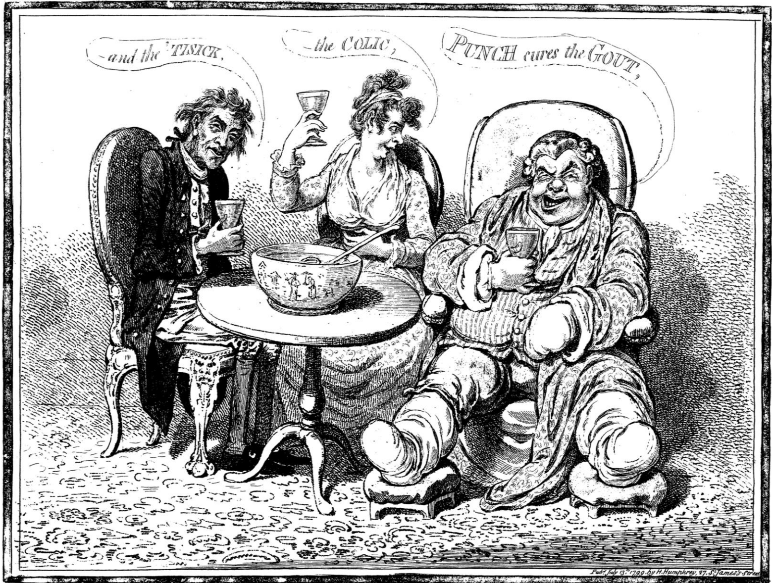
Gillray, J. (1799). Punch cures the gout, the colic, and 'Tisick.'