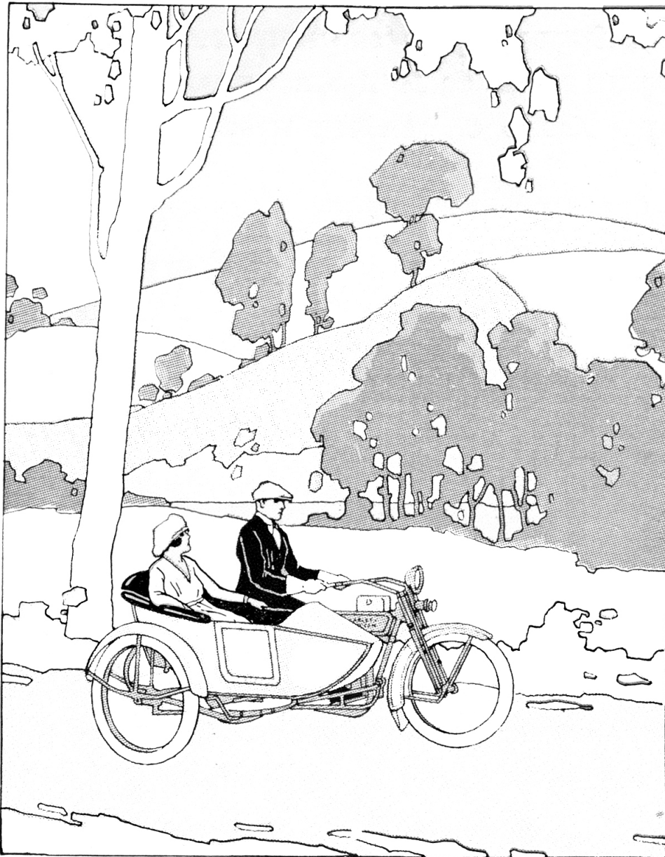
1920 Models Flyer.

See early marketing on display at the Harley-Davidson Museum. 400 West Canal Street, Milwaukee, WI 53201