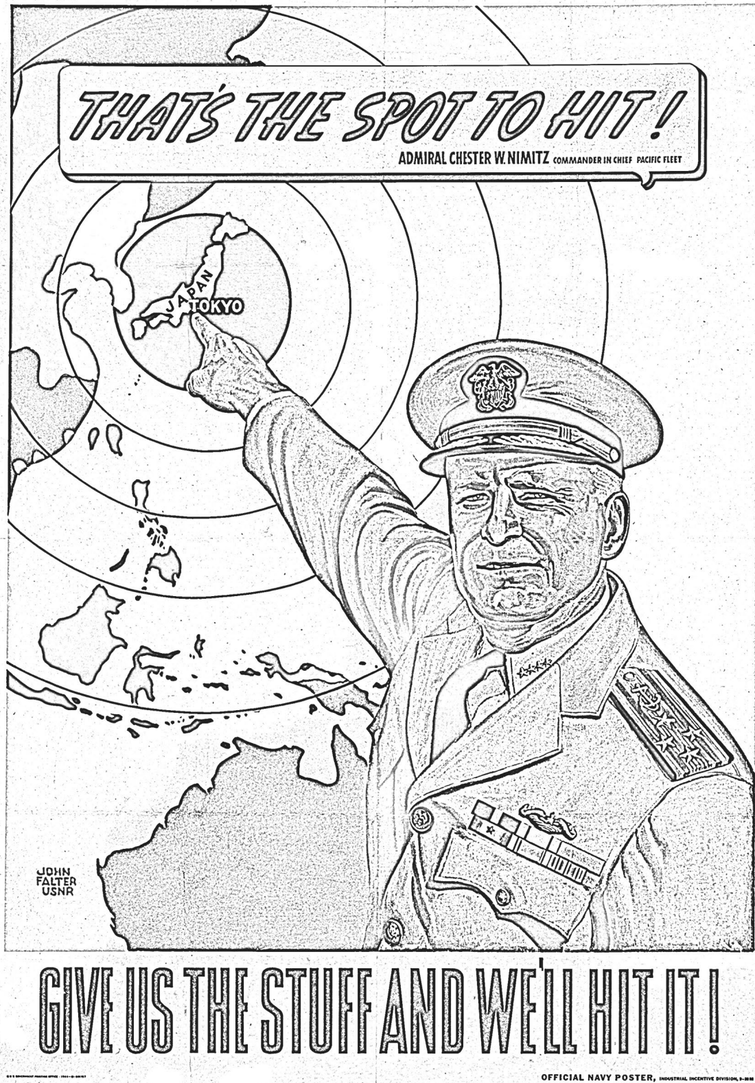
This WWII poster created by John Philip Falter shows Admiral Chester W. Nimitz pointing to Japan on a map and saying, "That's the spot to hit!". Official Navy poster, Industrial Incentive Division, 9-90M ; "U.S. Government Printing Office: 1944