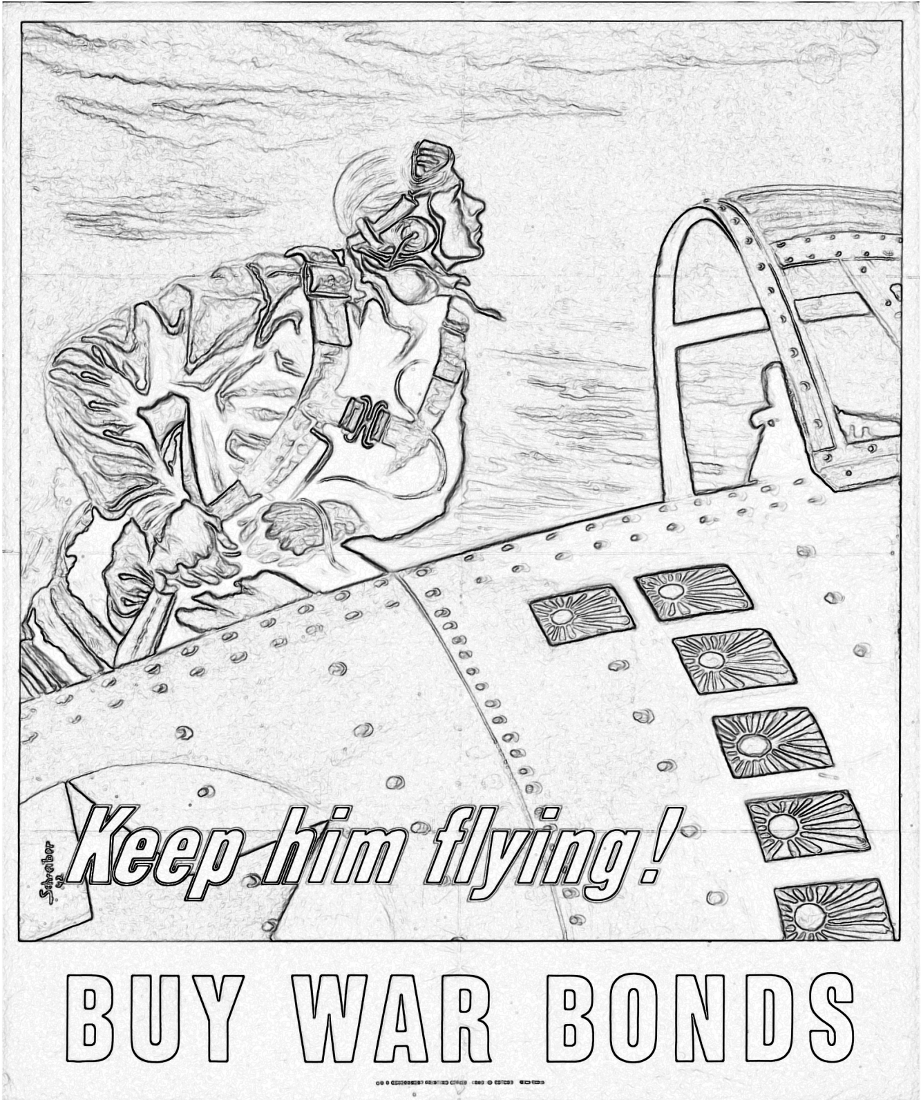
This WWII poster created by Georges Schreiber depicts a pilot strapping himself into a cockpit, with six Rising Sun flags painted on the side of the plane, indicating the future destruction of Imperial Japan. Produced in Washington, D.C.; "U.S. Government Printing Office: 1943"