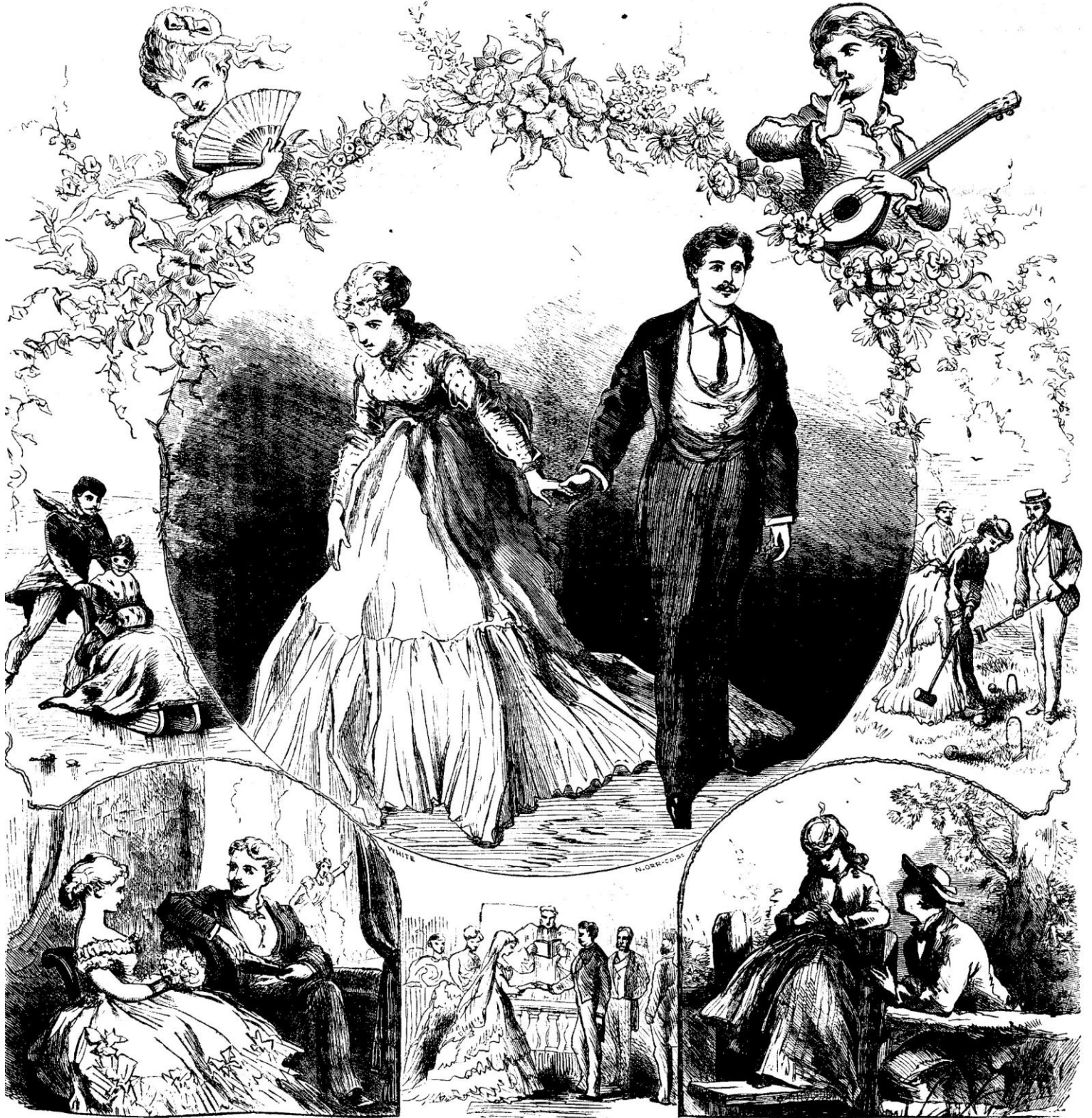
Belles and Beaux: A Home Weekly for Winter Nights and Summer Days , v. 1, no. 1 (January 31, 1874). Nickels and Dimes , https://dimenovels.lib.niu.edu/islandora/object/dimenovels:246477