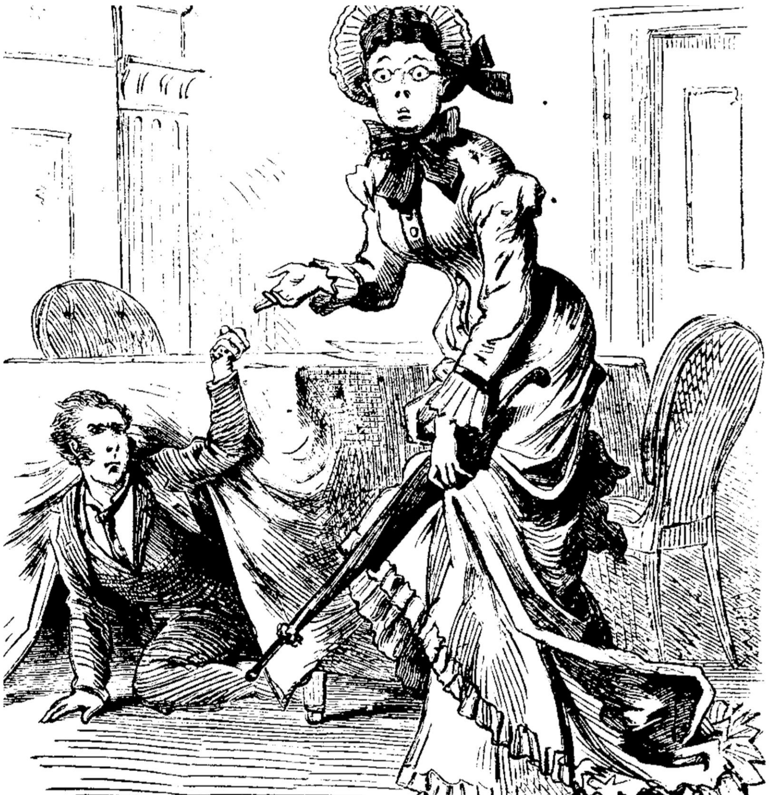
Dime Dialogues , no. 25 (1879). Nickels and Dimes , https://dimenovels.lib.niu.edu/islandora/object/dimenovels:254203

FROM THE COLLECTIONS OF JOHANNSEN AND LEBLANC