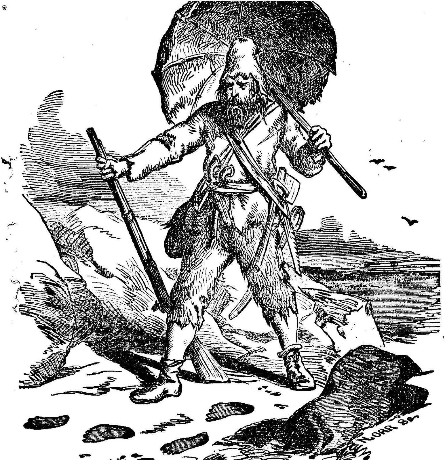
Defoe, Daniel. The Life and Surprising Adventures of Robinson Crusoe . Beadle's Dime Classic Stories , no. 1 (1864). Nickels and Dimes , https://dimenovels.lib.niu.edu/islandora/object/dimenovels:291536

FROM THE COLLECTIONS OF JOHANNSEN AND LEBLANC