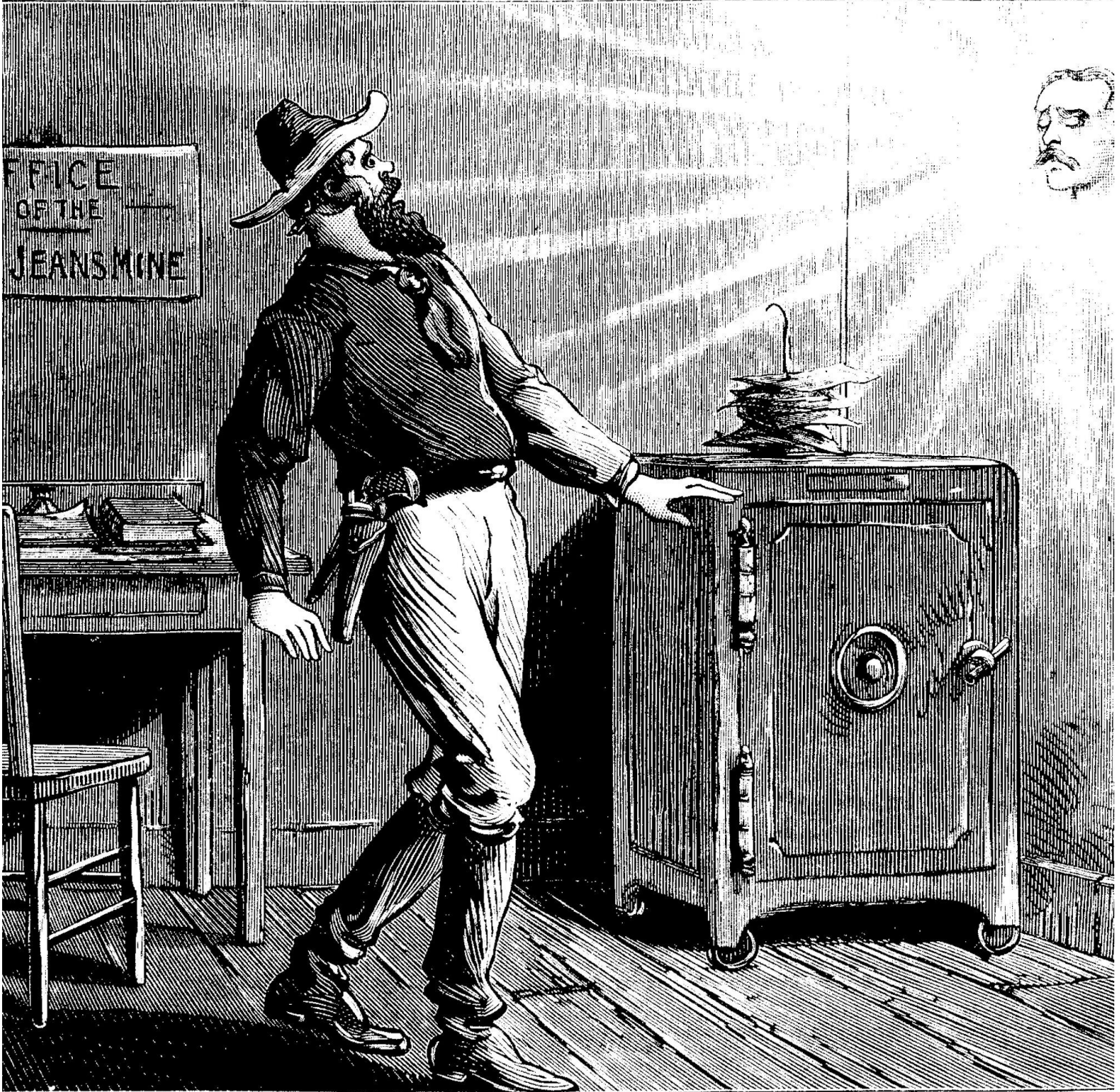
WYNDER STARED AT THE AWFUL APPARITION, HIS BLOOD SEEMING CLOGGED IN HIS VEINS AND HIS HEART ALMOST CEASING T