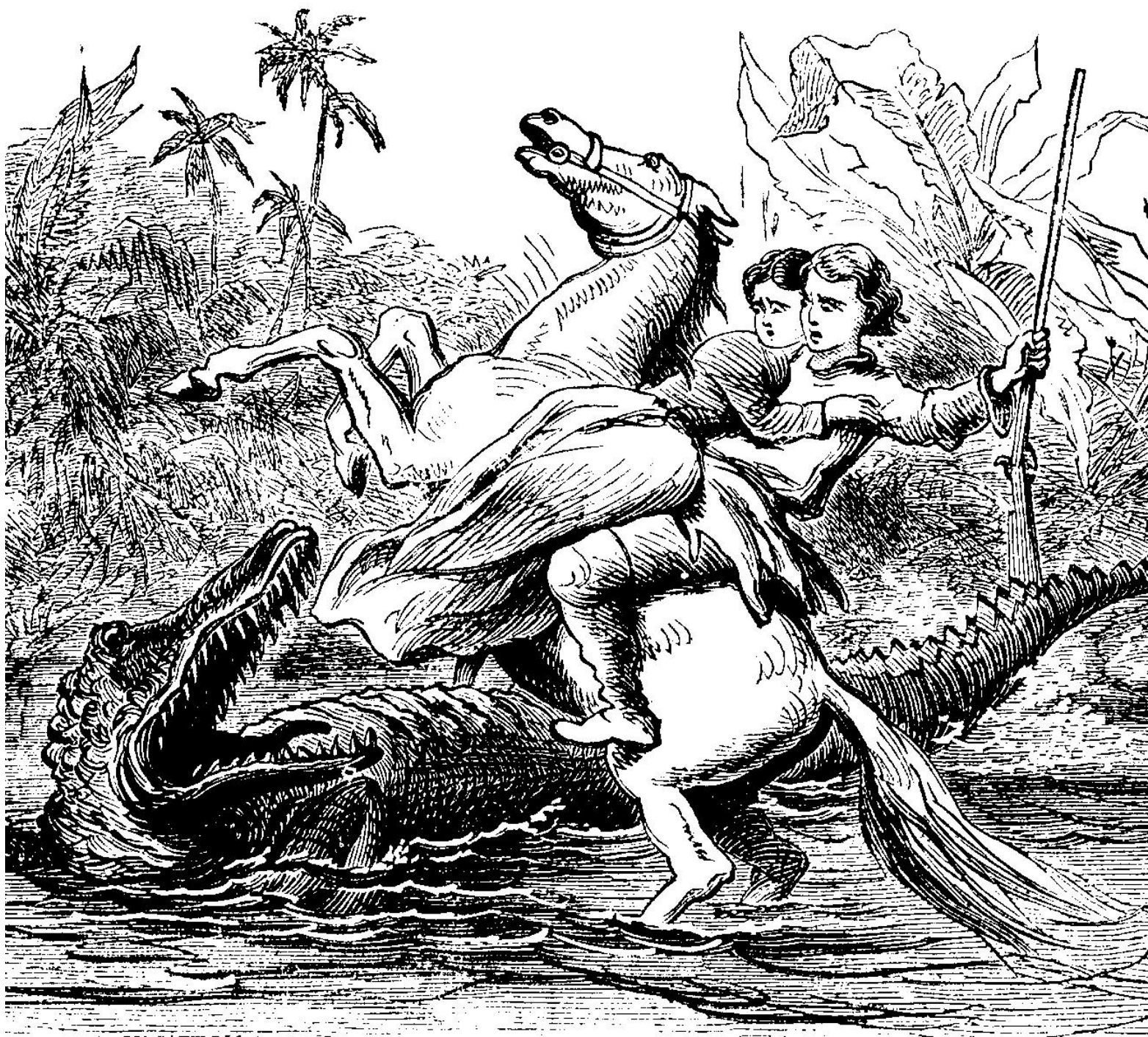
Welland looked down and saw the huge, cavernous mouth of a monstrous alligator.