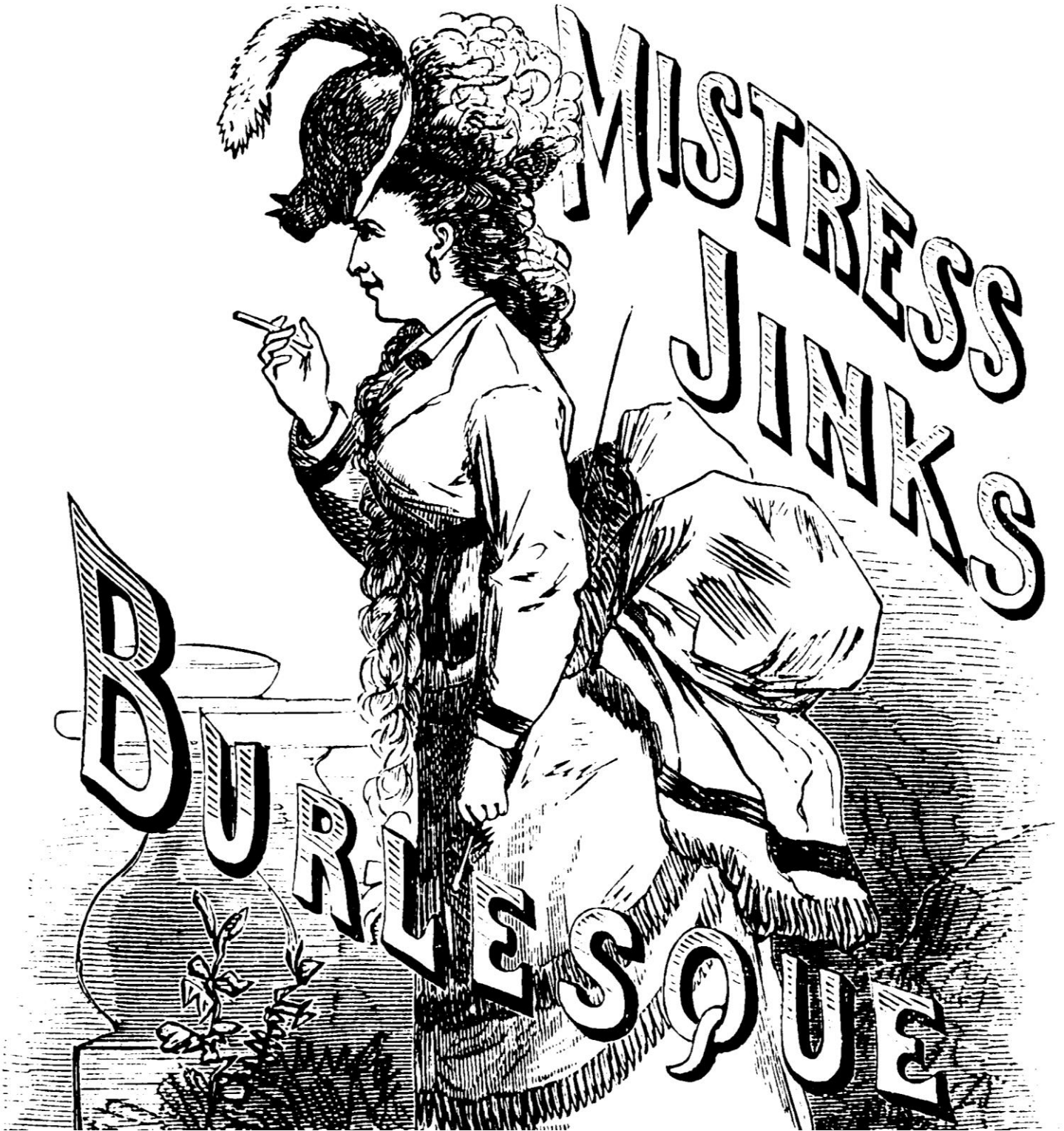
Mistress Jinks Burlesque Songster. Beadle's Dime Song Books, no. 24 (1869). Nickels and Dimes, https://dimenovels.lib.niu.edu/islandora/object/dimenovels:282738