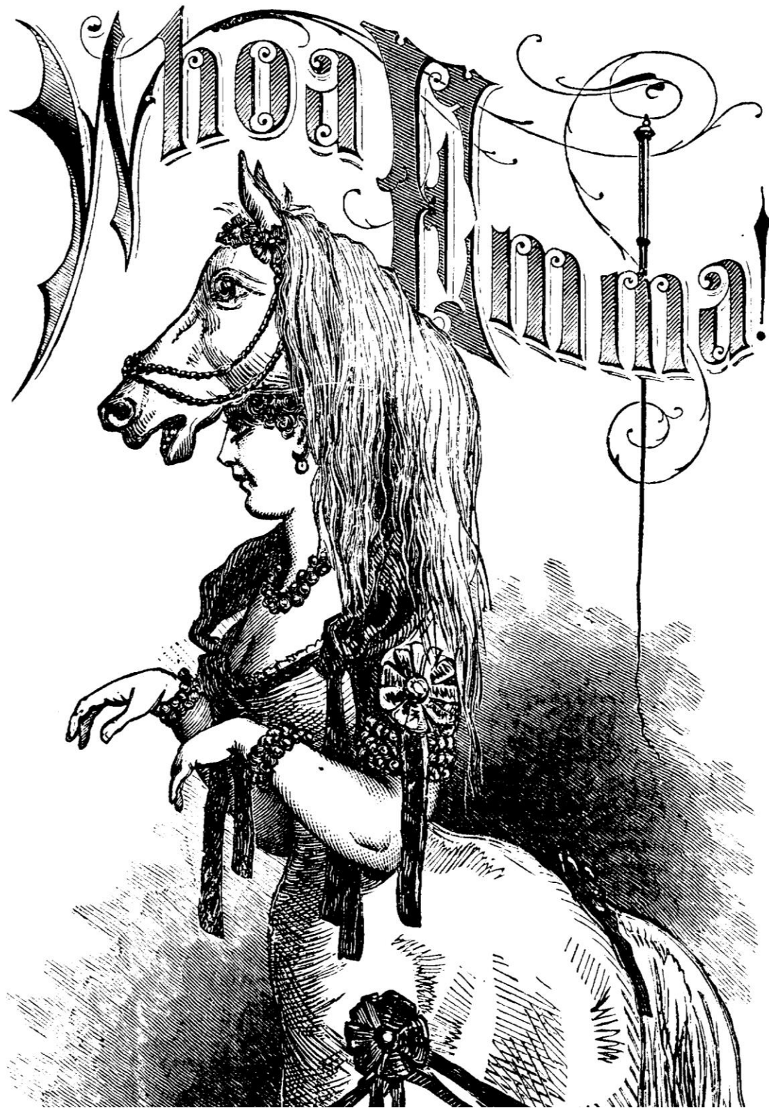
Whoa Emma! Beadle's Half-Dime Singer's Library, no. 1 (1878). Nickels and Dimes , https://dimenovels.lib.niu.edu/islandora/object/dimenovels:273316