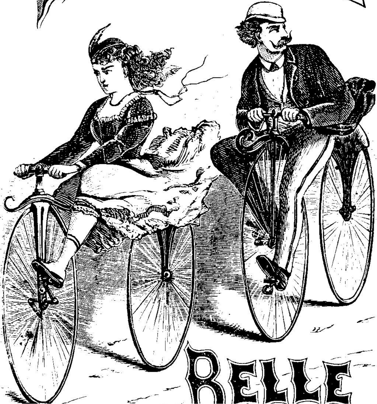
The Velocipede Belle Songster. Beadle's Dime Song Books, no. 23 (1869). Nickels and Dimes, https://dimenovels.lib.niu.edu/islandora/object/dimenovels:282334