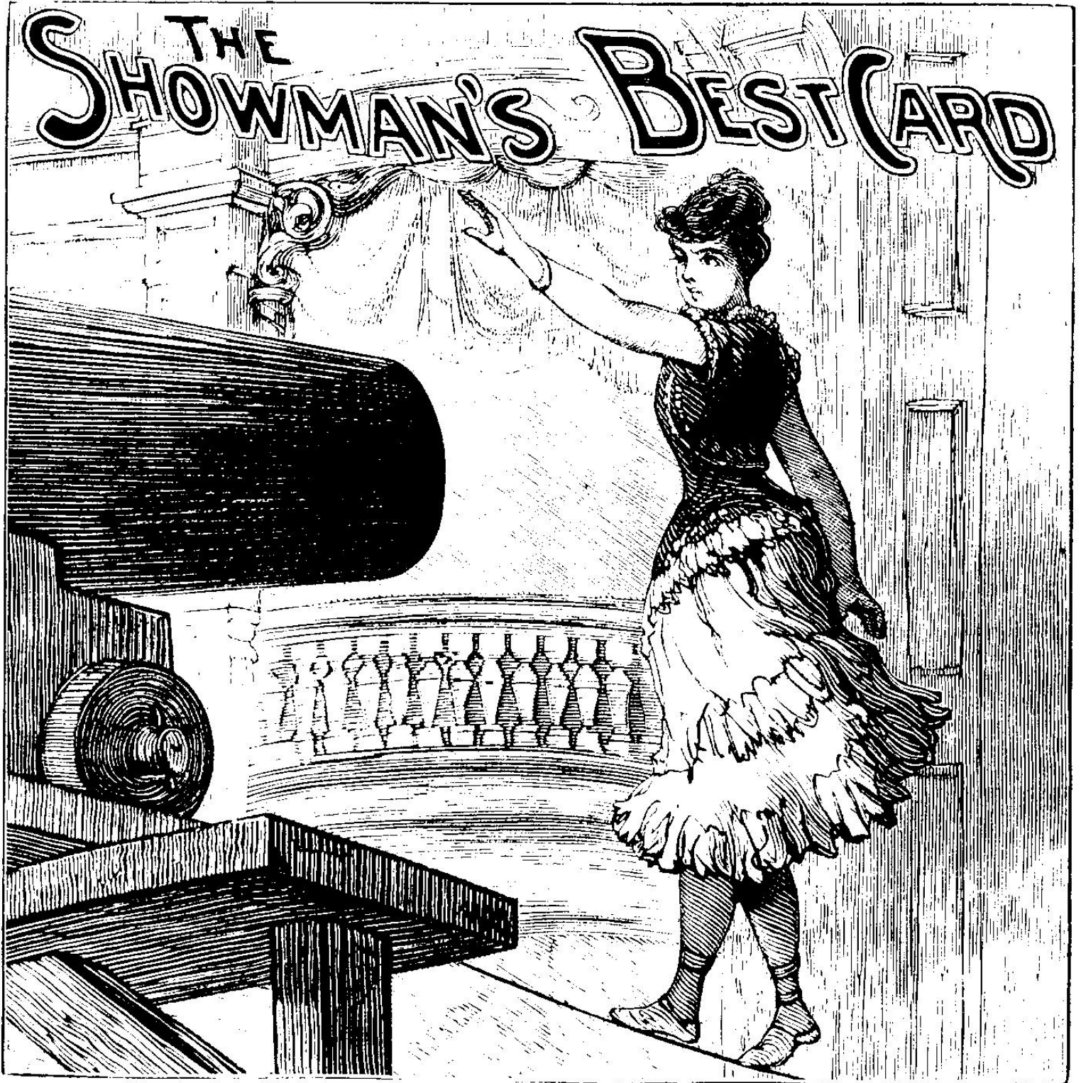
ON WENT THE GIRL UP A SERIES OF WIRES. TILL SHE TRIPPED ALONG THE LAST SET THAT LED TO THE GUN.

Whittaker, Frederick. The Showman's Best Card; or, The Mad Animal-Tamer . Beadle's Pocket Library, no. 284 (1889). Nickels and Dimes , https://dimenovels.lib.niu.edu/islandora/object/dimenovels:224961