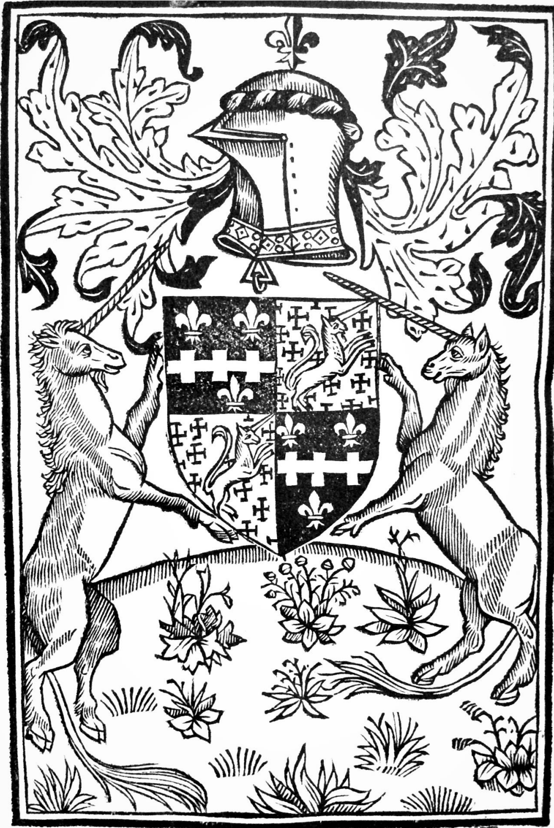
Richard Rolle, Speculum Spiritualium (Paris: Opera predicta in alma Parisio[rum] academia..., [1510].