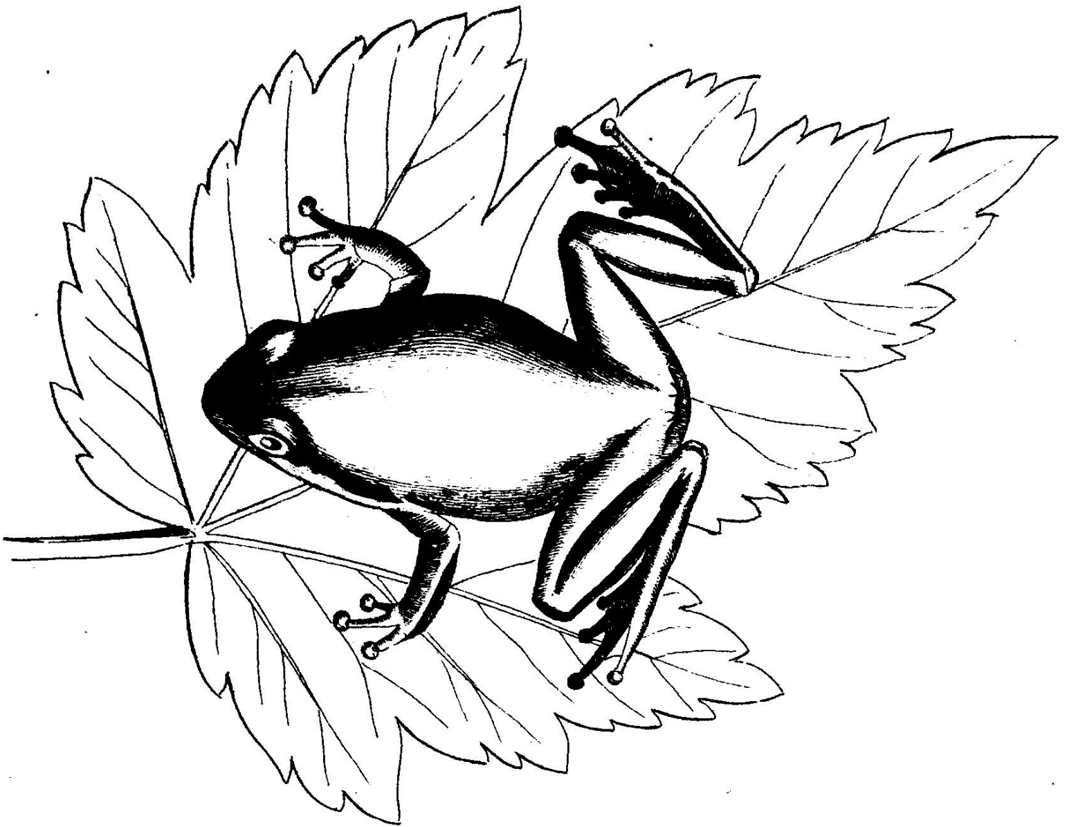
'Tree frog' from John Walcott. The Figures, Description, and History, of Exotic Animals (London : printed by W. Justins, 1788)