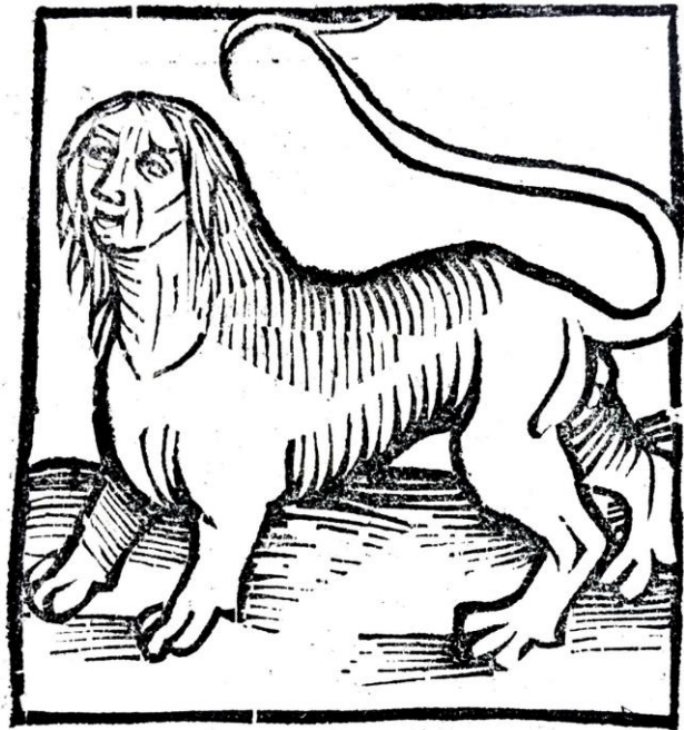
'Fantastic beasts' from Urs Graf, Hortus Sanitatis. Latin. 1517. (Strasbourg: Reinhard Beck], 1517)