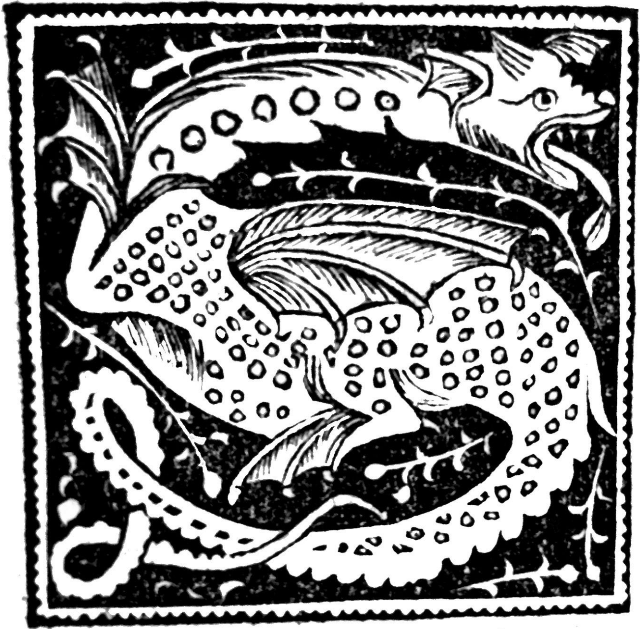
'Dragon' from La Pape, Guido, Lectura Per Utilis et Aurea Excellentissimi Utriusque Iuris Monarche Domini Guidonis Pape Super Digesto Novo et Infortiato . (Lyon: Jean Marion, 1517)