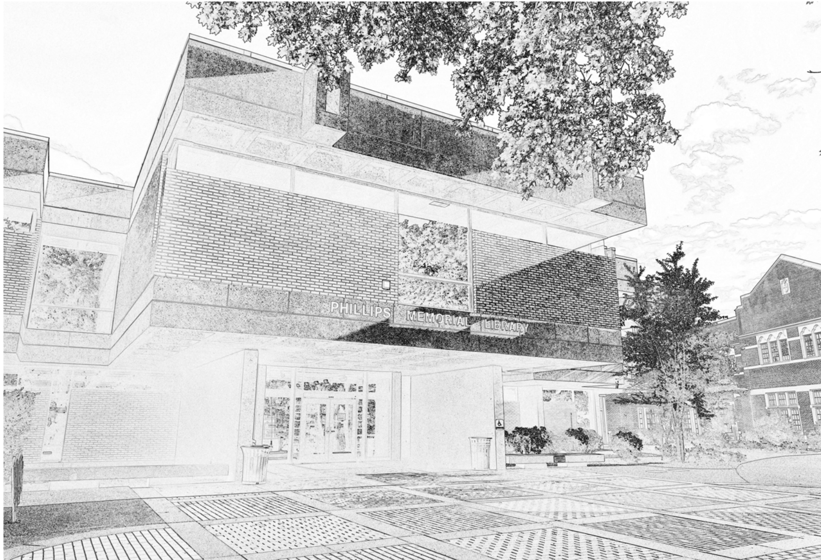
Phillips Memorial Library, Providence College.