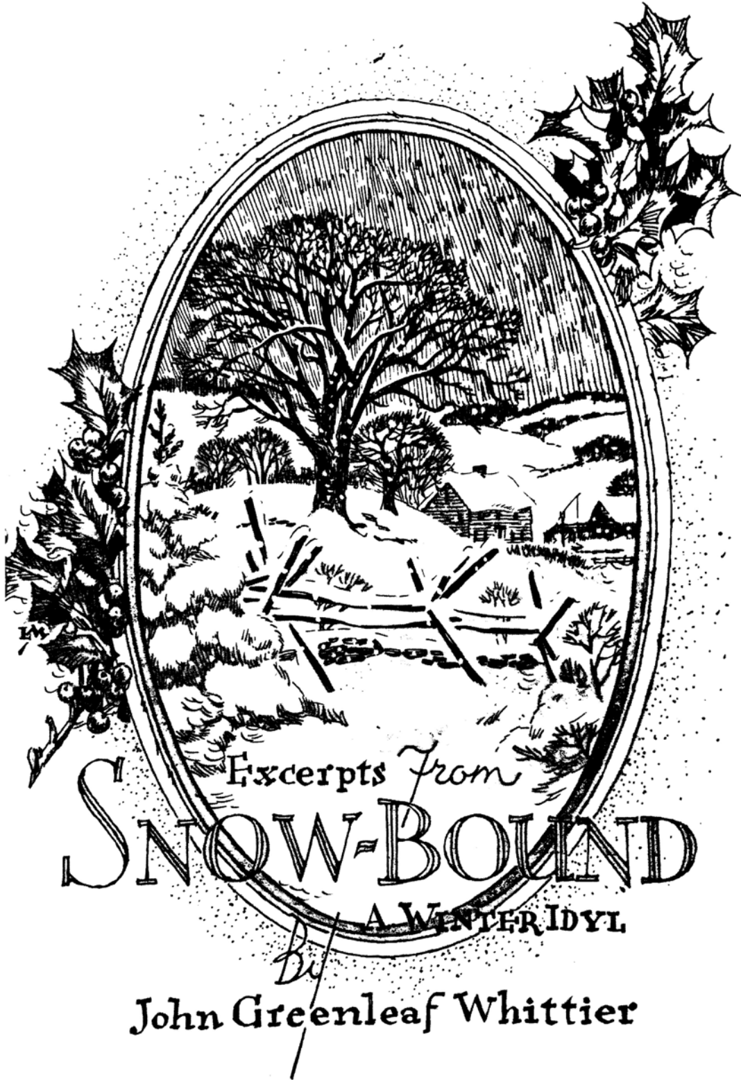
Whittier, John Greenleaf. Snow-Bound, A Winter Idyl . Excerpts, ca. 1950